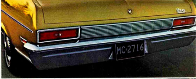
Custom Exterior rear trim

Convenience. Variable-ratio power steering for Six and V8 models, power disc brakes, Auxiliary Lighting with windshield washer fluid monitor, rear window defroster. More on pages 10 and 11.