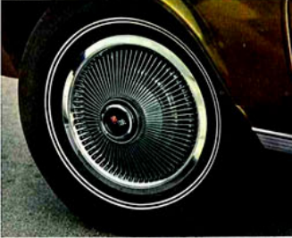
Special wheel covers

windshield antennas, new deep-cone speakers and variable dial lights. (They dim with instrument lights.) New more compact stereo tape system available with pushbutton radios: AM or AM/FM/Stereo.