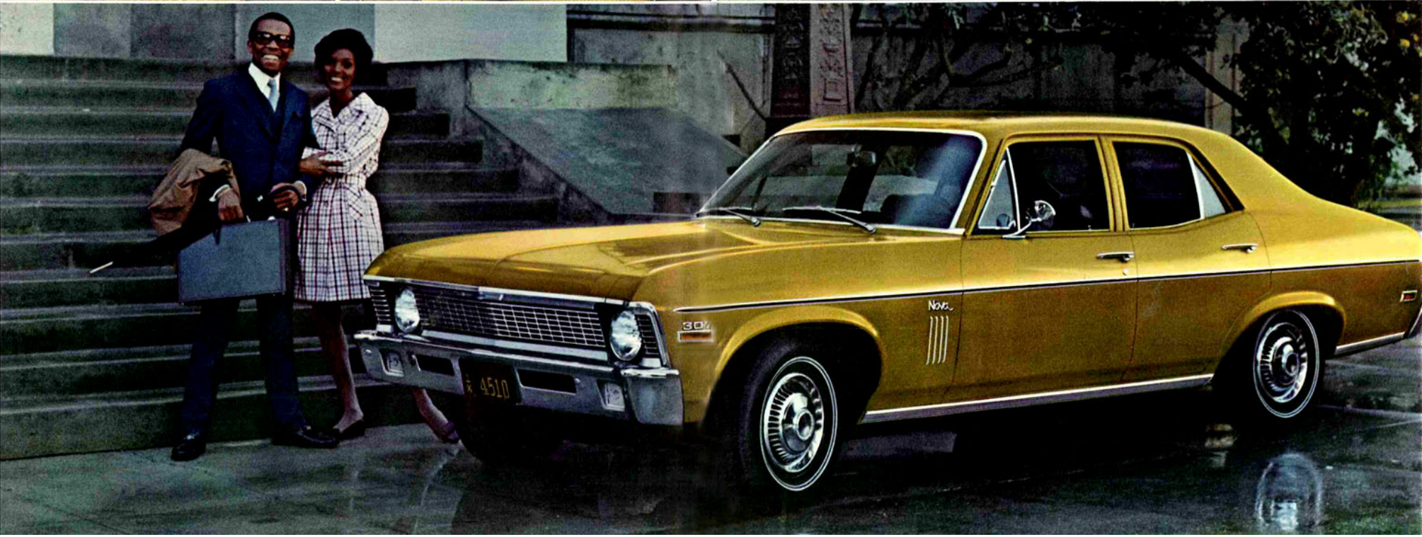
At bottom: Nova Sedan with Custom Exterior and full wheel covers

Special Wheel Covers. Specify special ribbed wheel covers a la Corvette.