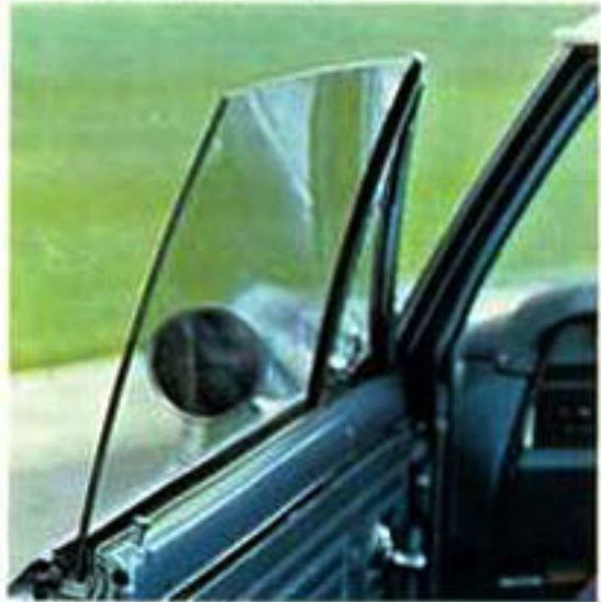
Curved Side Windows

bushed front suspension pivots. Four-link rear suspension with anti-squat feature.