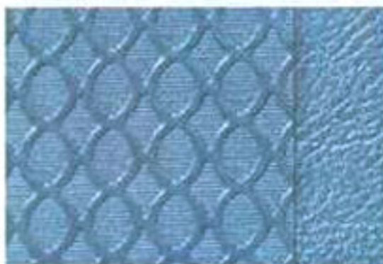
Chevelle 300 Deluxe station wagon only in all-vinyl shown in blue. (Also available in black and fawn.)