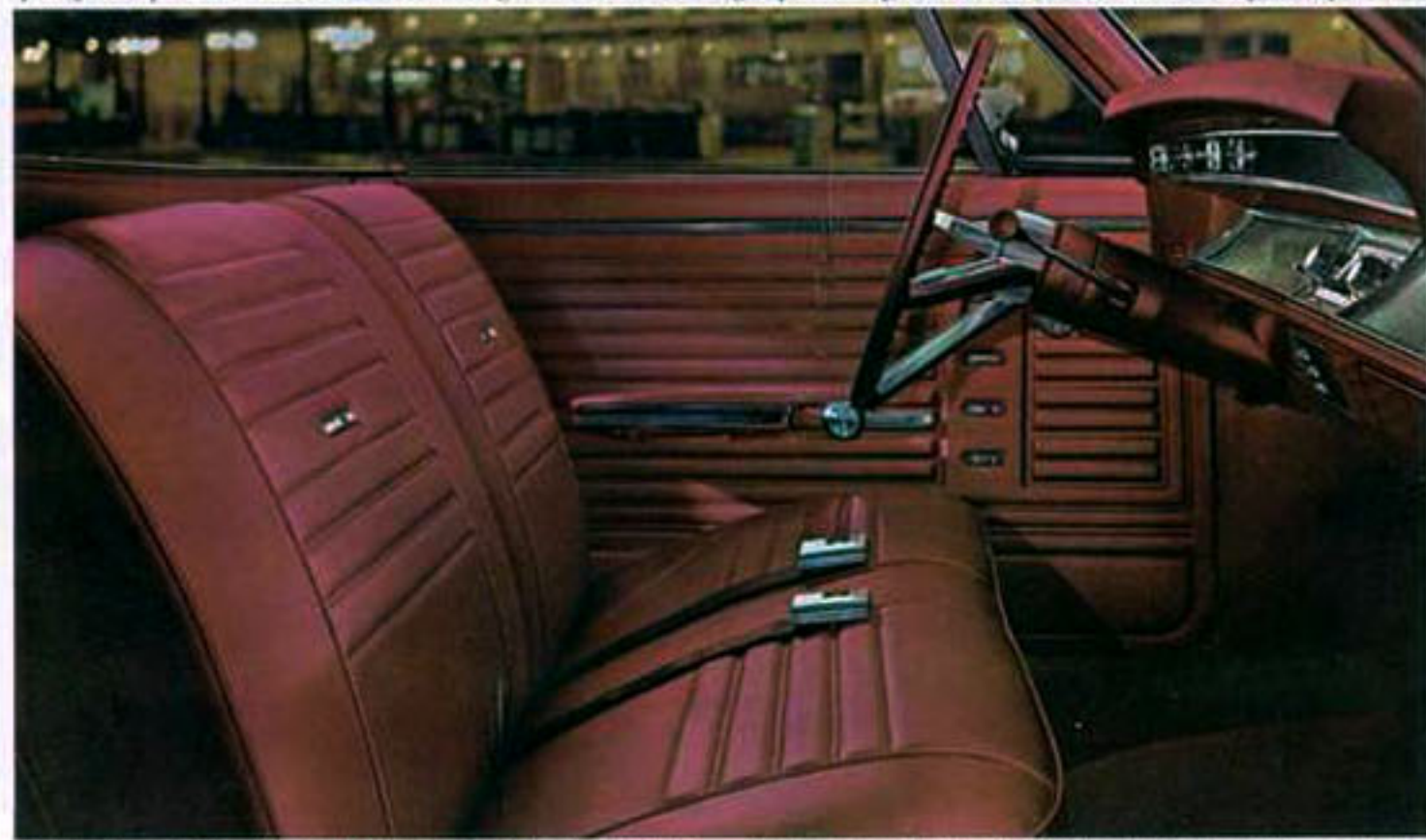
Malibu Convertible All-vinyl Interior in Red. Standard in the Malibu Convertible and SS 396 models, this interior is a good sample of the luxury you can expect to find in Chevelle sports models. Cushiony-soft seats are upholstered in textured vinyl with door panels to match. Deep-twist carpeting covers

the floor completely. And with all this beauty, you get a big measure of durability, too. You can remove most ordinary soil marks with the swish of a damp cloth. Equally good-looking is the instrument panel, available with a package consisting of temperature and oil pressure gauges, ammeter and tachometer.