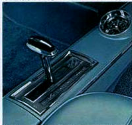
Front and Center. Center console. Order it with bucket seats. Contains shift selector, clock and convenient stowage compartment.