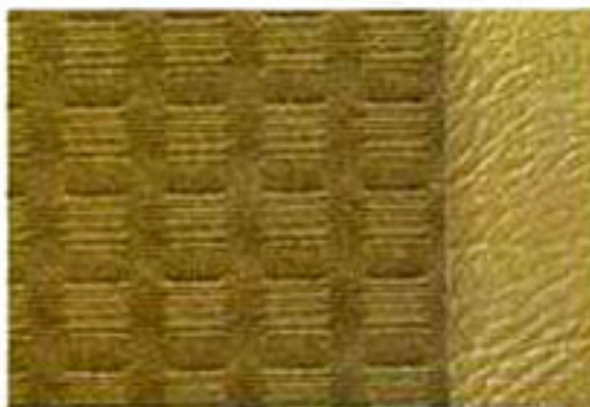
Malibu Sport Sedan deluxe interior in pattern cloth and vinyl shown in gold. (Also available in black, blue and plum.)