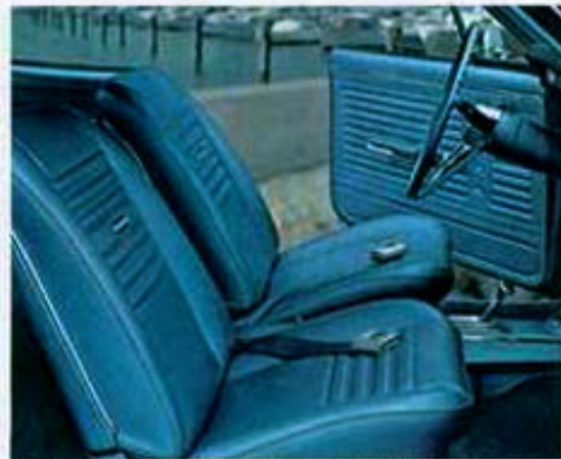
Strato-bucket Seats you can specify on SS models or Malibu Sport Coupe or Convertible lend flair and fun to driving. They provide gentle but firm back support.