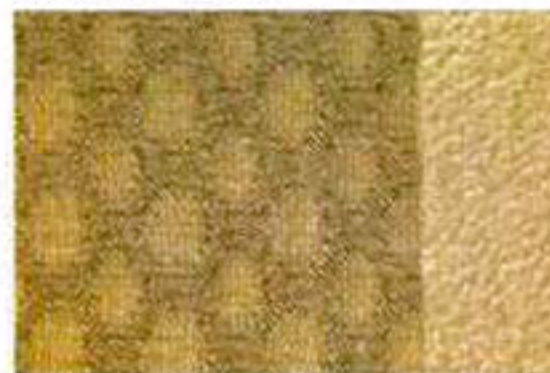
Chevelle 300 Deluxe standard interior in pattern cloth and vinyl for 2-door and 4-door sedan shown in fawn. (Also available in blue and black.)