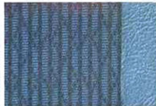
Chevelle 300 pattern cloth and vinyl in blue. (Also in fawn. Extra-cost all-vinyl black interior must be ordered with Royal Plum or Bolero Red.)