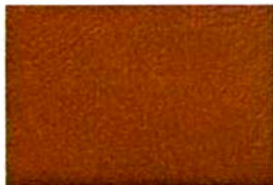
SS 396, Malibu Sport Coupe, Convertible, Malibu and Concours Wagons. All-vinyl in red. (Also in black, blue, gold, turquoise and bright blue, depending on model.)