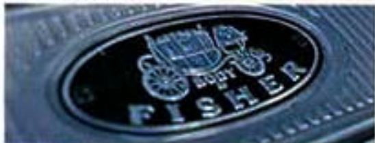
Body by Fisher

Ball-Race Steering. Parallel relay steering linkage is mounted ahead of the front wheels. Precision Ball-Race gear provides smooth, precise control. Recirculating ball-nut steering gear. Manual steering overall ratio, 28.0:1.