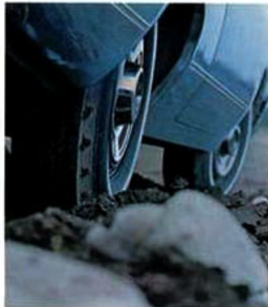
Full Coil Suspension

Perimeter-Type Frame. Additional rigidity and strength without excessive weight through the use of welded, torque-box design. Supporting structures for front and rear suspensions are built in. Passenger compartment surrounded by all-welded steel unit with full-length side rails joined laterally by three crossmembers.