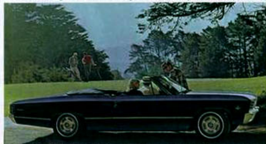
Malibu Convertible in Royal Plum. Depending on the model you specify, you can power this convertible with a spirited 195-hp Turbo-Fire 283 V8 or a pinch-penny 140-hp Turbo-Thrift 230 Six. Other engine availabilities range up to 325 hp.