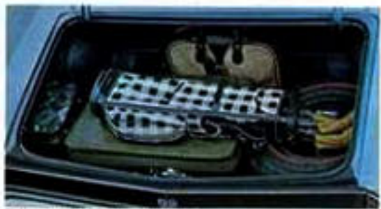
Spacious Luggage Capacity

Full Coil Suspension. A husky coil spring at each wheel cushions Chevelle's ride so that even the back roads feel like boulevards. Combined with double-acting shock absorbers all around and a front stabilizer bar and built-in leveling action, Chevelle's Full Coil suspension gives the car superb poise even on the roughest roads. Anti-dive front suspension is independent with wishbone-type lower control arms and rubber-