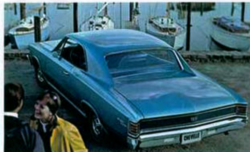
SS 396 Sport Coupe in Marina Blue. Here's the way most people see this smart coupe—going away. Down under—Full Coil suspension and double-acting shock absorbers. Special accent stripes available.