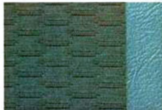
Malibu standard interior pattern cloth and vinyl shown in turquoise. (Also available in black, blue, maroon and gold.)