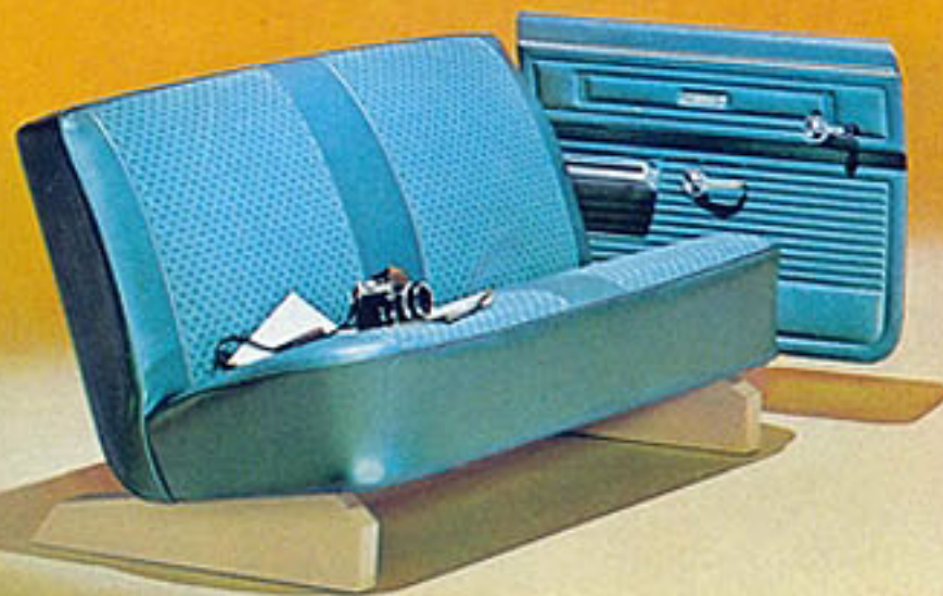
Chevelle 300 Deluxe Interior in aqua.