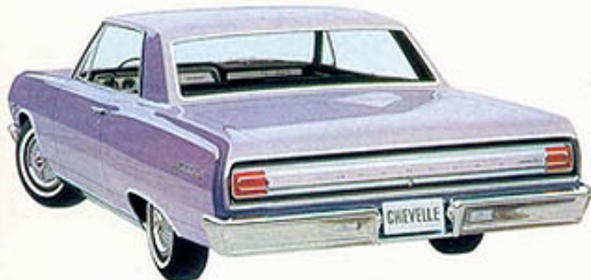
Malibu Super Sport Coupe in Evening Orchid.

A full complement of engines and transmissions satisfies the urge to go. Indulge yourself in luxury by ordering features like Four-Season air conditioning, AM/FM radio with FM stereo and a passel of power assists. Conclusion: Chevelle's the beautiful shape for '65.