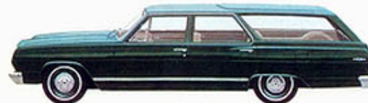
Chevelle 300 Deluxe 4-Door 6-Passenger Station Wagon in Cypress Green.