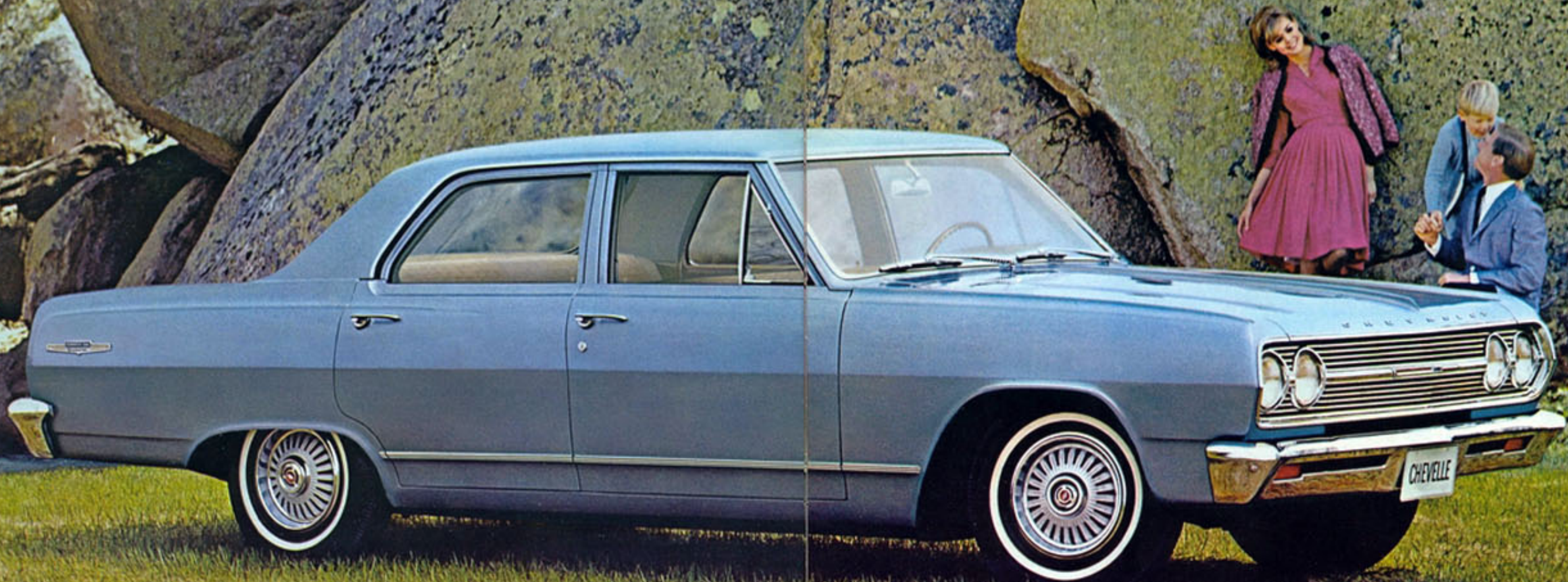
Chevelle 300 Deluxe 4-Door Sedan in Mist Blue.

Included in the base illustration in this catalogue are certain of Chevelle's extra-cost Options and Custom Features. You could find a more complete listing on pages 14 and 16.