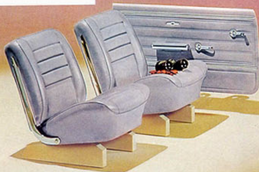
Malibu Super Sport Interior in slate.