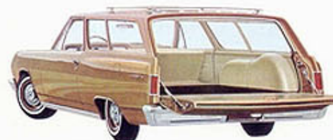
Chevelle 300 2-Door 6-Passenger Station Wagon in Sierra Tan.