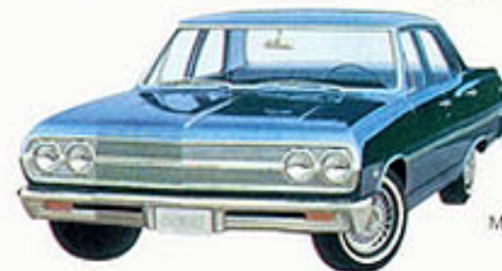
Malibu 4-Door Sedan in Danube Blue.