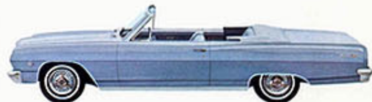
Malibu Super Sport Convertible in Glacier Gray.