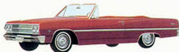
Malibu Convertible in Madaira Maroon.

As in all '65 Chevelles, every Malibu is loaded with easy-care features like self-adjusting Safety-Master brakes, Delcotron generator that helps prolong battery life, flush-and-dry rocker panels to combat rust and corrosion. As for engines and transmissions, check the power team chart on page 14 for your personal preference.