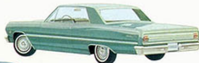
Malibu Sport Coupe in Willow Green.