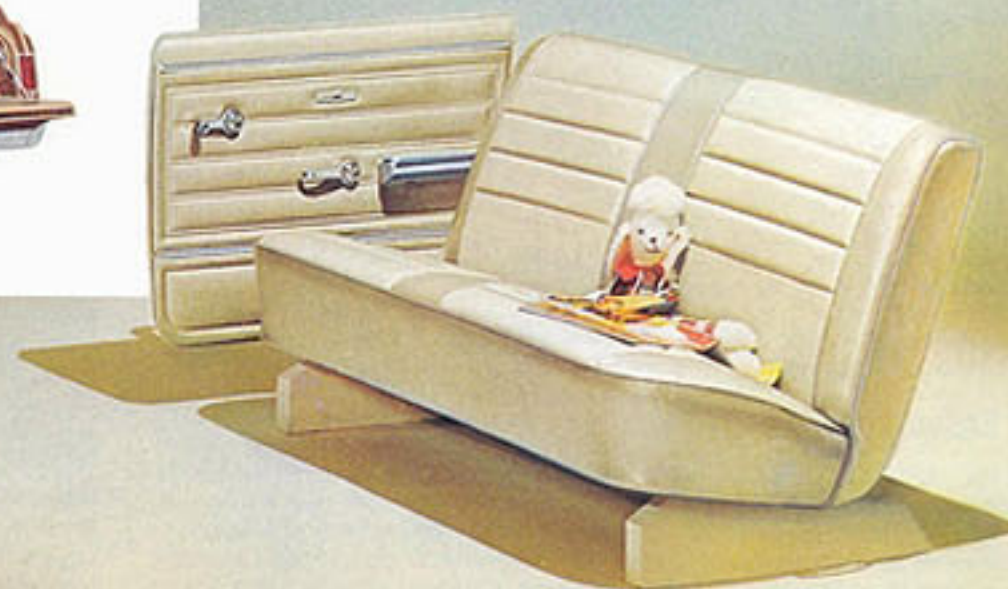
Malibu Station Wagon Interior in fawn.

Spare tire and wheel are concealed in right rear quarter panel.