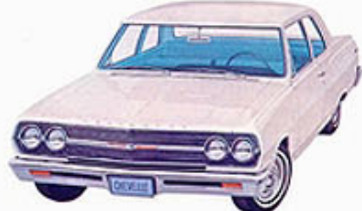
Chevelle 300 2-Door Sedan in Ermine White.