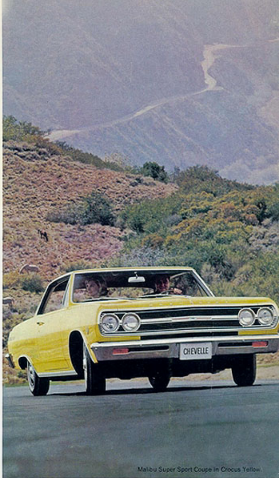
Malibu Super Sport Coupe in Crocus Yellow.

Power Brakes • Add a feather touch to stopping with Chevelle power brakes. A large power cylinder reduces braking effort by nearly one-third. Low pedal height aids quick application; big vacuum reserve supplies extra braking power.