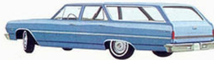
Malibu 4-Door 6-Passenger Station Wagon in Mist Blue.

You can count on long service from all of Chevelle's easy-care features. Like sedans, these wagons ride with remarkable new smoothness, with remarkable new quietness. As for additional niceties, order those you like best from Options and Custom Features that are available. For instance, you might want to fit your wagon with the new trailer wiring harness, Superlift air-adjustable shock absorbers and a chrome luggage roof rack.