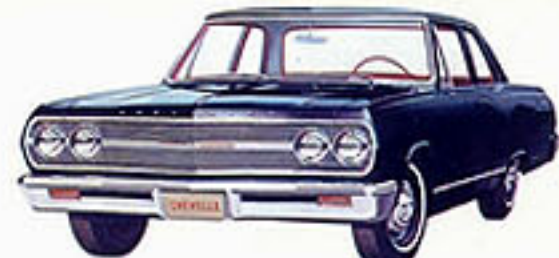
Chevelle 300 Deluxe 2-Door Sedan in Tuxedo Black.