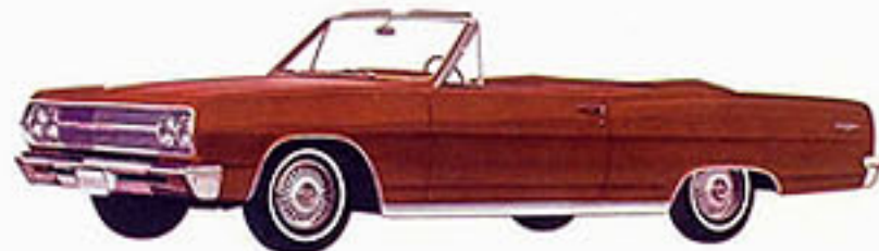
Chevelle 300 Convertible in Royal Red.