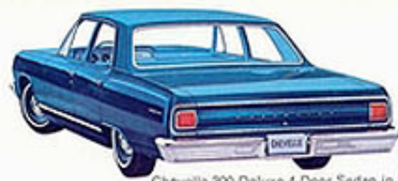
Chevelle 300 Deluxe 4-Door Sedan in Tahitian Turquoise.

You enjoy the savingest benefits with these Chevelle 300s: 2-Door Sedan, 4-Door Sedan Convertible, and 2-Door 6-Passenger Station Wagon. On the outside, the clean styling is complemented by curved side glass. Tasteful trim includes a wide body sill molding, bright metal ventipane frames, 300 series nameplate and a colorful new emblem on the all-new Chevelle grille. Interiors of durable cloth and vinyl upholstery in fawn only on 2- and 4-Door Sedan (all vinyl in Wagon and Convertible). And check a few of the features that insure comfort and convenience: front armrests, foam-cushioned front seat and four-position ignition switch that allows key removal only when ignition is locked. Wide-opening doors permit easy entry and exit.