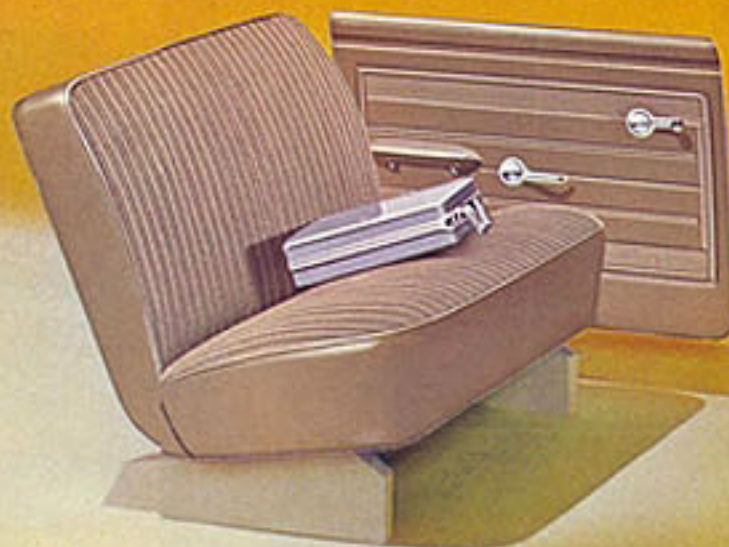
Chevelle 300 Interior in fawn.