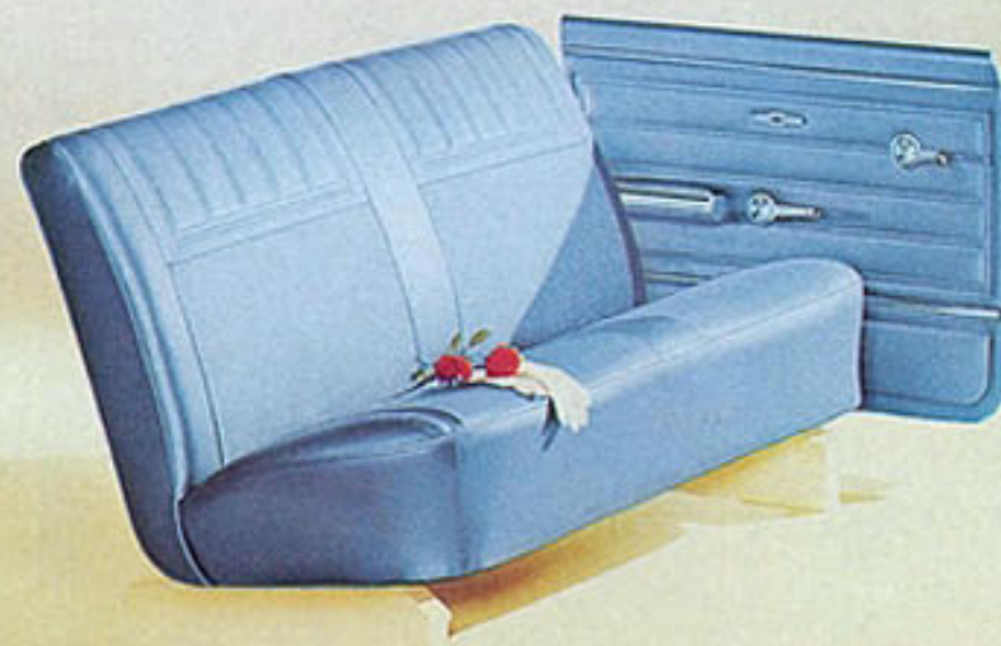
Malibu Interior in blue.

Covered in the illustrations and descriptions in this catalogue are some of the extra cost Options and Custom Features for Chevelle. A more complete list appears on pages 14 and 16.