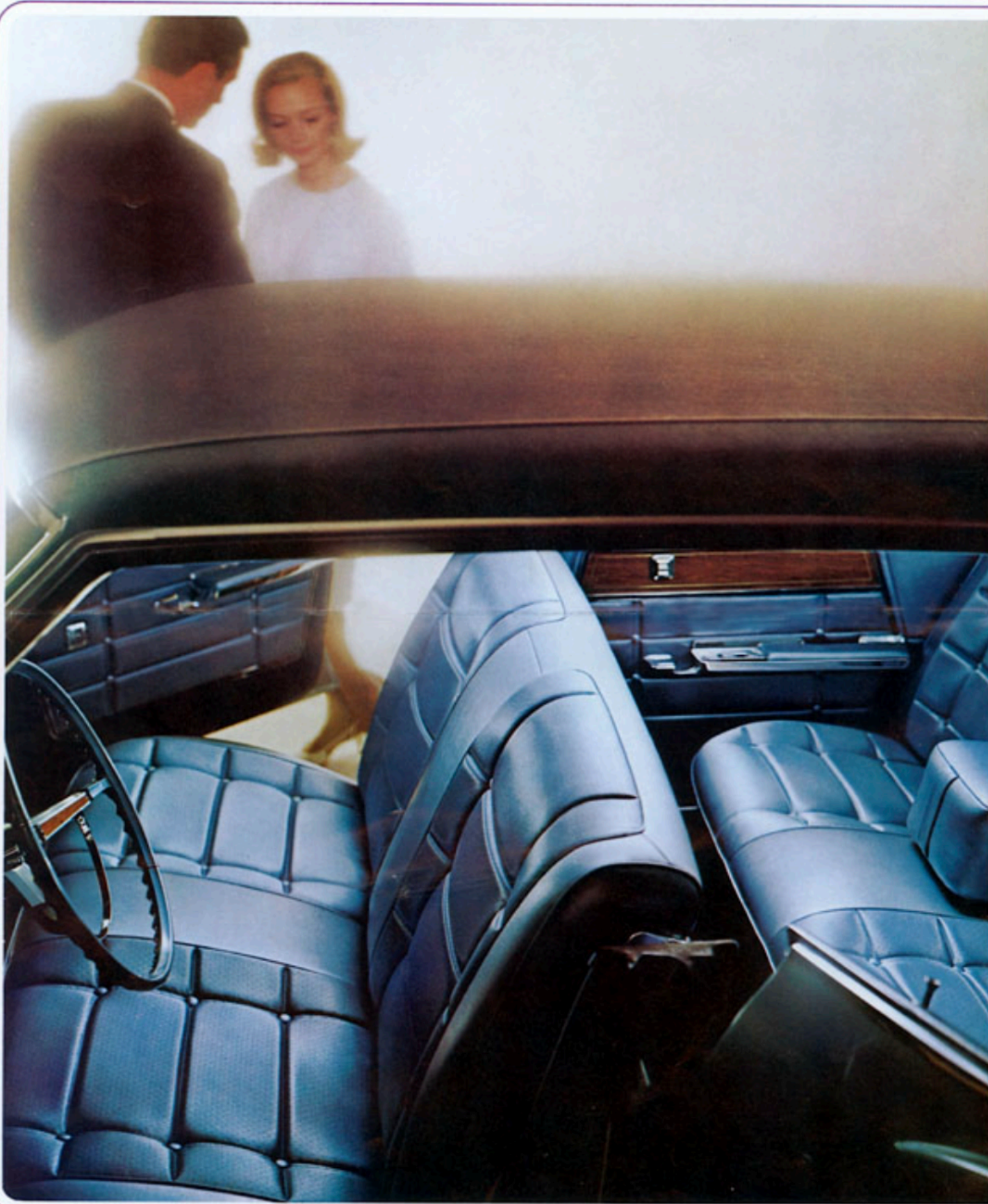
Shown on front cover: Caprice Custom Sedan in Mist Blue.