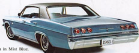
Caprice Custom Sedan in Mist Blue.

All illustrations and specifications contained in this literature are based on the latest product information available at the time of publication approval. The right is reserved to make changes at any time without notice in prices, colors, materials, equipment, specifications and models, and also to discontinue models. CHEVROLET MOTOR DIVISION, GENERAL MOTORS CORPORATION, DETROIT, MICHIGAN 48202.