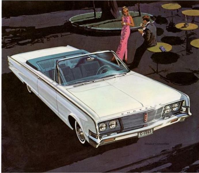
Windsor 4-Door Convertible

seat design, a ride in a 1965 Saratoga 300 is a rewarding experience in comfort. Truly, Saratoga 300 brings you all the benefits of the Chrysler way of life . . . in its own distinctive way. Test it once, and you'll agree.