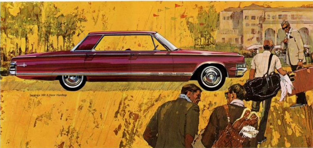
Saratoga 300 4-Door Hardtop