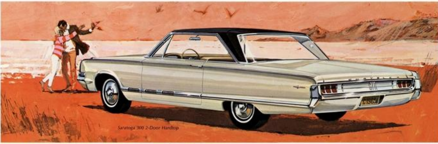
Saratoga 300 2-Door Hardtop