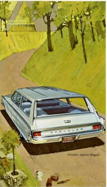
Windsor Station Wagon