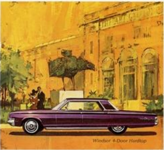
Windsor 4-Door Hardtop

quality construction, and most of the features and convenience touches that distinguish every other fine Chrysler series. Just drive a Windsor once and you'll be convinced that here is a truly fine automobile you'll be proud to own . . . proud to drive.