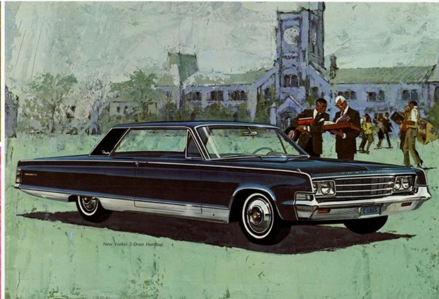
New Yorker 2-Door Hardtop

Side window glass curves gracefully to complement the smooth flowing lines. Notice that Hardtop models have an exclusive vinyl side panel treatment. Inside, the combination of rich vinyls and satiny jacquards are pleasing to the touch. The instrument panel is impressively simple in appearance, enhanced by a rich wood-grained insert. Top is padded for safety and to eliminate glare. Inside the glove compartment are a series of carefully-chosen convenience accessories that include a hidden tissue dispenser, a handy sliding tray to keep maps and manuals in order and easy to reach, and cup recesses on the inside of the compartment door. As a special convenience for those who drive on toll bridges and pay-as-you-go turnpikes, and for feeding hungry parking meters, there is a coin-holder built into the centre-panel ashtray drawer. These thoughtful touches are typical of the easy grace that marks the Chrysler way of life.