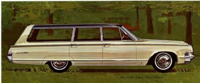
New Yorker 4-Door Station Wagon

There is a distinctive elegance about the New Yorker (6 windows) 4-Door Sedan (shown at right). Other choices offer two good-looking Hardtops and the versatile, convenient Station Wagon (seen above). Whichever you choose, you'll find that driving a New Yorker is 1965's finest means of enjoying the Chrysler way of life.