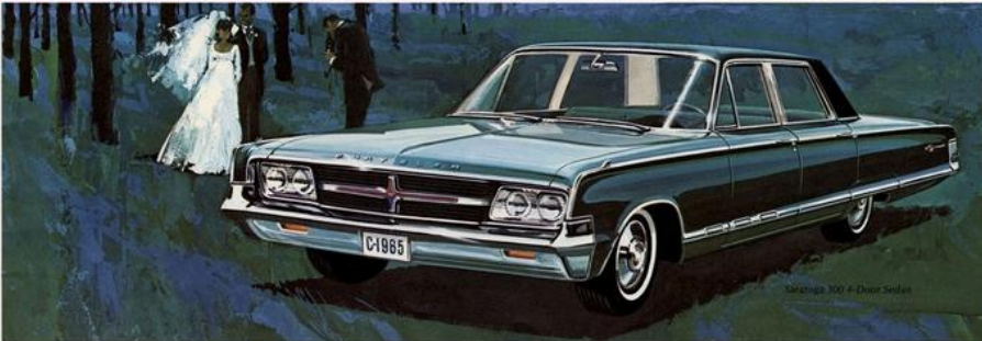
Saratoga 300 4-Door Sedan

Whether you choose the elegant 4-Door Sedan, or either of the dashing Hardtops, Saratoga 300 offers you a high level of painstaking quality. The powerful 383-cu. in. V-8 engine delivers top performance under any driving conditions and for flashing extra power there is the optional 383 cu. in. V-8 with power pak. The Torque-Flite automatic transmission is controlled by a convenient column-mounted gear selector lever, with the position indicator on the dash. On hardtops, a floor mounted console gear selector is available. Like all Chrysler models, the Saratoga 300 has an exceptionally roomy interior . . . room to spare!