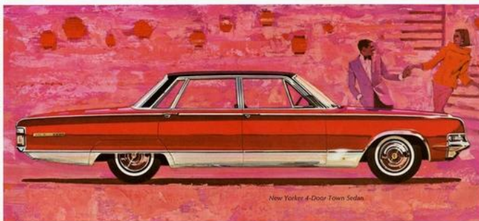
New Yorker 4-Door Town Sedan