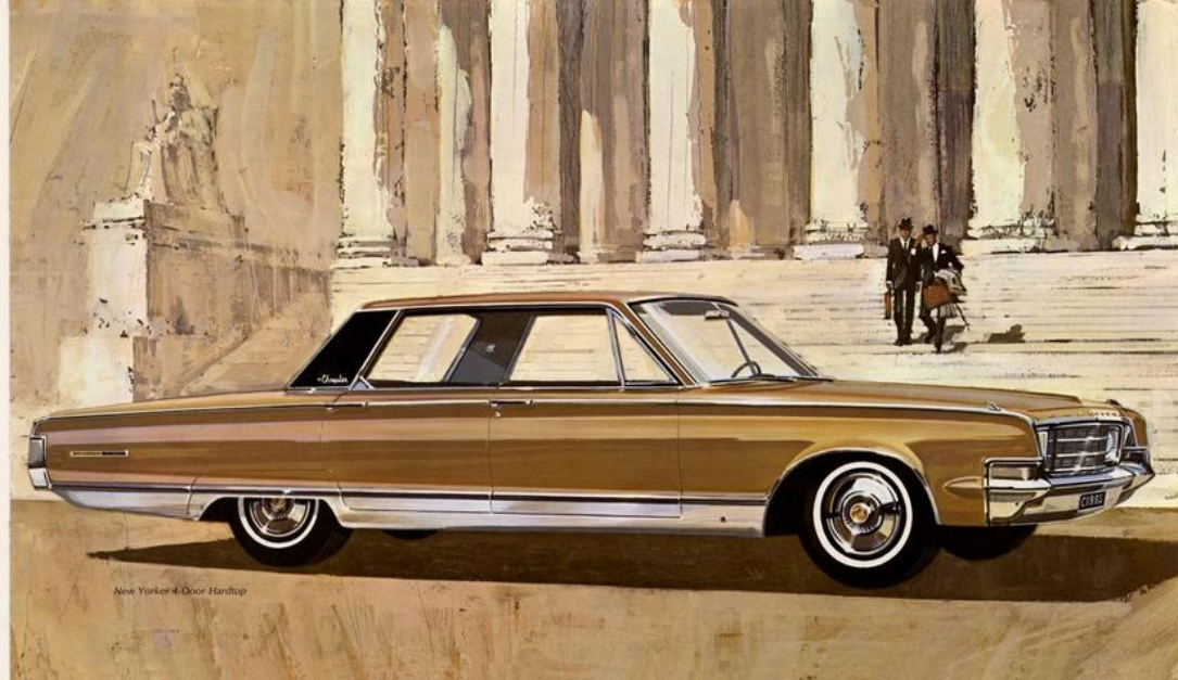
New Yorker 4-Door Hardtop

YOU'LL ENJOY THE CHRYSLER WAY OF LIFE For 1965, Chrysler has attained new heights of handsomeness, new levels of luxury and dramatic new dimensions in style and performance. Long and imposing in appearance, the 1965 Chrysler conveys a sense of crispness and "just right" elegance that gives you that unmistakable aura of success. Its totally new body design takes advantage of the latest advances in automotive technology and metallurgical research... the Chrysler suspension offers the ultimate in riding comfort... ingenious accessories and interior features provide a new world of convenience for driver and passengers alike. In short, Chrysler has spared no effort in 1965 to bring the very best to you... to ensure that more than ever before, you'll enjoy the Chrysler way of life!