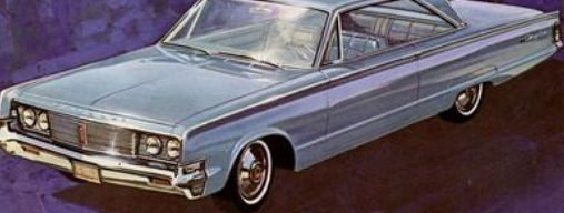
Windsor 2-Door Hardtop

Inside, all the Windsor series offer the spaciousness and feeling of big car luxury that is a Chrysler hallmark. Distinctive styling and elegant fabric-vinyl combinations not only delight the eyes, but provide lasting durability. Model choice in the Windsor provides a wide range of versatility and value. You can pick from the youthful Convertible, the impressive 4-Door Sedan, and either of the two elegant Hardtops. Also, there's the spacious Station Wagon, that is as practical as it is beautiful. In any model, Windsor brings you the best of the Chrysler way of life . . . at a price that makes it easy to move up to Chrysler.