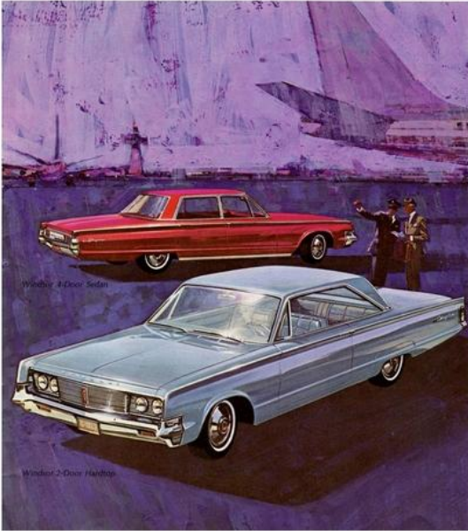
Windsor 4-Door Sedan