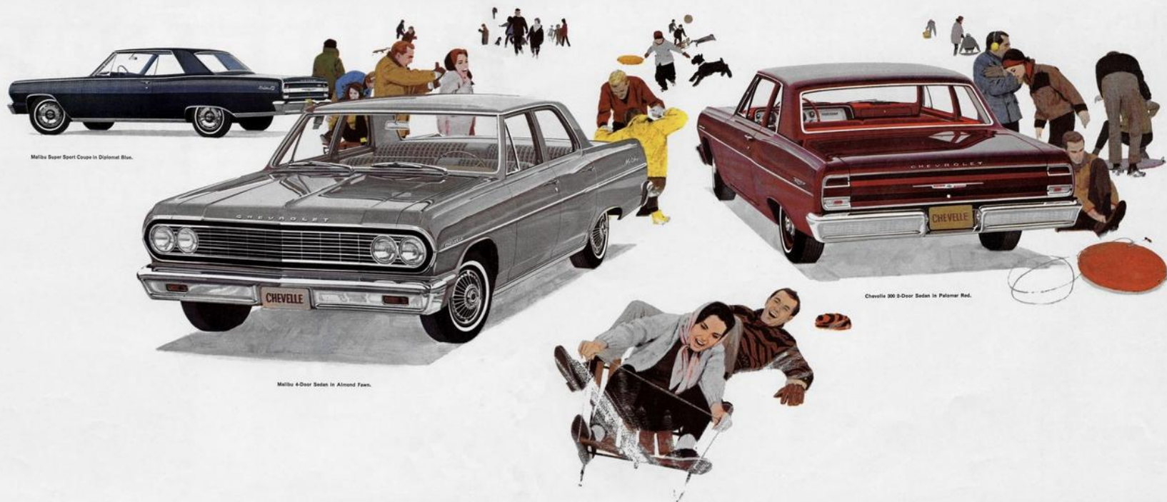
Malibu Super Sport Coupe in Diplomat Blue.

2 Front cover: Malibu Super Sport Coupe in Ermine White.