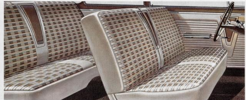
Chevelle 300 2-Door Sedan interior in fawn.