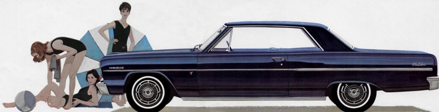
Malibu Sport Coupe in Diplomat Blue.