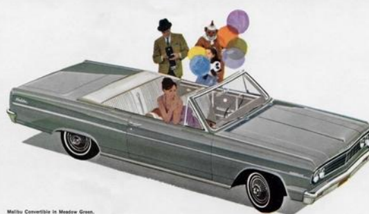
Malibu Convertible in Meadow Green.

High, wide door openings make it easy to slip in and out of every '64 Chevelle. And inside, there's space for a family-sized gathering. Curved windows add shoulder room. Plenty of head, hip and leg room, too.