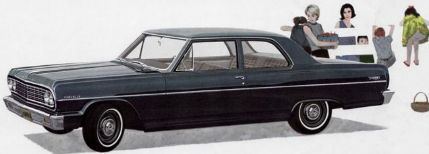
Chevelle 300 2-Door Sedan in Belaire Green.

Save. That's word one to keep in mind about the brand-new 300 series. It's the savin'est way to enjoy Chevelle's novel, zestful motor-ing. Word two is luxury, a real bunch of it. Automatic interior lighting. Armrests front and rear plus two handy rear ashtrays. Color-keyed steering wheel with horn ring. Foam-cushioned front seat, automatic cigarette lighter and key-locking glove compartment. Every Chevelle 300 also numbers such niceties as easy-care vinyl headlining, electric windshield wipers and dual sun visors. Choose from four Chevelle 300 models: 2-Door Sedan, 4-Door Sedan, 2-Door Wagon (exclusive in the Chevelle lineup) and 4-Door Wagon. Each model carries six adults in luxurious comfort. Each is built by Chevrolet for the first time. And like all Chevilles, 300 Sedans have big trunks that can handle a vacation-worth of luggage with ease. Counter-balanced trunk lid and low bumper-level loading, too.