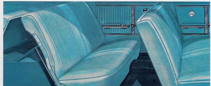
Malibu 4-Door 3-Seater Station Wagon interior in aqua.