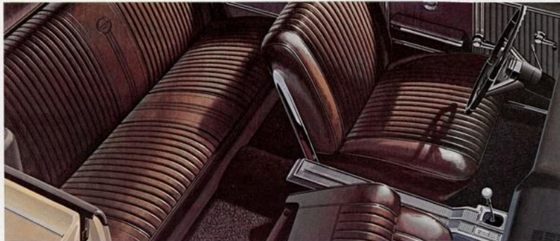
Malibu Super Sport Coupe interior.