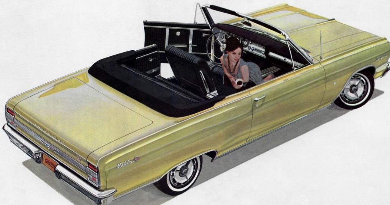
Malibu Super Sport Convertible in Goldleaf Yellow.