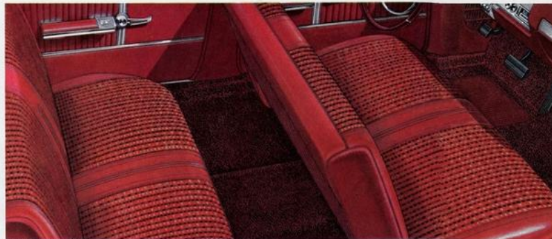
Malibu 4-Door Sedan interior in red.