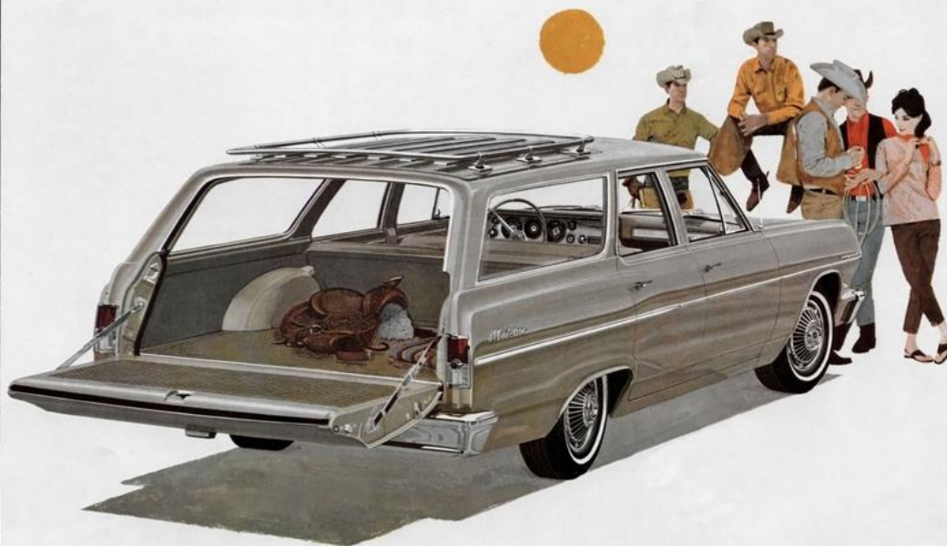
Malibu 4-Door 6-Passenger Station Wagon in Desert Beige with Roof Luggage Carrier*.