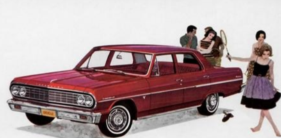
Malibu 4-Door Sedan in Ember Red.