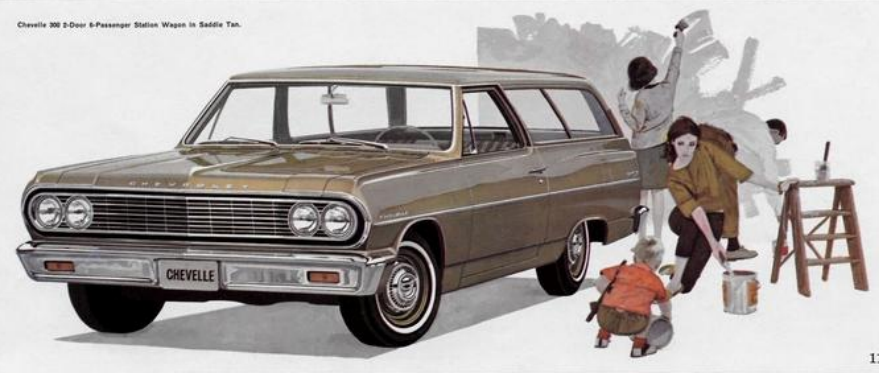
Chevelle 300 2-Door 6-Passenger Station Wagon in Saddle Tan.