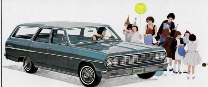
Malibu 4-Door 3-Seat Station Wagon in Azure Aqua.