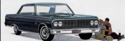
Malibu Super Sport Coupe in Lagoon Aqua.