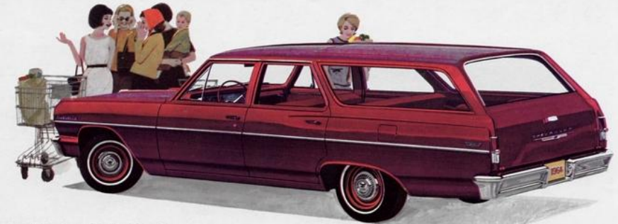
Chevelle 300 4-Door 6-Passenger Station Wagon in Palomar Red.