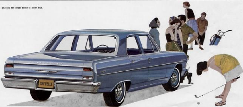
Chevelle 300 4-Door Sedan in Silver Blue.