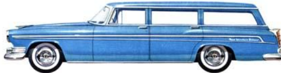
NEW YORKER DELUXE ESTATE WAGON