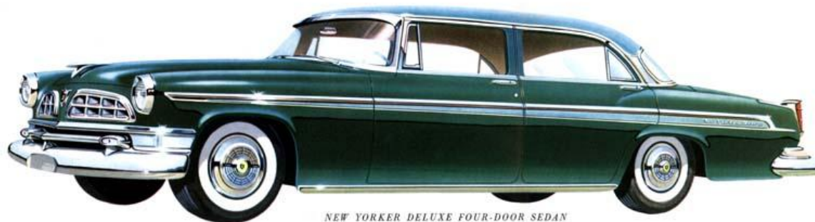
NEW YORKER DELUXE FOUR-DOOR SEDAN