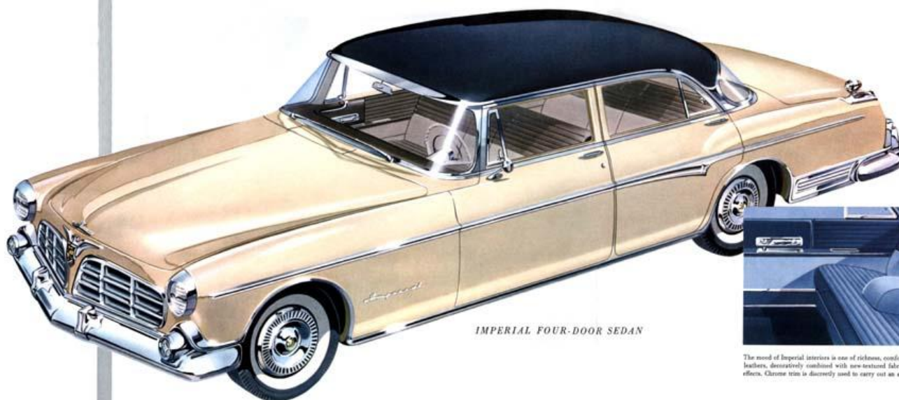
IMPERIAL FOUR-DOOR SEDAN

The mood of Imperial interiors is one of richness, comfort and relaxation. Fine leathers, decoratively combined with new-textured fabrics, achieve distinctive effects. Chrome trim is discreetly used to carry out an air of refinement.