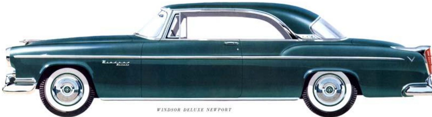
WINDSOR DELUXE NEWPORT