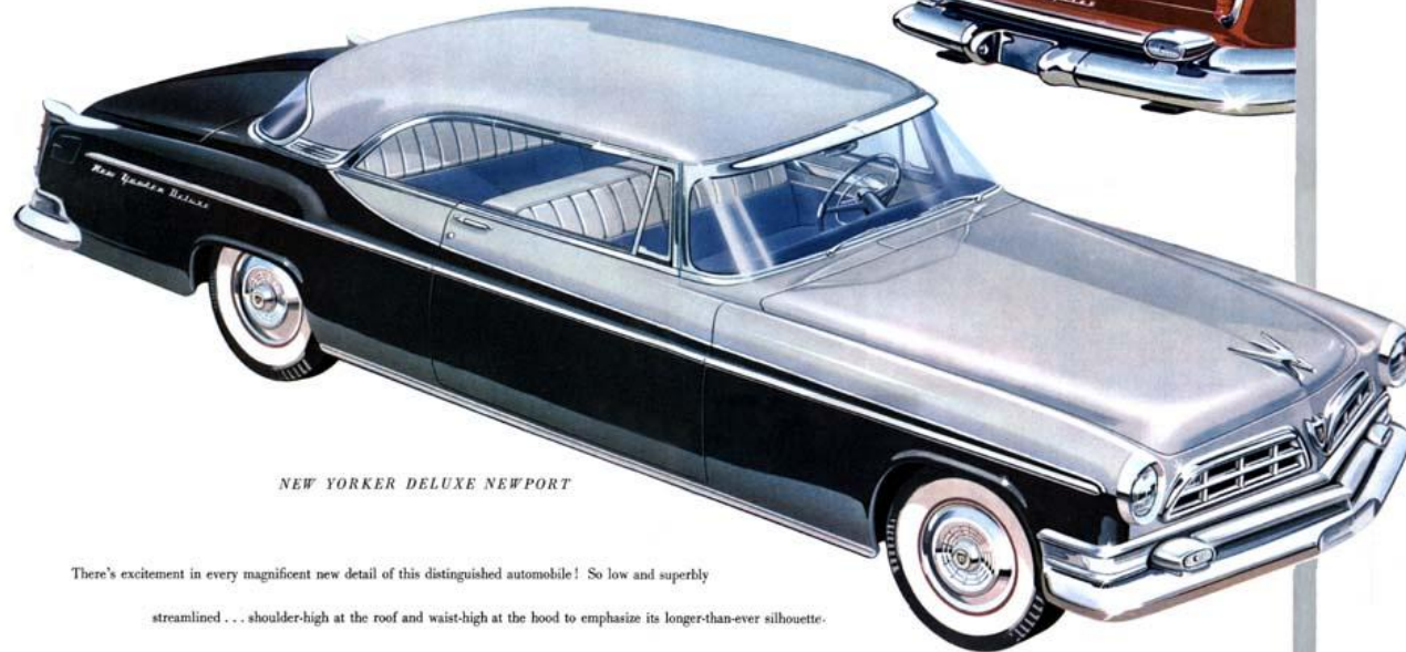
NEW YORKER DELUXE NEWPORT

There's excitement in every magnificent new detail of this distinguished automobile! So low and superbly streamlined... shoulder-high at the roof and waist-high at the hood to emphasize its longer-than-ever silhouette.