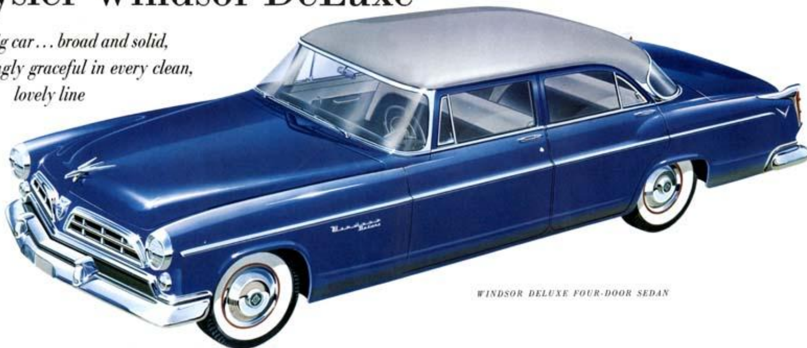
WINDSOR DELUXE FOUR-DOOR SEDAN

... a big car ... broad and solid, yet strikingly graceful in every clean, lovely line