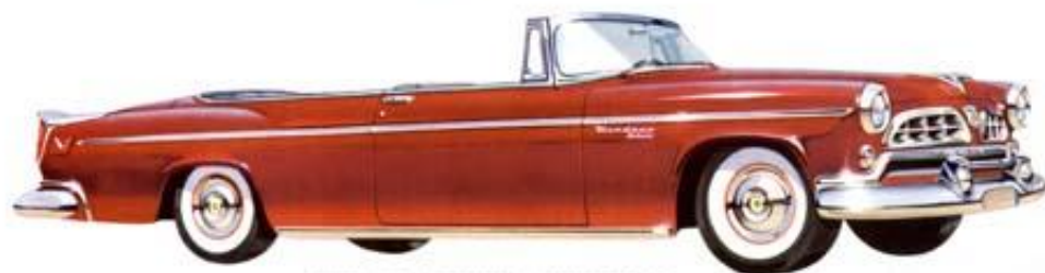
WINDSOR DELUXE CONVERTIBLE