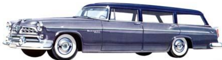
WINDSOR DELUXE ESTATE WAGON