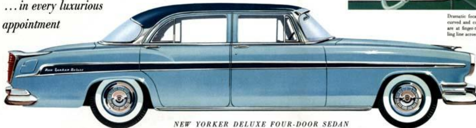
NEW YORKER DELUXE FOUR-DOOR SEDAN

...in every exciting line ...in every luxurious appointment