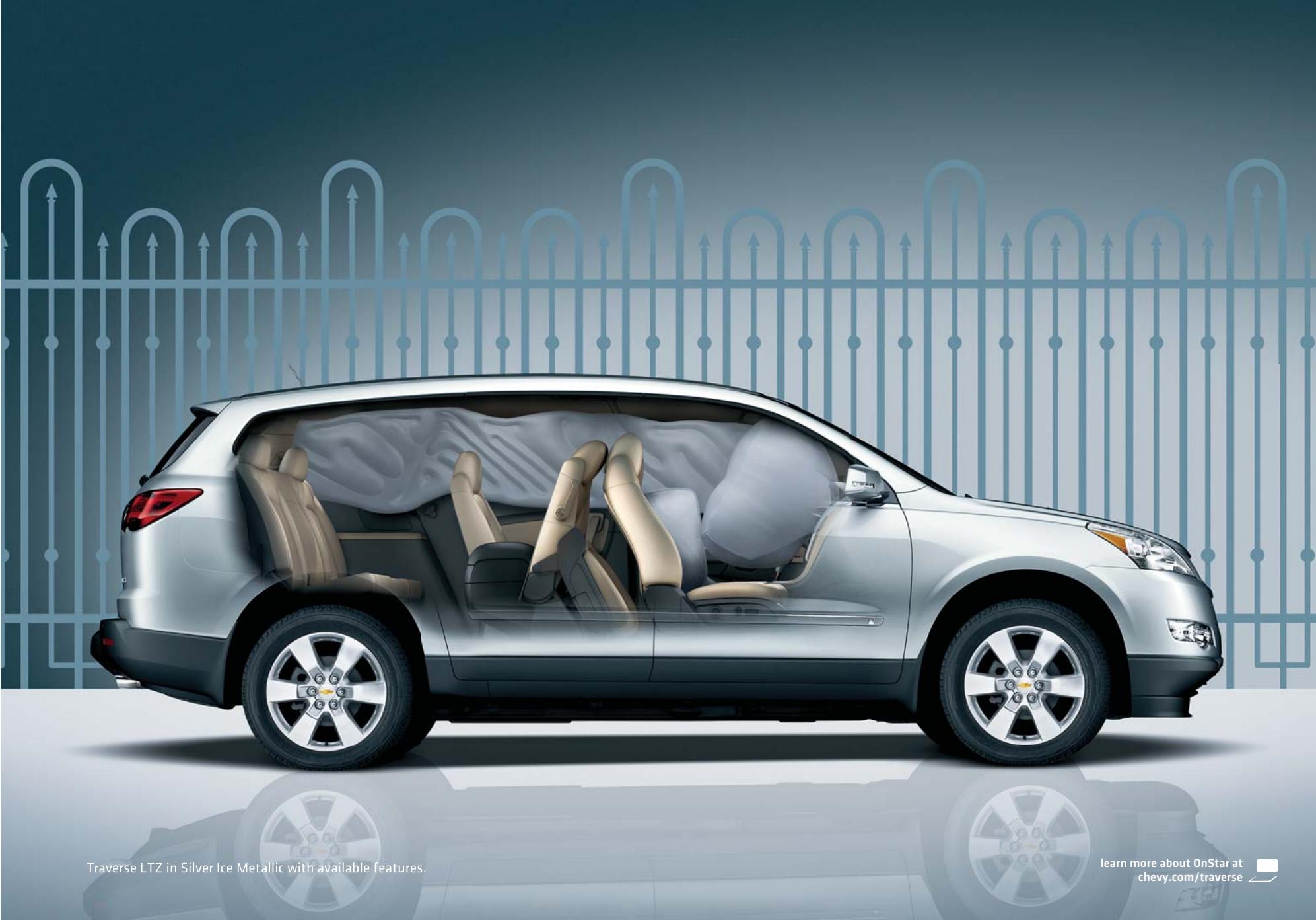
Traverse LTZ in Silver Ice Metallic with available features.

1 Side-impact crash test rating is for a model tested with standard head-curtain side-impact air bags (SABs). Government star ratings are part of the National Highway Traffic Safety Administration's (NHTSA's) New Car Assessment Program ( www.safercar.gov ). 2 Air bag inflation can cause severe injury or death to anyone too close to the bag when it deploys. Be sure every occupant is properly restrained. See the Owner's Manual for more safety information. 3 Call 1-888-4ONSTAR (1-888-466-7827), visit onstar.com and see page 23 for details and system limitations. 4 Remote Door Unlock success varies with conditions.