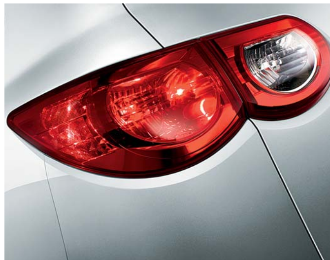
The angular taillamps help give Traverse a feeling of constant motion, even while it's standing still.