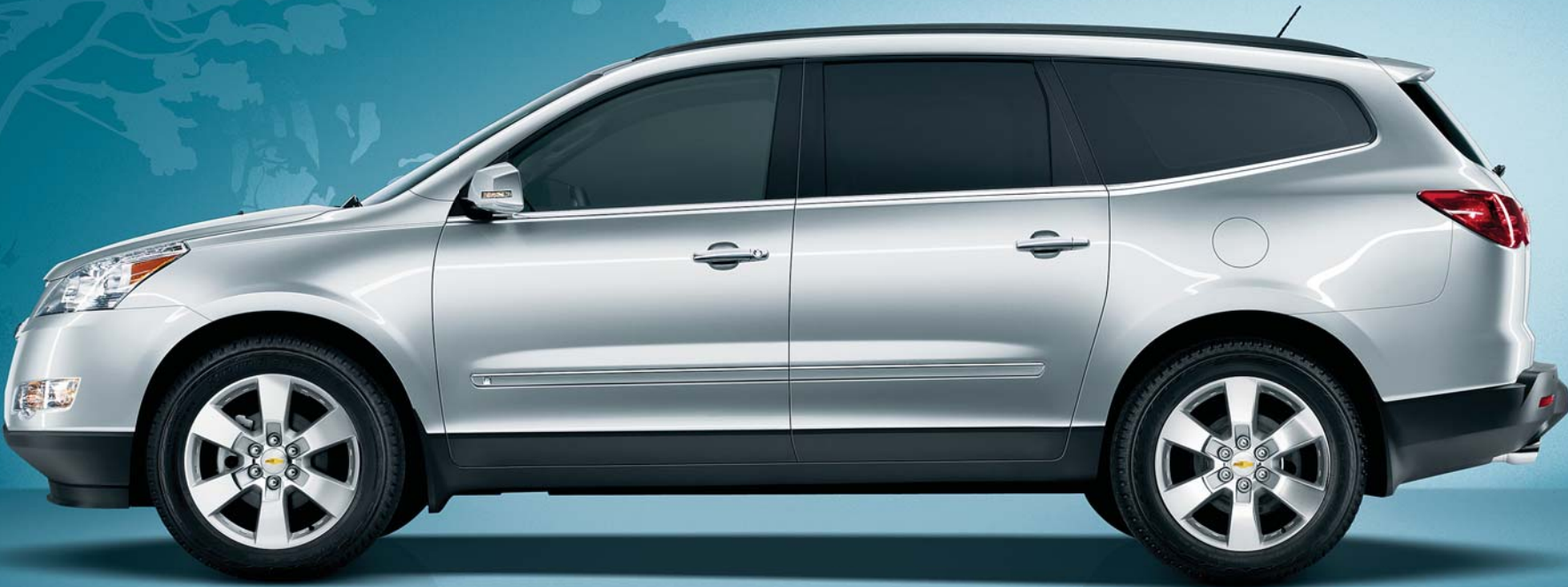
Traverse LTZ in Silver Ice Metallic.

NOTE: Unless otherwise noted, all claims based on 2008 GM Mid-Utility Crossover segment and latest available competitive information. Excludes other GM vehicles.