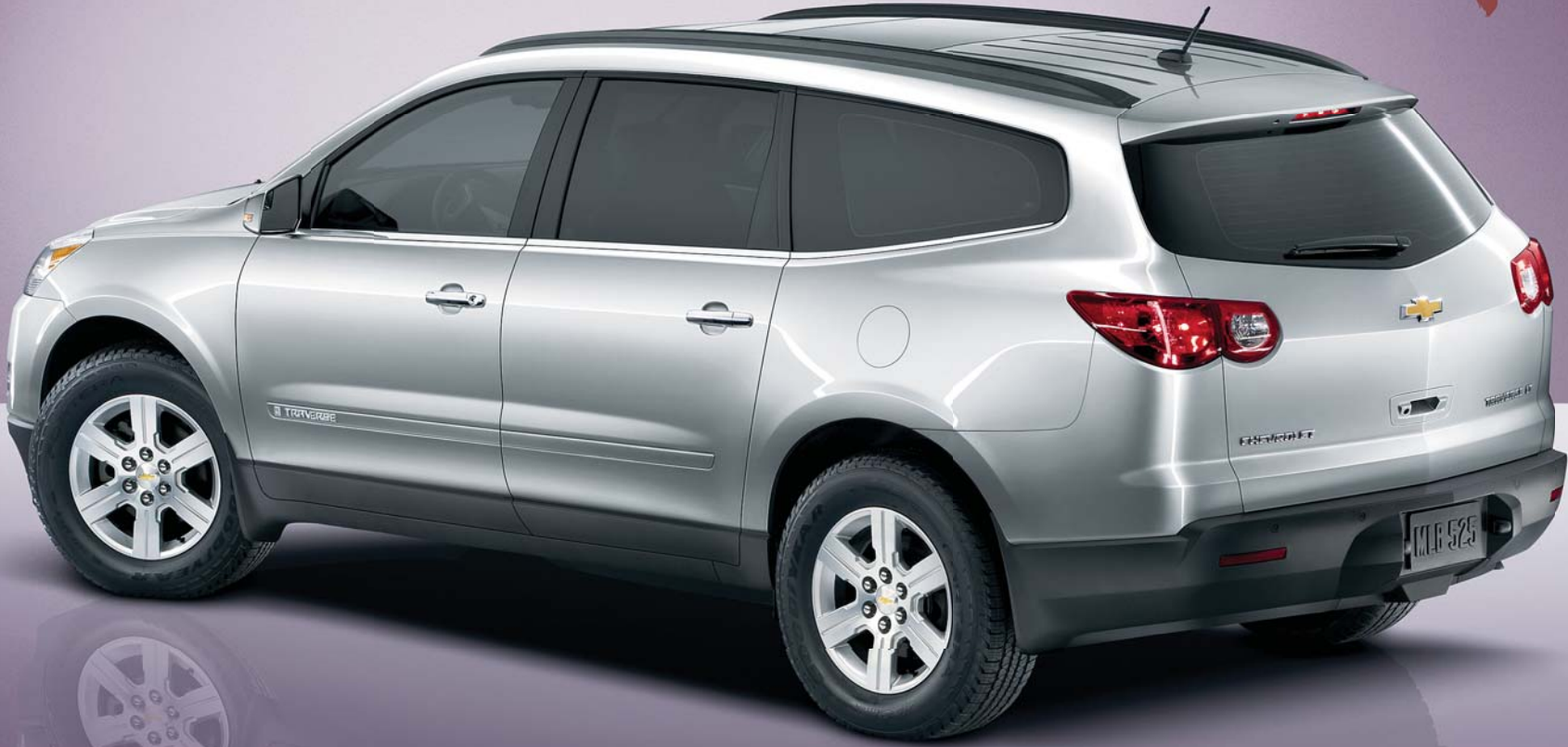
Traverse LT in Silver Ice Metallic with available features.

there's even more to learn at chevy.com/traverse