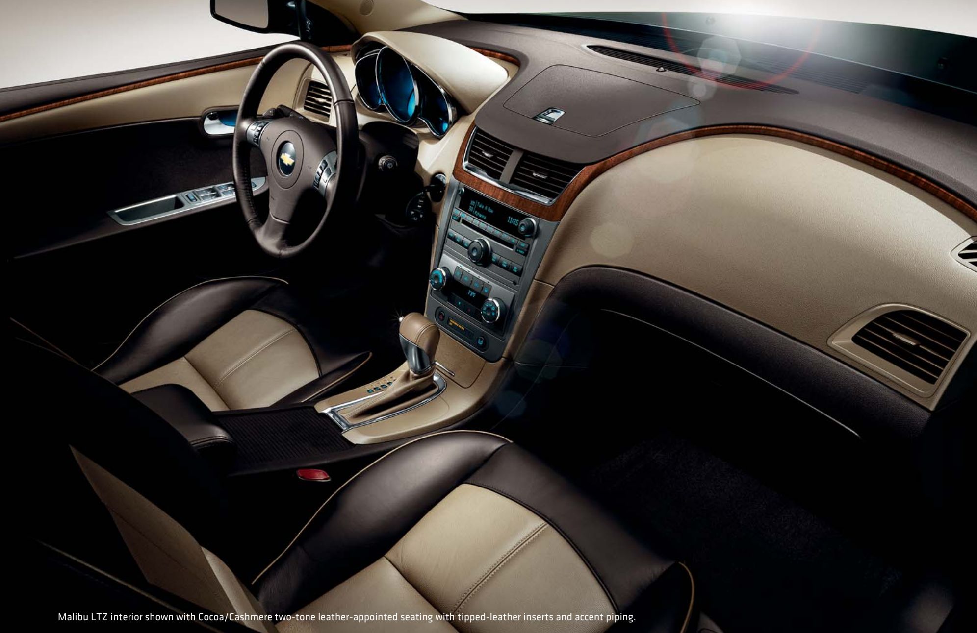
Malibu LTZ interior shown with Cocoa/Cashmere two-tone leather-appointed seating with tipped-leather inserts and accent piping.