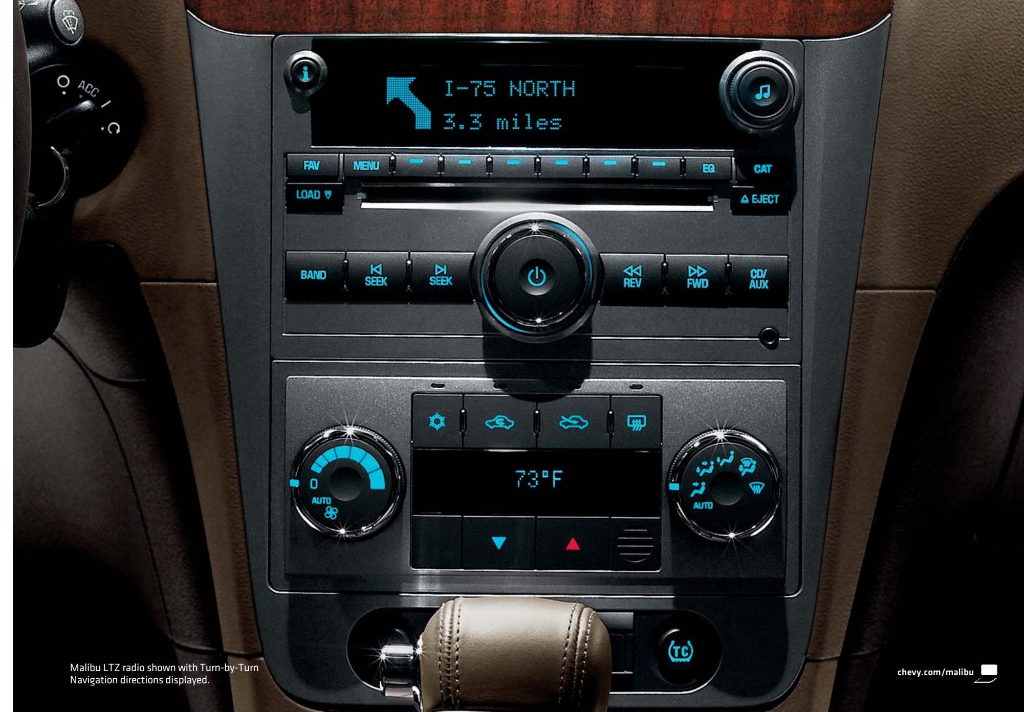
Malibu LTZ radio shown with Turn-by-Turn Navigation directions displayed.

1 Not available in certain areas. Visit onstar.com for coverage maps. 2 Call 1-888-4ONSTAR (1-888-466-7827) or visit onstar.com for details and system limitations. OnStar acts as a link to existing emergency service providers. 3 A NOTE ON CHILD SAFETY: Always use safety belts and the correct child restraint for your child's age and size. Even in vehicles equipped with the Passenger Sensing System, children are safer when properly secured in a rear seat in the appropriate infant, child or booster seat. Never place a rear-facing infant restraint in the front seat of any vehicle equipped with an active air bag. See the Owner's Manual and child safety seat instructions for more safety information. 4 Side-impact crash test rating is for a model tested with standard head-curtain side-impact air bags (SABs). Government star ratings are part of the National Highway Traffic Safety Administration's (NHTSA's) New Car Assessment Program ( www.safercar.gov ).