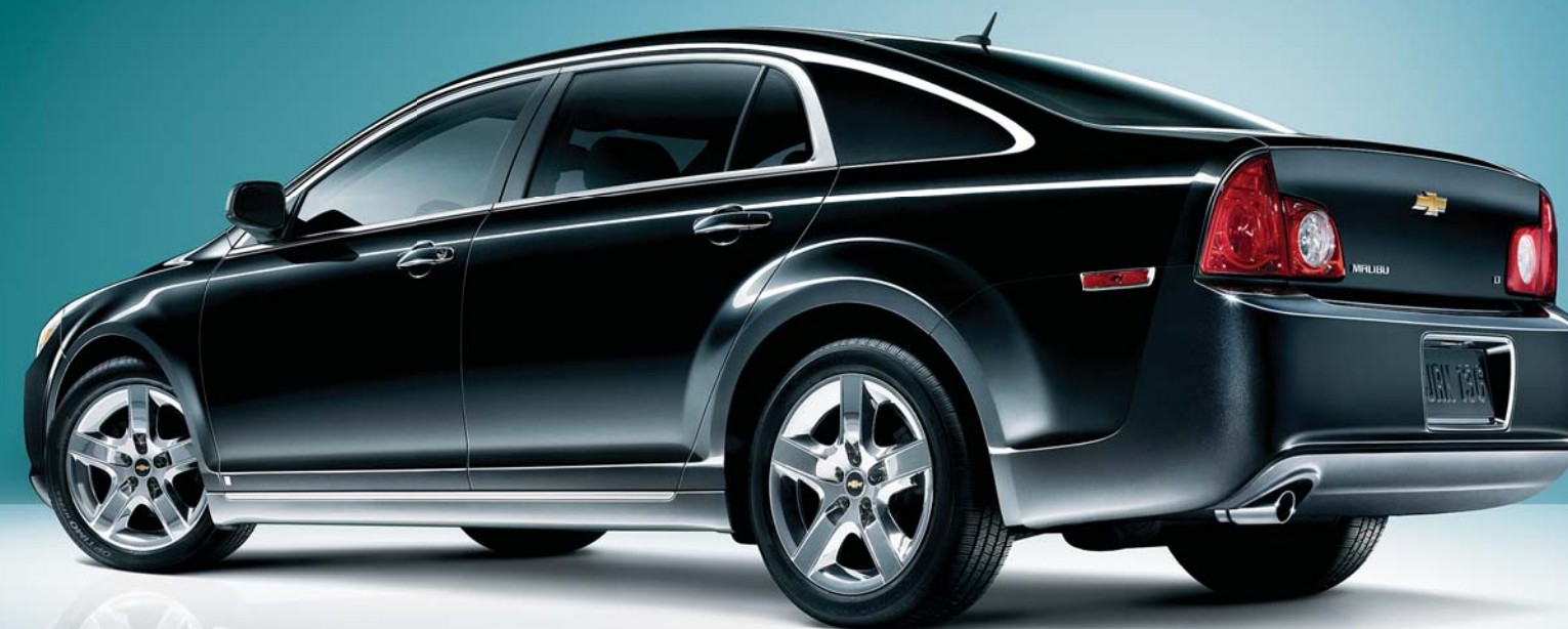
Malibu 1LT shown in Black Granite Metallic (extra-cost color).

An auxiliary glove box, located in the upper instrument panel, is the perfect place to store small items such as a cell phone, CDs and sunglasses.