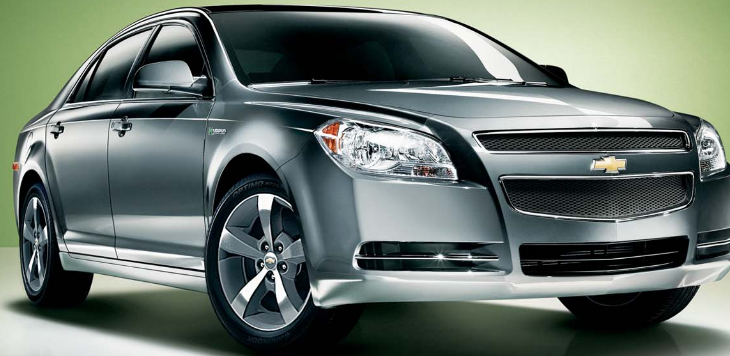
Malibu Hybrid in Dark Gray Metallic.

While you're stopped in traffic, the AUTO STOP message in the Driver Information Center informs you that the engine has shut down and that the vehicle is running on full electric power, helping you save fuel. When you lift your foot off the brake and step on the accelerator pedal, the engine is instantaneously turned back on. The electric motor and drive belt allow for smooth, seamless starts.