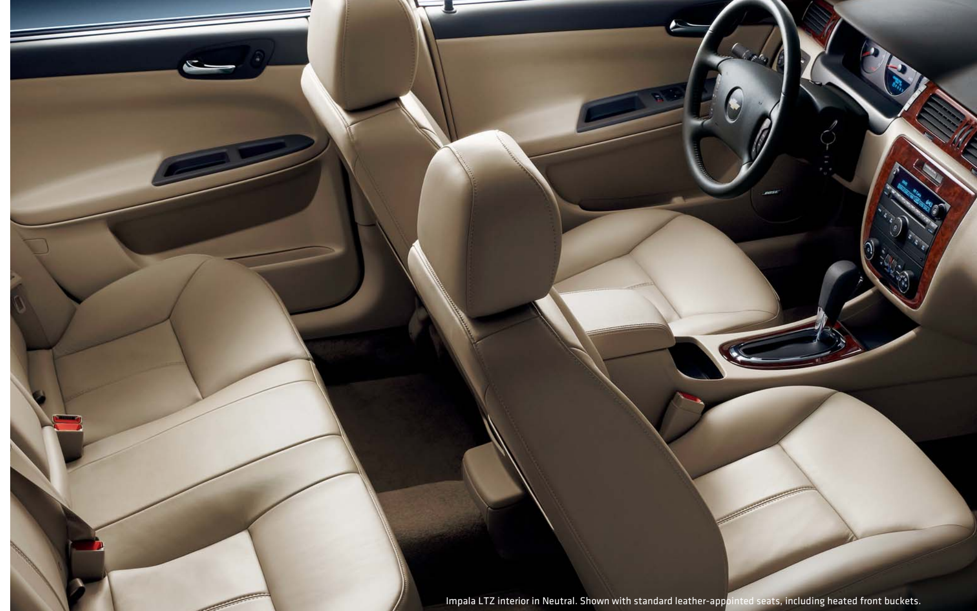
Impala LTZ interior in Neutral. Shown with standard leather-appointed seats, including heated front buckets.