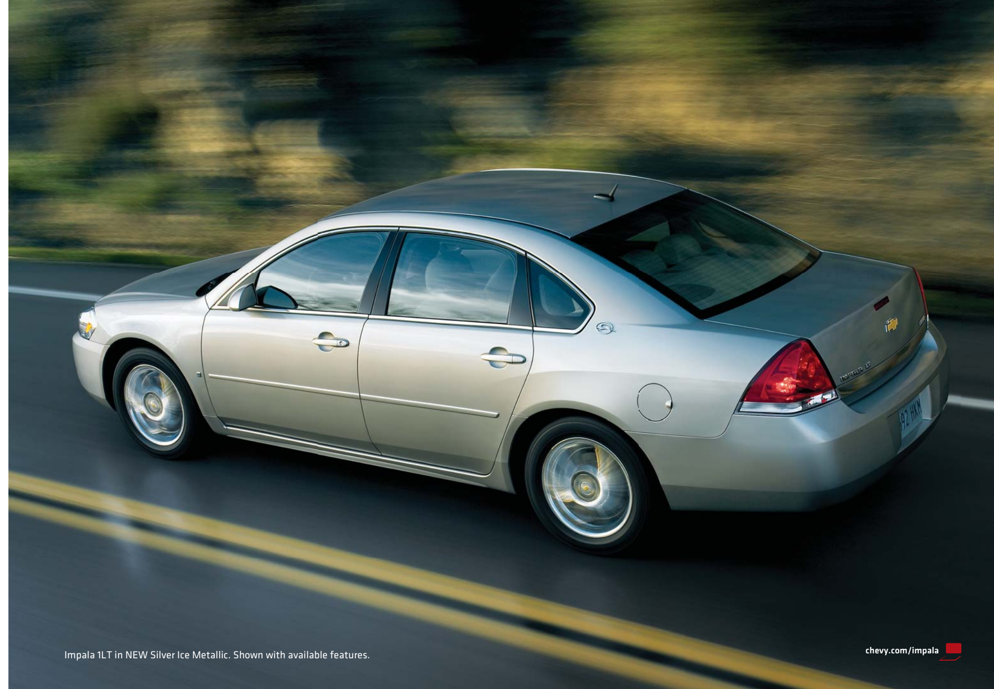
Impala 1LT in NEW Silver Ice Metallic. Shown with available features.

XM Radio 3 is standard in every Impala with three trial months. XM turns your world on with commercial-free music channels for virtually every music genre, all in amazing digital sound. Turn on your favorite sports including every Major League Baseball® game, plus the biggest names in news, talk, comedy and family programming, wherever you go, from coast to coast. Find what turns you on.