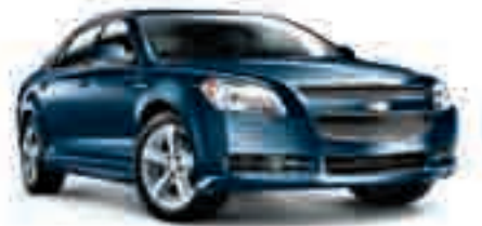
37 – Imperial Blue Metallic