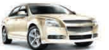
51 – Gold Mist Metallic