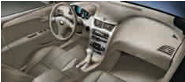
TITANIUM Custom cloth seating areas, shown in Titanium with Dark Titanium, Light Titanium and brushed aluminum interior trim accents.