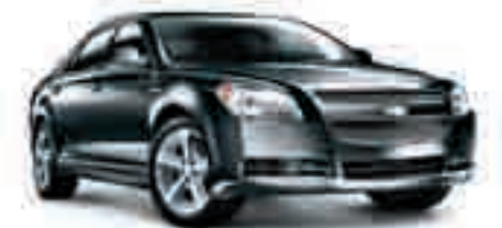
58 – Black Granite Metallic*