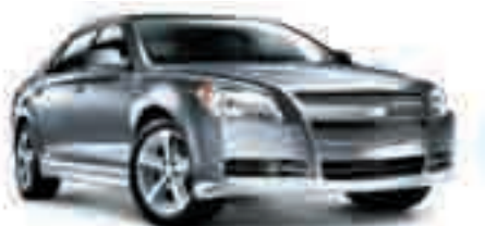
75 – Dark Gray Metallic