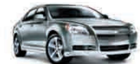
78 – Golden Pewter Metallic