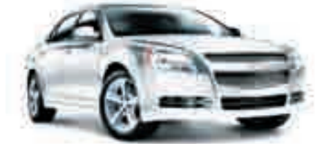
50 – Summit White