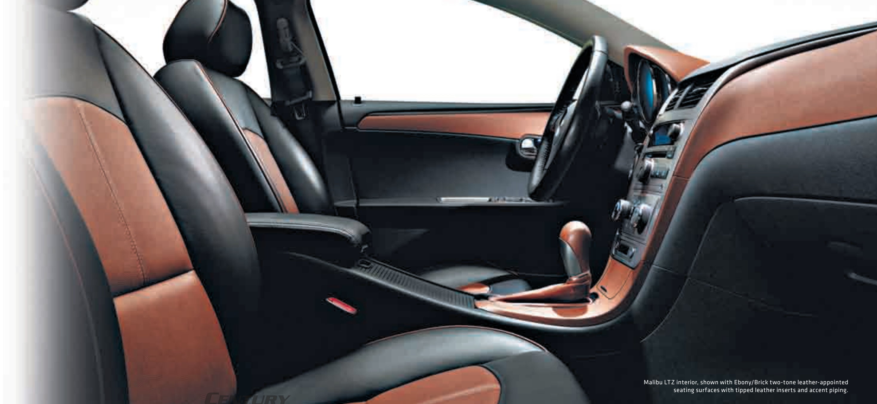
Malibu LTZ interior, shown with Ebony/Brick two-tone leather-appointed seating surfaces with tipped leather inserts and accent piping.