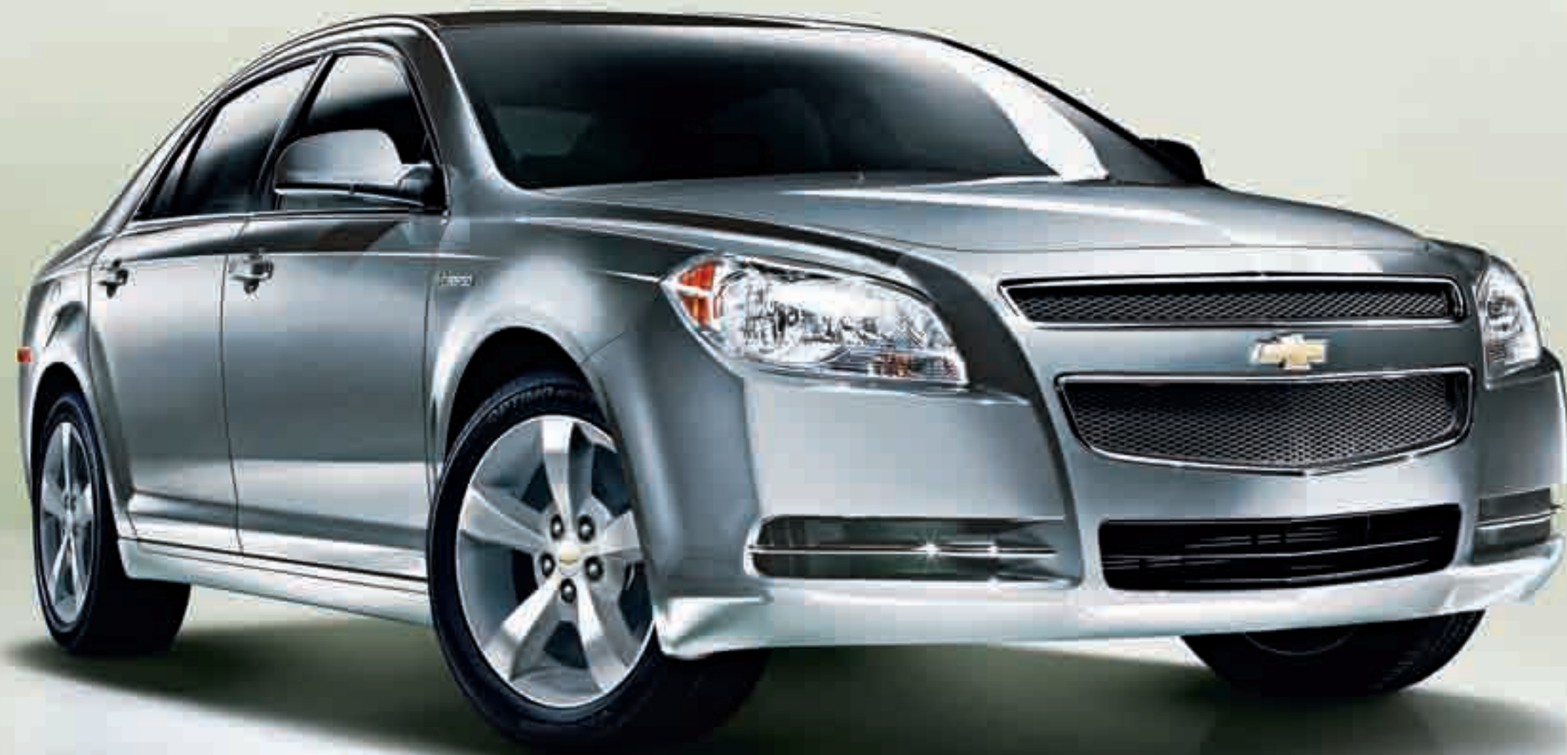
Malibu Hybrid, shown in Silver Ice Metallic.

†† Whichever comes first. Conditions and limitations apply. See dealer for details.