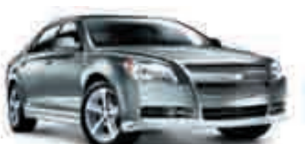
92 – Silver Moss Metallic