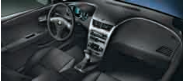
EBONY Custom cloth seating areas, shown in Ebony with Ebony and brushed aluminum interior trim accents.