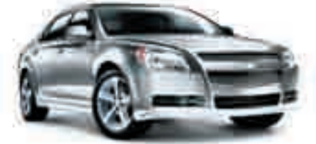
17 – Silver Ice Metallic