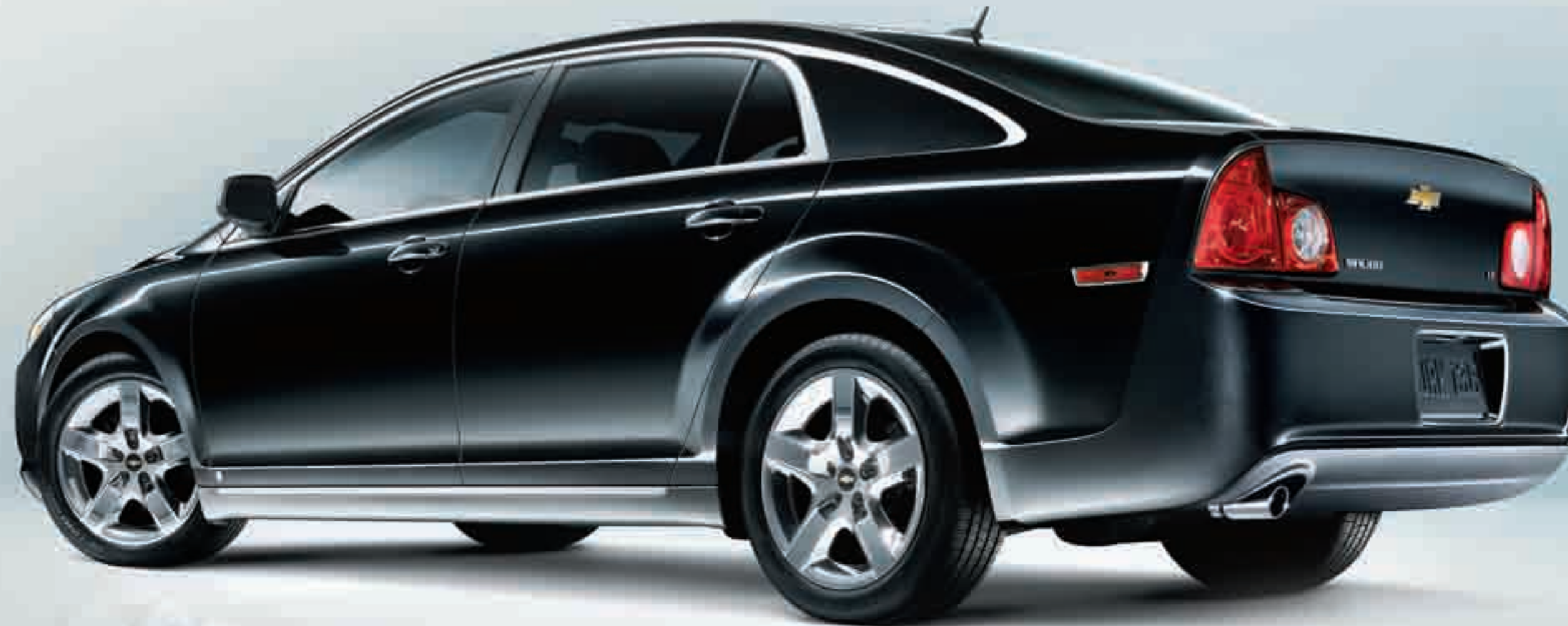
Malibu 1LT, shown in Black Granite Metallic (extra cost option).