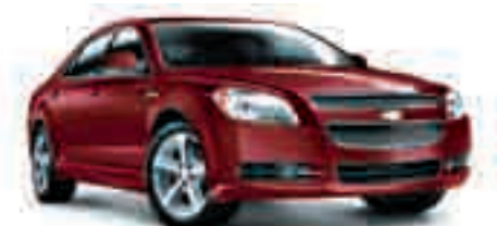
80 – Red Jewel Tintcoat* 4