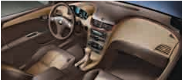
COCOA/CASHMERE Two-tone leather-appointed seating surfaces with accent piping, shown in Cocoa/Cashmere with Cocoa, Cashmere and simulated woodgrain interior trim accents.