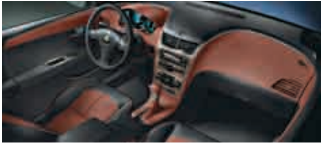
EBONY/BRICK Two-tone leather-appointed seating surfaces with accent piping, shown in Ebony/Brick with Ebony, Brick and satin nickel interior trim accents and accent piping.