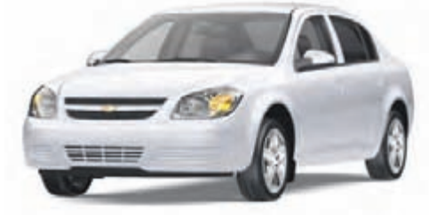
50 Summit White