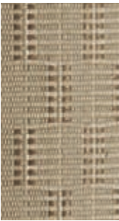
52C – Neutral†

Available on LT and Sport Models. Shown in Gray