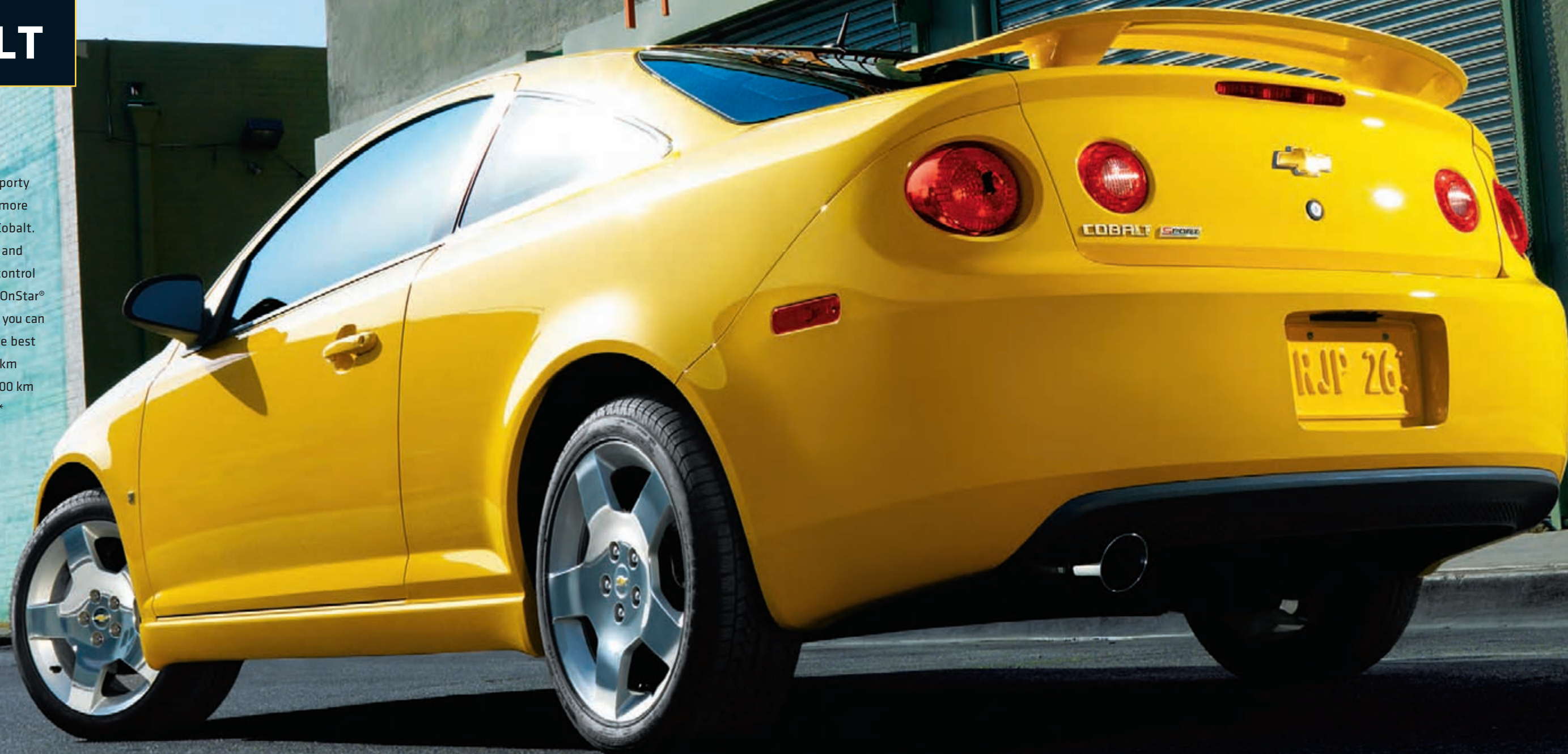
Cobalt Sport Coupe, shown in Rally Yellow.

*Whichever comes first. Conditions and limitations apply, see dealer for details.