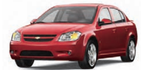
29 Sport Red Tintcoat*