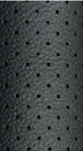
192 – Ebony†