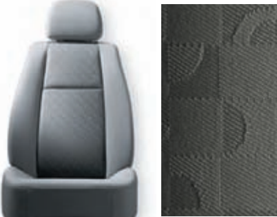
14B – Gray

Standard on LT and Sport Models. Shown in Ebony