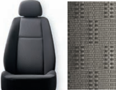
14C – Gray*

Standard on LT and Sport Models. Shown in Ebony