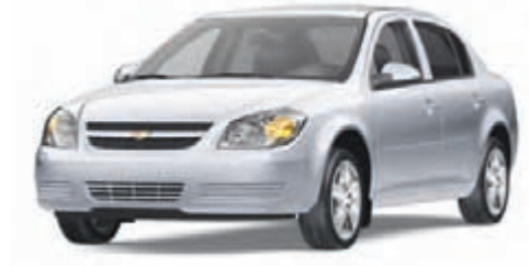
95 Ultra Silver Metallic