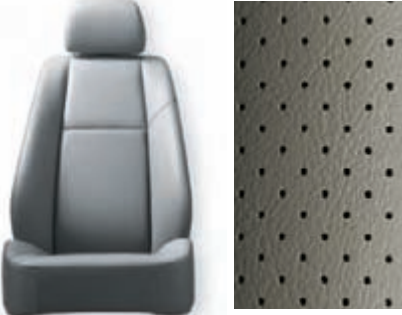
142 – Gray††

Available on LT and Sport Models. Shown in Gray