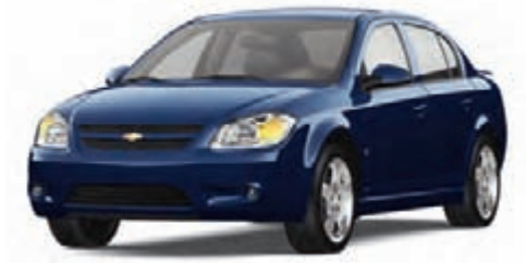
37 Imperial Blue Metallic