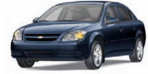
87 Slate Metallic