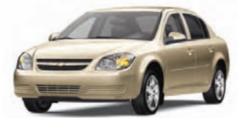
15 Sandstone Metallic³

*Available on LT Coupe and Sport Coupe only.