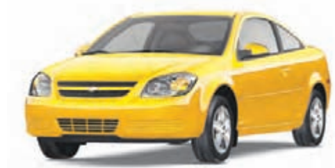
34 Rally Yellow⁴