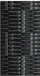
19C – Ebony**