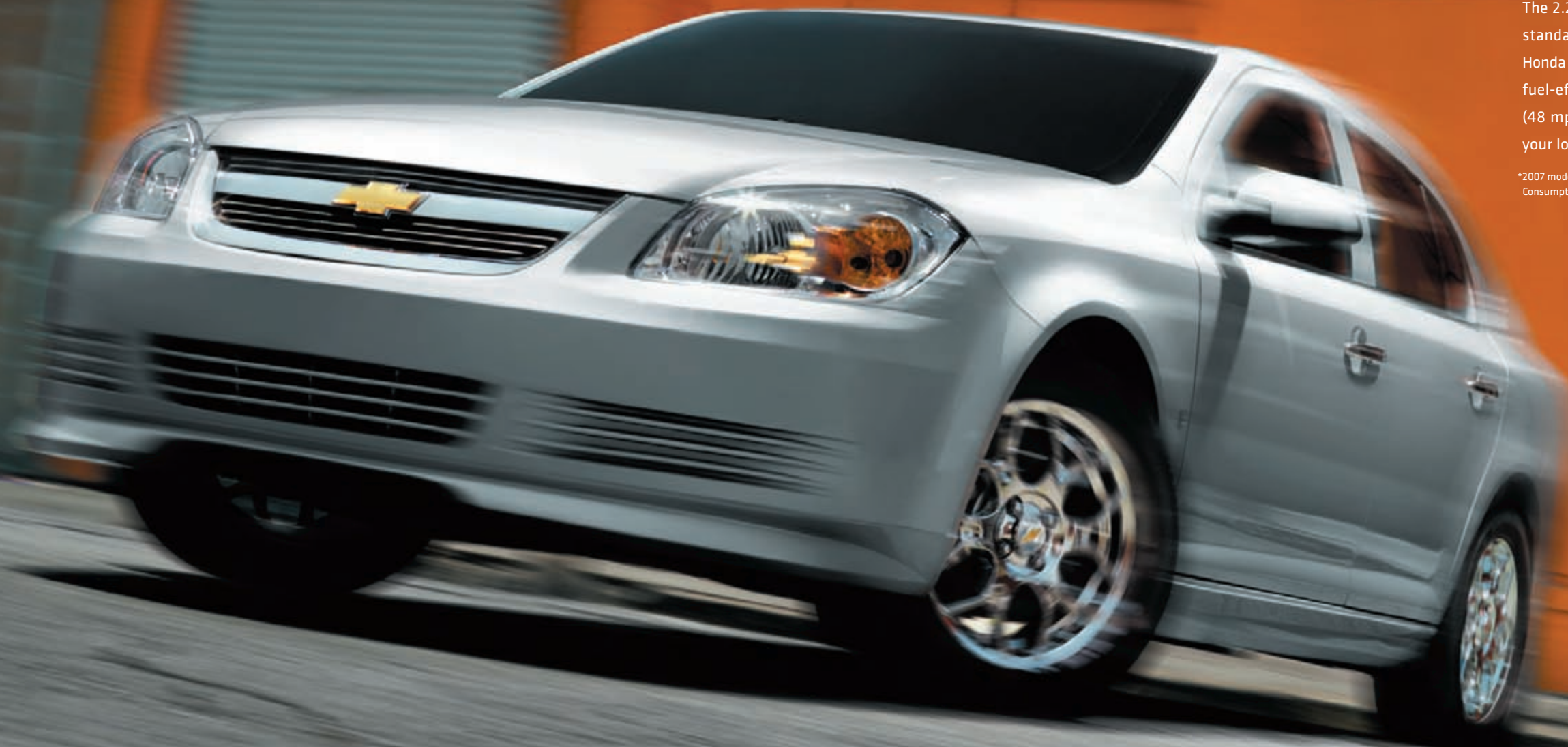
Cobalt LS Sedan, shown in Ultra Silver Metallic with available GM Accessories.