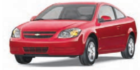
74 Victory Red