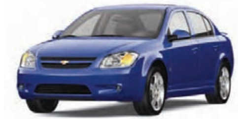
39 Blue Flash Metallic*