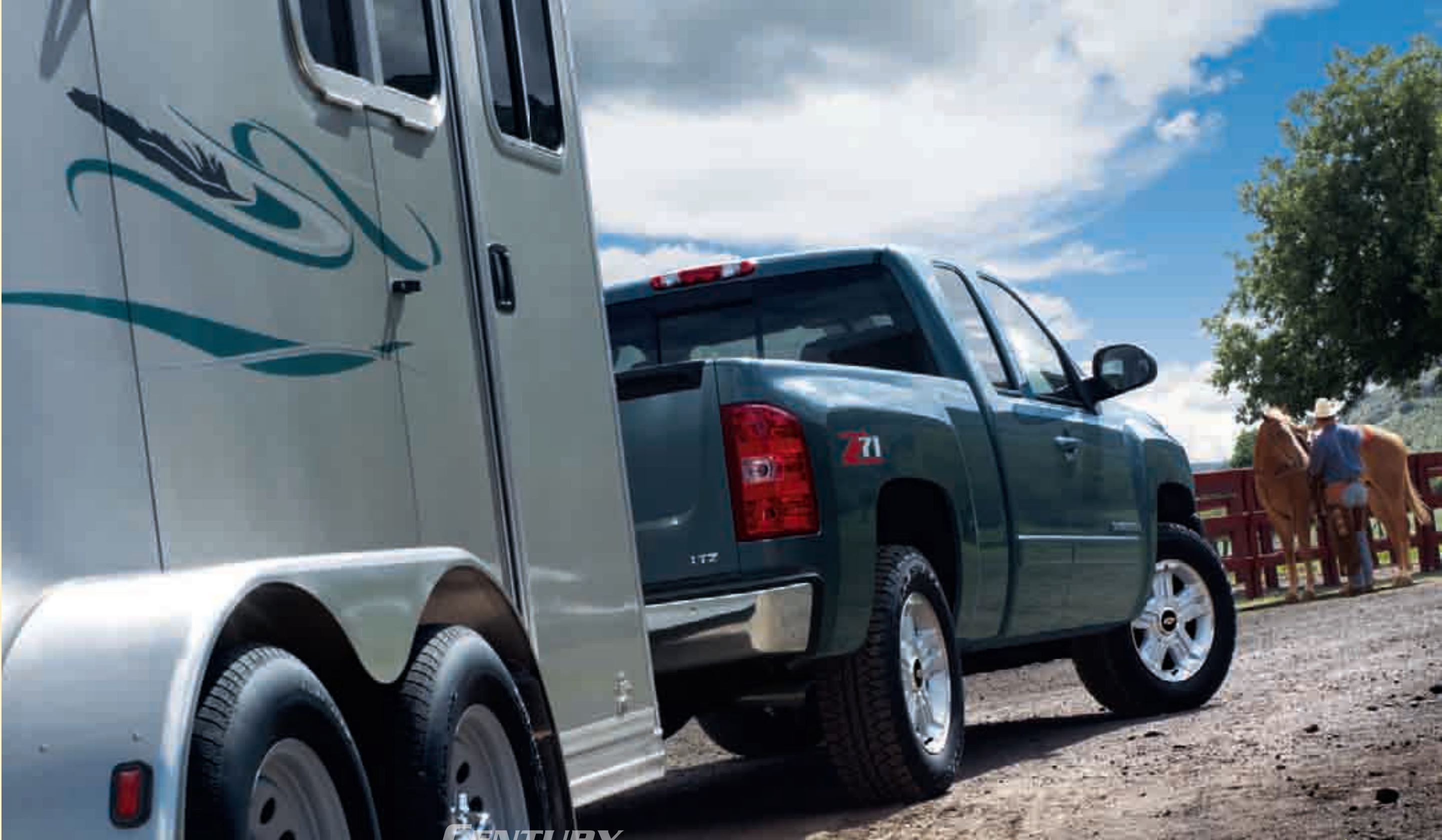
Silverado Extended Cab LTZ standard box 4x4, shown in Blue Granite Metallic with available equipment.

*See page 29 for complete VortecMAX Performance Package details.