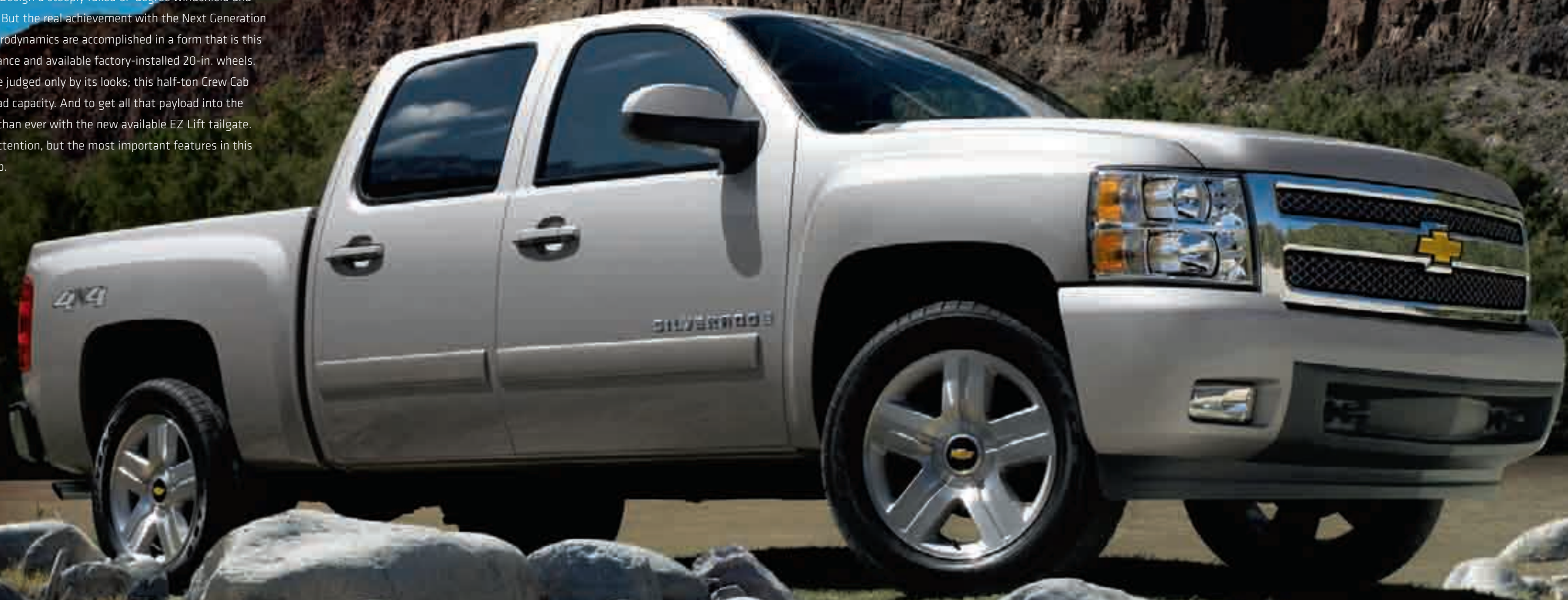
Silverado Crew Cab LTZ short box 4x4, shown in Silver Birch Metallic, with available equipment.

How can a truck with such a muscular presence be this aerodynamic? Start by spending endless days in wind tunnel testing. Design a steeply raked 57-degree windshield and many other wind-cheating contours. But the real achievement with the Next Generation Silverado is that the class-leading aerodynamics are accomplished in a form that is this bold, with a wider, more powerful stance and available factory-installed 20-in. wheels. Not that the new Silverado should be judged only by its looks; this half-ton Crew Cab offers best-in-class maximum payload capacity. And to get all that payload into the cargo box, Silverado makes it easier than ever with the new available EZ Lift tailgate. Sure the new design will grab your attention, but the most important features in this pickup are much more than skin deep.