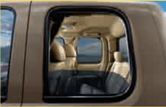
Silverado Extended Cab LT standard box, shown in Desert Brown Metallic with available equipment.