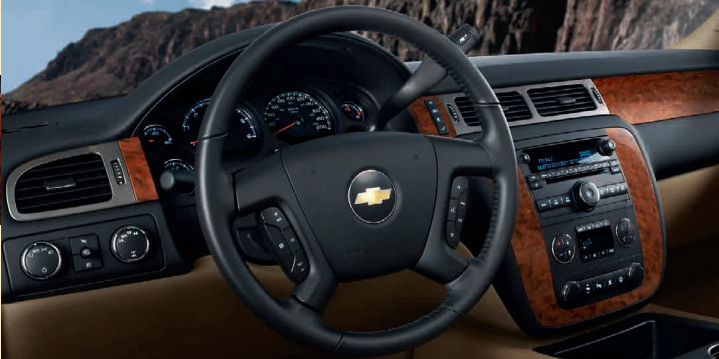
Silverado LTZ instrument panel, shown with available equipment.

Enhance your sense of direction. Introducing the new touch-screen DVD navigation system.* It's available on Extended and Crew Cab LT and LTZ models and it features a large full-colour touch-screen monitor and voice recognition that responds to as many as 26 different commands. The system enables you to choose between different routes and provides step-by-step directions to your selected destination. It also alerts you if you stray from your course. It even develops a new, preferred route if you make a wrong turn.