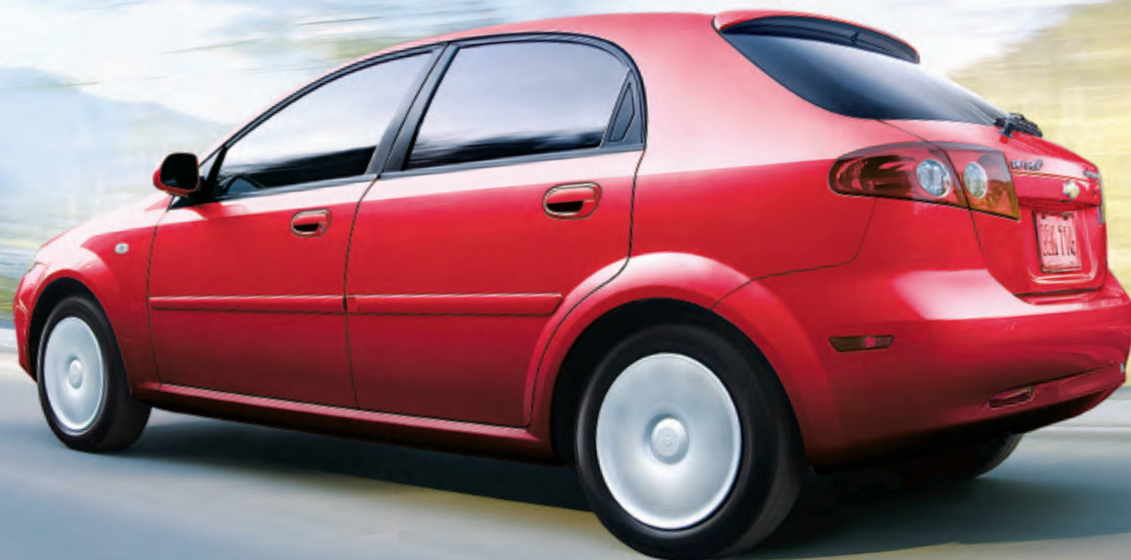
Optra LS 5-Door, shown in Super Red.

The available RS Special Edition Package features 15-in. aluminum wheels, a rear spoiler, premium 8-speaker sound system, a leather-wrapped shift knob and steering wheel with sound system controls, plus an Apple iPod Nano (visit optra.gmcanada.com for details).