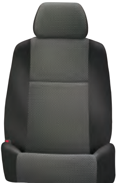
82B – Gray Optra 5-Door 82C – Gray Optra Wagon

Colours may not be exactly as illustrated due to restrictions of the printing process. Please see your Sales Consultant for specific colour and model availability. Optra 5-Door shown with splash guards a dealer-installed accessory.