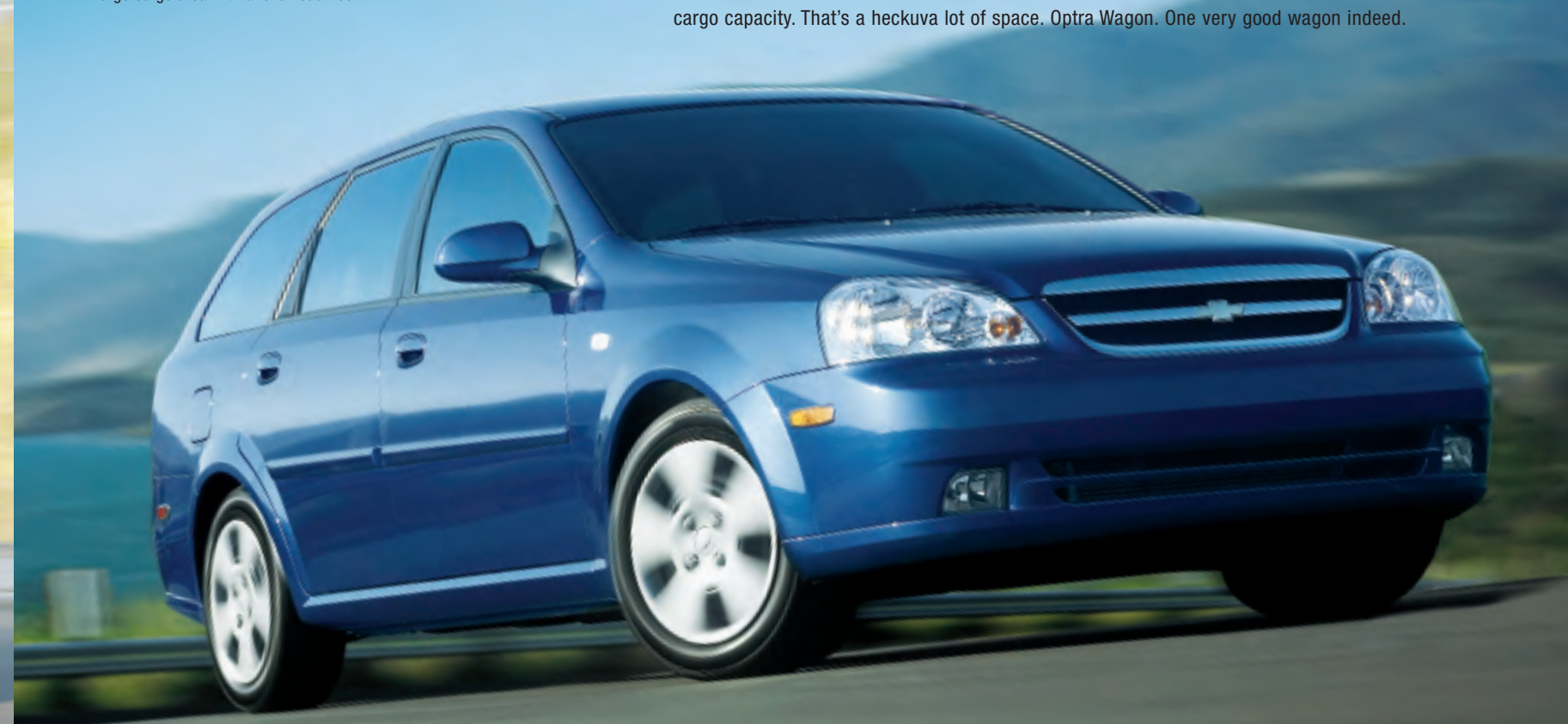
Optra LS Wagon, shown in Imperial Blue.

For easy loading, the rear tailgate opens up a large cargo area with a level load floor.