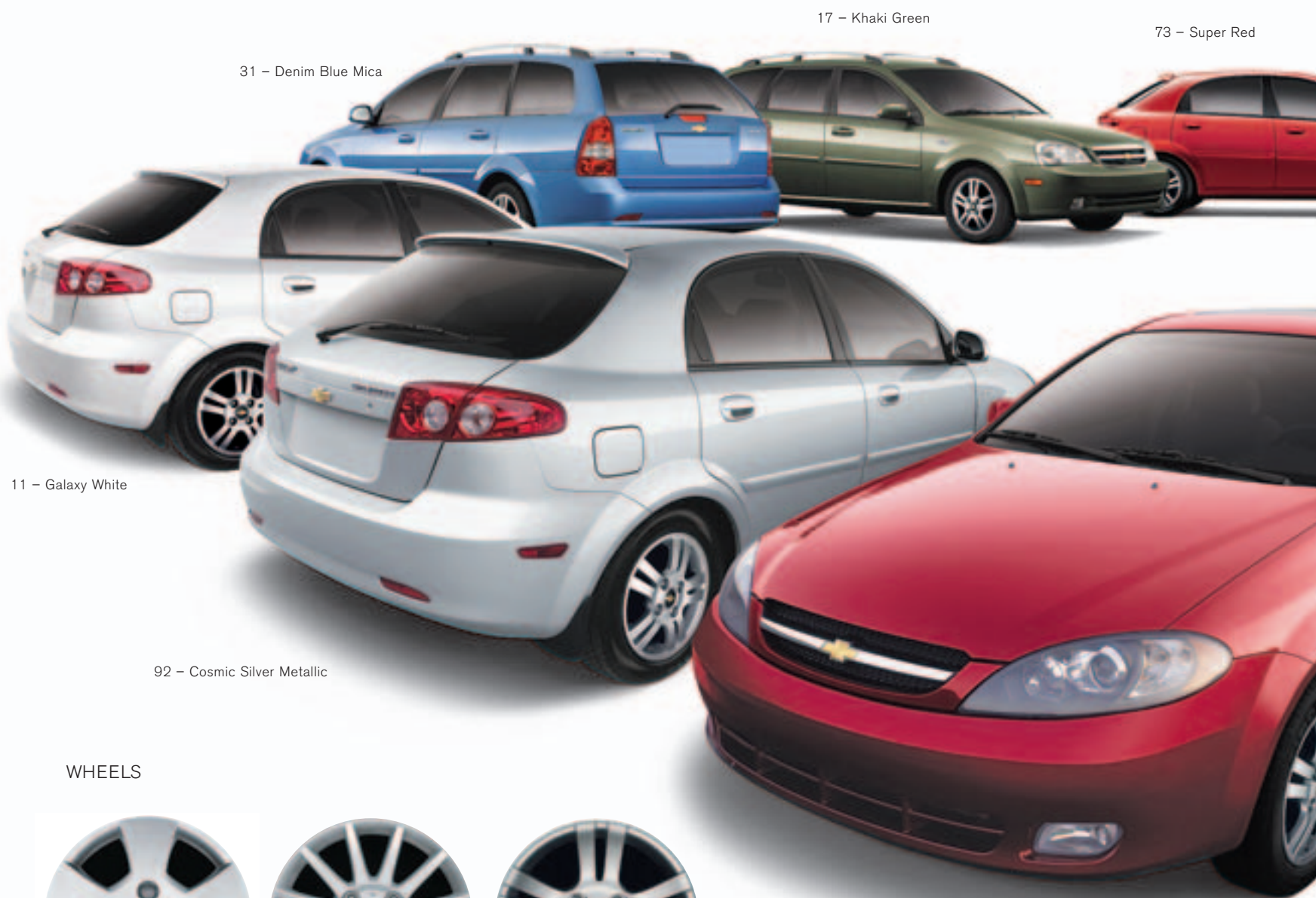
11 – Galaxy White