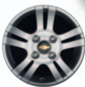
C – 15" 10-spoke aluminum wheel