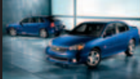
MALIBU & MALIBU MAXX