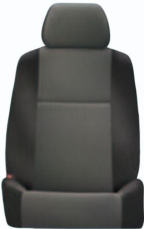
82B – Gray Optra 5 82C – Gray Optra Wagon