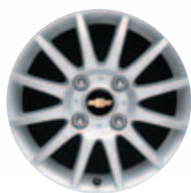
B – 15" multi-spoke aluminum wheel