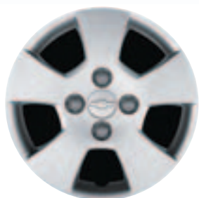
A – 15" bolt-on wheel cover