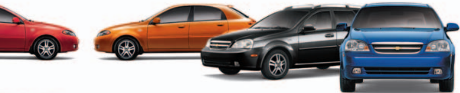
15 – Imperial Blue Mica