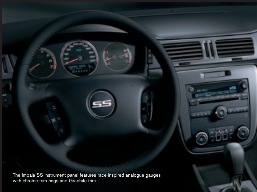
The Impala SS instrument panel features race-inspired analogue gauges with chrome trim rings and Graphite trim.