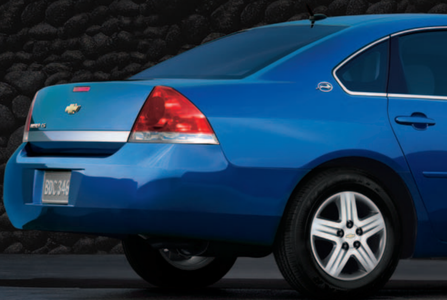
Impala LS, shown in Laser Blue Metallic.

*A NOTE ON CHILD SAFETY: Always use safety belts and proper child restraints, even in vehicles equipped with air bags. Even with the Passenger Sensing System, children are safer when properly secured in a rear seat. Never place a rear-facing infant restraint in the front seat of any vehicle equipped with an active frontal air bag. Refer to the vehicle Owner's Manual and child safety seat instructions for more information.