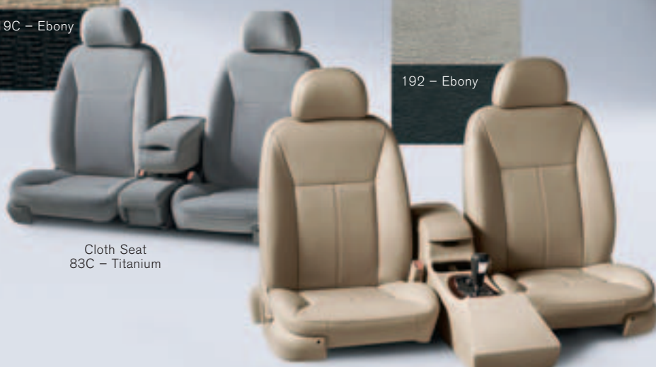
Cloth Seat 83C – Titanium