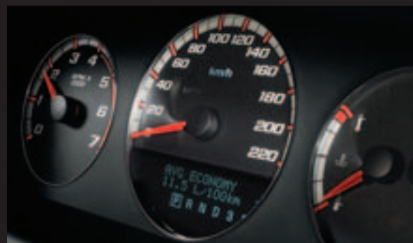
The deluxe Driver Information System includes compass and exterior temperature readouts, standard on LT, LTZ and SS, available on LS. A Driver Information System with personalization features is standard on LS.