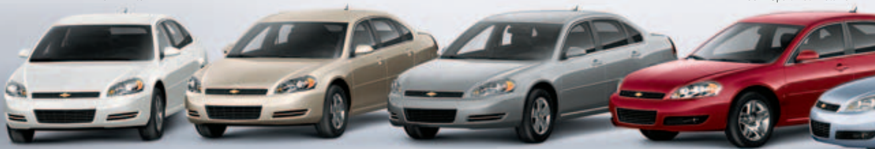
63 – Sport Red Metallic