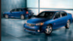
MALIBU & MALIBU MAXX