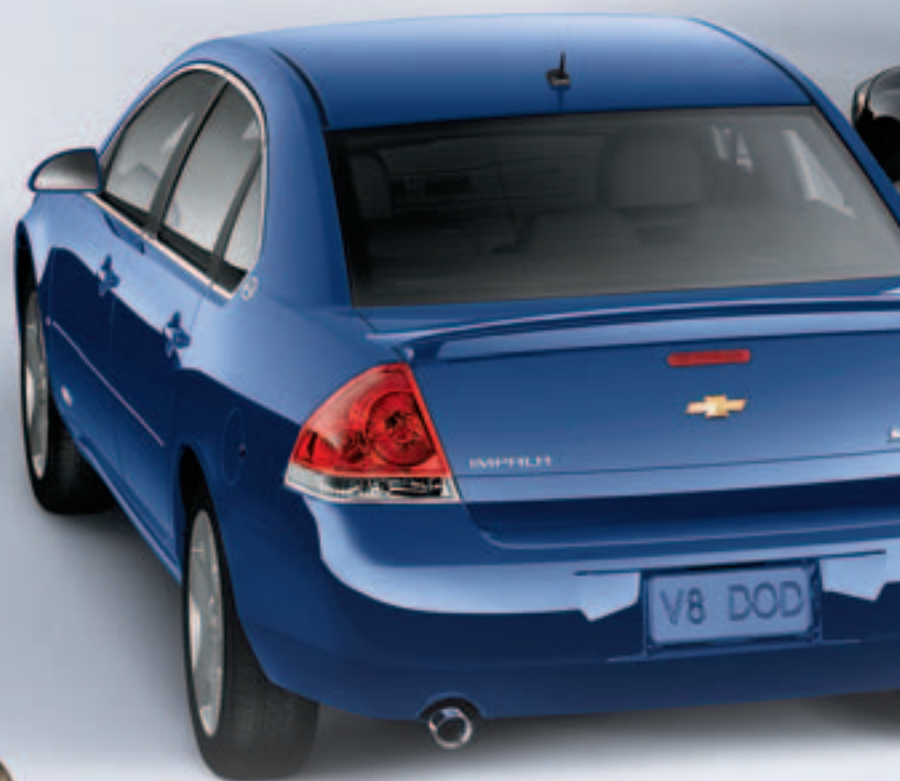
21 – Laser Blue Metallic*

Colours may not be exactly as illustrated due to restrictions of the printing process. Please see your Sales Consultant for specific colour and model availability.