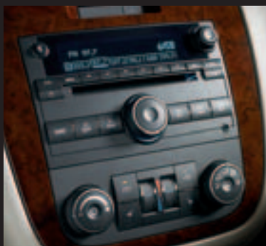
The 8-speaker Bose Premium sound system is standard on SS and available on LT and LTZ. Dual-zone climate controls are standard on LT, LTZ and SS.