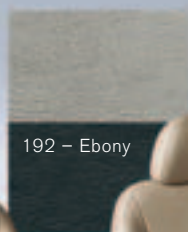
192 – Ebony