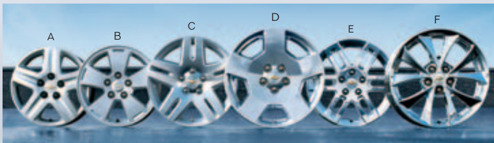
B – 16" 5-spoke painted aluminum