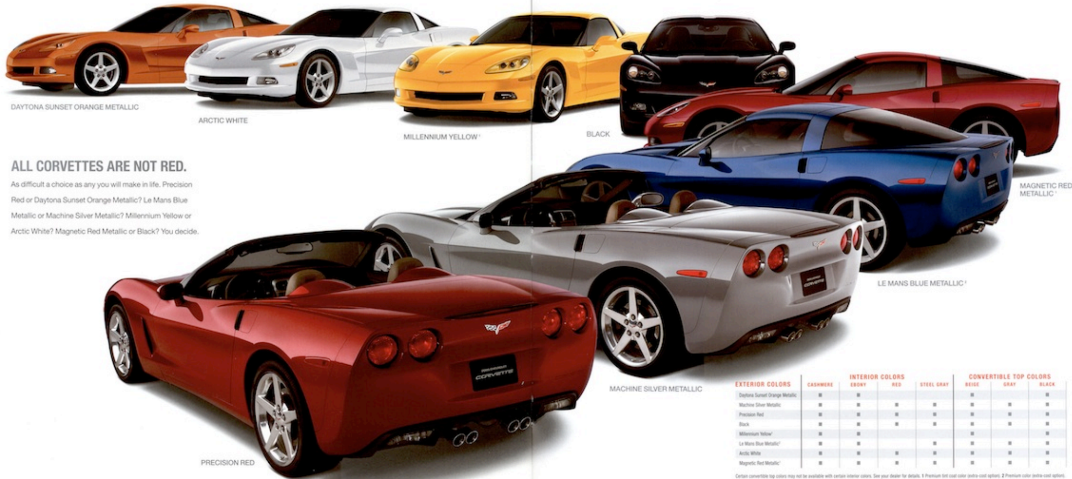
DAYTONA SUNSET ORANGE METALLIC