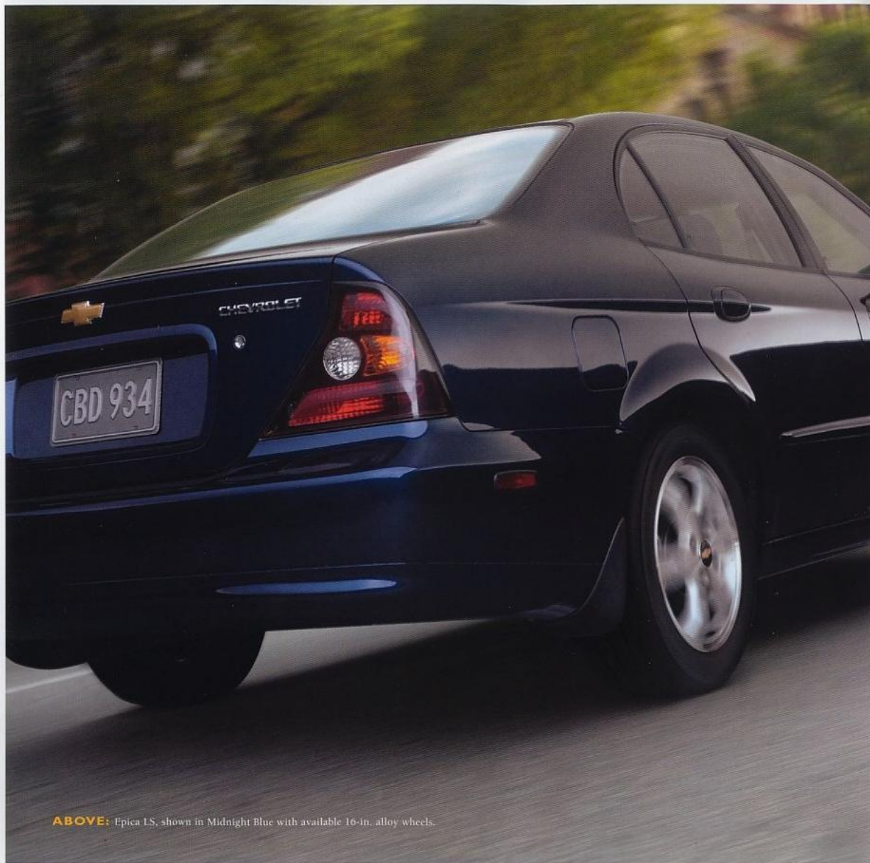
ABOVE: Epica LS, shown in Midnight Blue with available 16-in. alloy wheels.