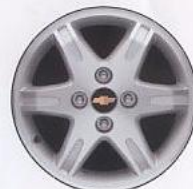
B - 16" Alloy