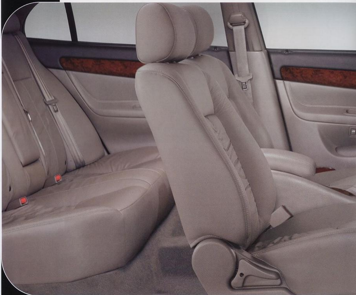
ABOVE: Epica LT interior, shown with Medium Dark Gray leather seating surfaces. A split-folding rear seatback is standard. It lets you divide the space between payload and passengers.