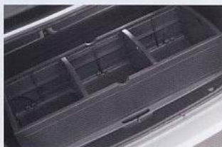
MULTI-PURPOSE TRUNK ORGANIZER