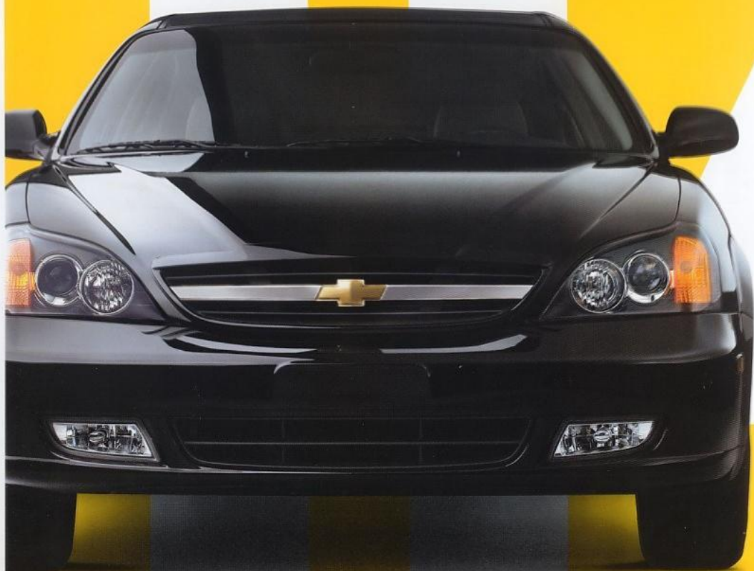
ABOVE: Projector beam headlights set the pace in style and performance, Epica LT, shown in Granada Black.