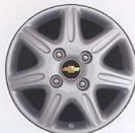
A - 15" Alloy