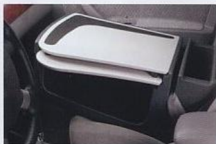
MOBILE OFFICE ORGANIZER