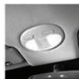
Interior lamp with focus spot.