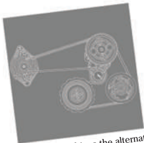
Single v-belt drives the alternator and compressor to reduce the engine noise