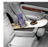
Foldable headrest in 2nd bench up to 60/40.