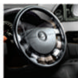
Power assisted steering.