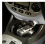
Power socket for mobile phone, video camera etc.