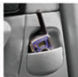
Mobile phone pocket on the rear doors.