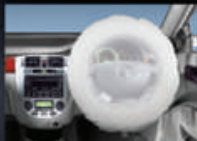
Front single airbag