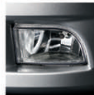
Anti-Fog lamps enhance visibility. (L.S.Model)