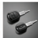
Remote control locking for doors and tailgate with anti-theft alerts.