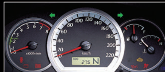
Sporty instrument dial