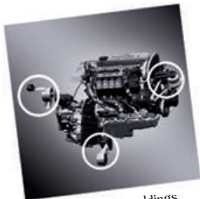
Hydraulic engine moldings reduce engine vibrations