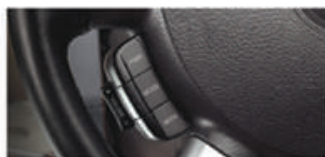
Audio control on the steering column. (Optional)