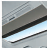
Slide and Tilt Sunroof (Optional)