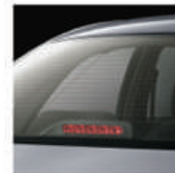
Hidden antenna in the rear windshield frame and an extra brake lamp increase your safety.