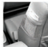
Seat Side Pocket.