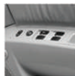
Control panel for power windows and door locks.