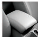
Rear arm rests for front seats.