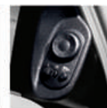
Convenient interior controls for side mirrors.