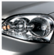
Multi-reflector headlights enhance visibility and safety.