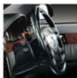
Tilt column for steering wheel.

An elegant and stylish interior, made just for your comfort. The Chevrolet Optra interior was developed on the "Horizontal Theme" which is usually only found in top-of-the range models. The two-tone information display looks even classier against wood grain. The aluminum-effect middle console features a chrome trimmed control panel. The Chevrolet Optra's spaciousness makes you feel comfortable and relaxed. You can stretch out in 1,460 mm width x 1,925 mm length x 1,180 mm height.