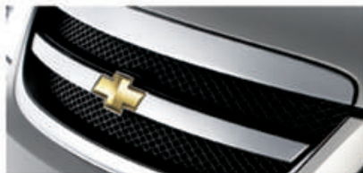
The elegant newly designed chrome grille with the 'Bow Tie', a unique symbol of Chevrolet.