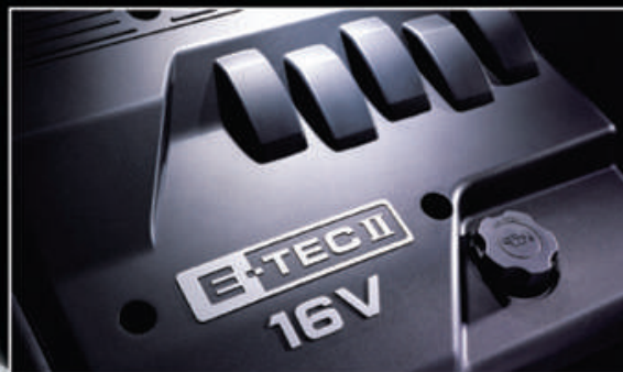
Four cylinder, 16 valve DOHC engine

The revolutionary Total Noise Restraint System (TNRS) utilizes an insulated engine cover and a hydraulic engine mount to help absorb shock and reduce engine noise when starting, accelerating or braking. The Chevrolet Optra is equipped with a "Maintenance Free Battery" which is self charging and does not require battery water refills. The exhaust system is equipped with three chambers and a special noise suppression system in the tailpipe. A sound-absorbent foam is applied to all joints throughout the vehicle and helps make your journey more pleasant, relaxed and peaceful.