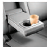
Rear Arm rests with cup holder.