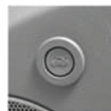
Driver accessible locking controls for tailgate.