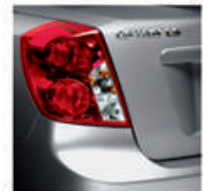
See-through elegant and stylish rear light panels.