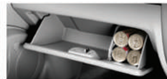
Cooling storage - the first of its kind in a sedan of its class!