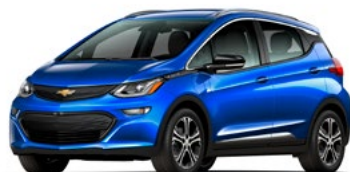
GD1 – Kinetic Blue Metallic 1 (With Black Grille)