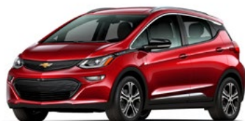
GPJ – Cajun Red Tintcoat 1 (With Black Grille)