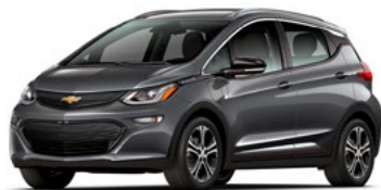
G7Q – Nightfall Grey Metallic 1 (With Black Grille)