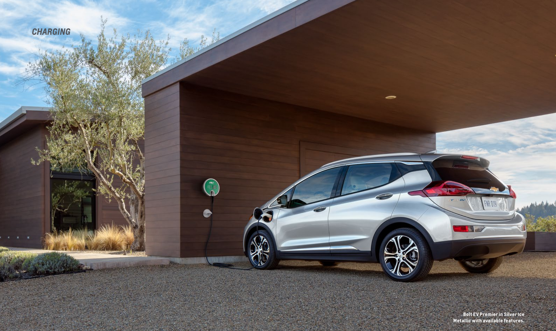
Bolt EV Premier in Silver Ice Metallic with available features.