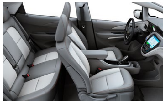
Light Ash Grey/Ceramic White Perforated Leather Appointments 5