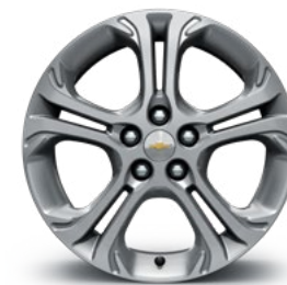
17" Painted-aluminum (Standard on LT)