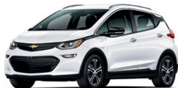
GAZ – Summit White (With Black Grille)