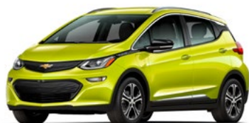
GK0 – Shock 1 (With Black Grille)