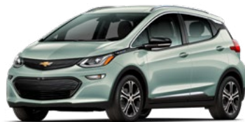
G9A – Green Mist Metallic 1,2 (With Black Grille)