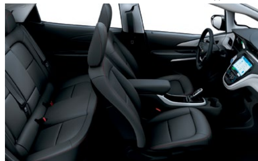
Dark Galvanized Grey Perforated Leather Appointments 5