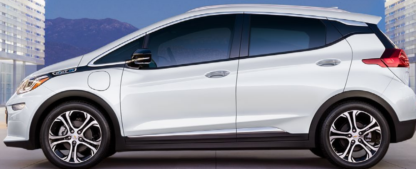
Bolt EV Premier in Summit White with available features.

1 The system wirelessly charges one PMA- or Qi-compatible mobile device. Some devices require an adaptor or back cover. To check for phone or other device compatibility, visit mychevrolet.ca for details.