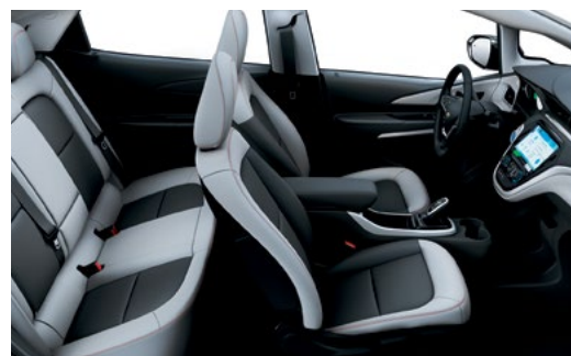
Dark Galvanized Grey/Sky Cool Grey Perforated Leather Appointments 5