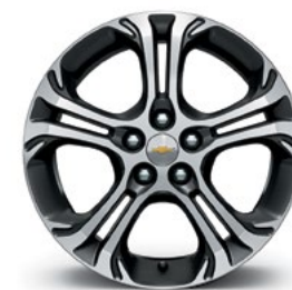
17" Ultra Bright machined-aluminum with painted pockets (Standard on Premier)

1 Available at extra cost. 2 Premier models only. 3 Requires Dark Galvanized Grey or Light Ash Grey/Ceramic White interior. 4 Standard on LT. 5 Standard on Premier.