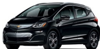
GB8 – Mosaic Black Metallic 1 (With Dark Silver Grille)