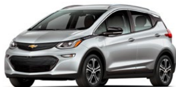
GAN – Silver Ice Metallic 2,3 (With Black Grille)