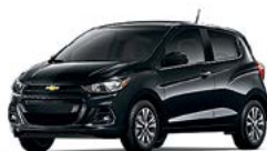
GBO – MOSAIC BLACK