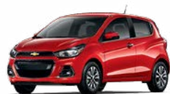
GG2 – RED HOT