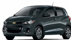
GK2 – NIGHTFALL GREY