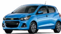
GW7 – SPLASH