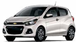
GV8 – TOASTED MARSHMALLOW