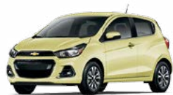
GN6 – BRIMSTONE 3