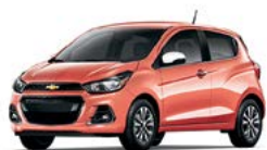
G32 – SORBET 1,2