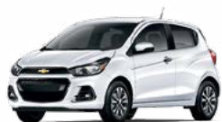
GAZ – SUMMIT WHITE