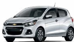
GAN – SILVER ICE