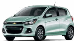
GP9 – MINT 3