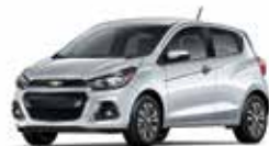
GAN – SILVER ICE