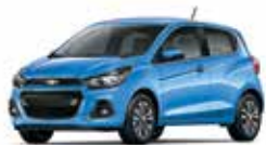
GW7 – SPLASH 1