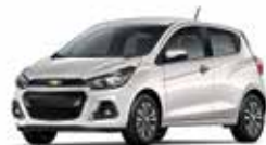
GV8 – TOASTED MARSHMALLOW 1