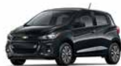
GB0 – MOSAIC BLACK 1