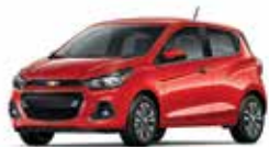
GG2 – RED HOT