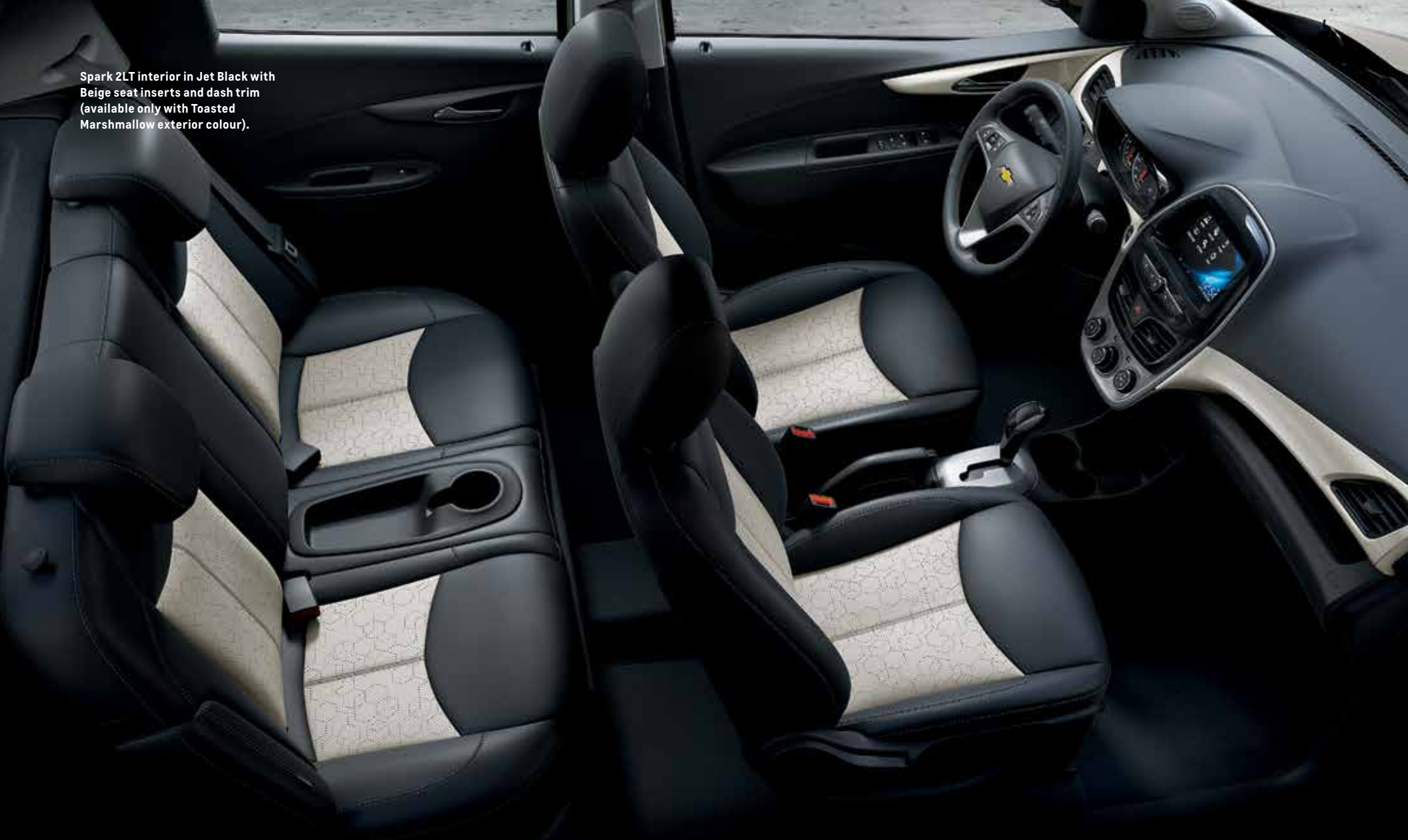
Spark 2LT interior in Jet Black with Beige seat inserts and dash trim (available only with Toasted Marshmallow exterior colour).

SURROUNDED BY STYLE. From premium materials and an unexpectedly quiet ride to the latest technology, Spark surpasses all expectations. Colour-coordinated seats are designed for comfort, with heated front seats standard on the 2LT model. The centre stack provides easy access to information and blue ambient lighting guides you to port connections.