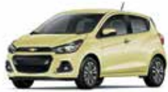
GN6 – BRIMSTONE 1