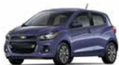
GV2 – KALAMATA 1