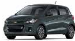
GK2 – NIGHTFALL GREY 1