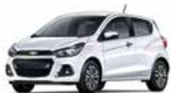
GAZ – SUMMIT WHITE