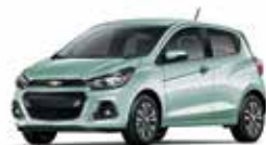
GP9 – MINT 1