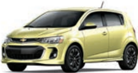
GMX – BRIMSTONE 1,2