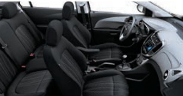
Jet Black Deluxe Cloth with Dark Titanium Accents 3