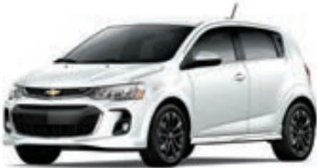
GAZ – SUMMIT WHITE