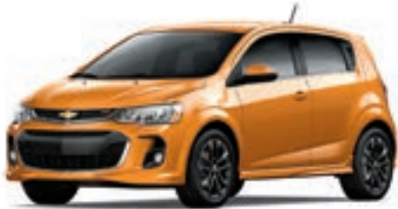
GGQ – ORANGE BURST METALLIC 1,2