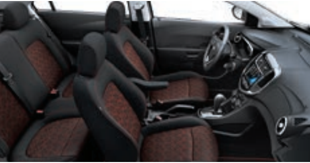
Jet Black Deluxe Cloth with Jet Black Accents 4,5