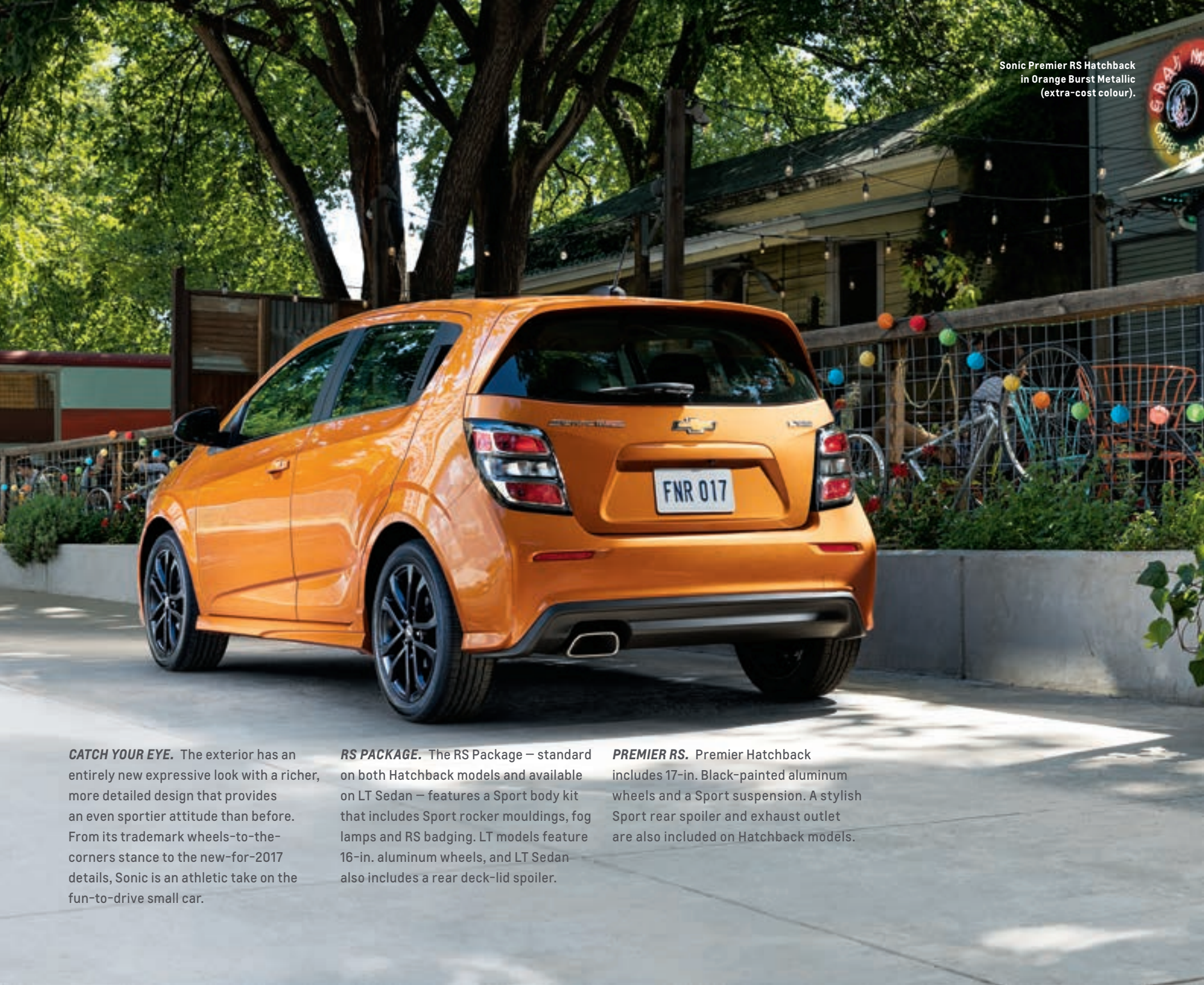
Sonic Premier RS Hatchback in Orange Burst Metallic (extra-cost colour).

CATCH YOUR EYE. The exterior has an entirely new expressive look with a richer, more detailed design that provides an even sportier attitude than before. From its trademark wheels-to-the-corners stance to the new-for-2017 details, Sonic is an athletic take on the fun-to-drive small car.