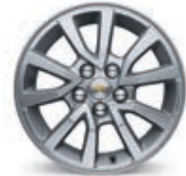
15" Aluminum (Standard on LT Sedan)