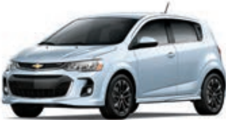
GGB – ARCTIC BLUE METALLIC 1