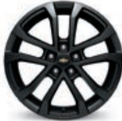
17" Black-Painted Aluminum (Standard on Premier)