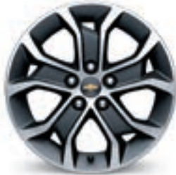
16" Aluminum (Standard on LT Hatchback, Available on LT Sedan 4 )