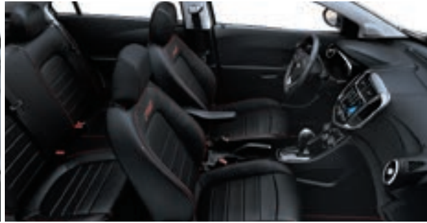
Jet Black Leatherette with Sueded Microfibre Inserts and Jet Black Accents 6