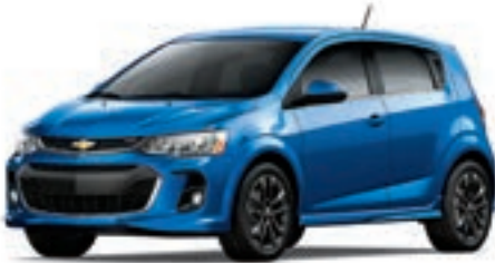
GD1 – KINETIC BLUE METALLIC 1