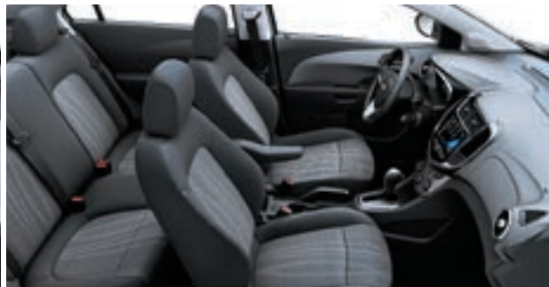
Dark Pewter Deluxe Cloth with Dark Titanium Accents 3