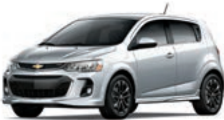
GAN – SILVER ICE METALLIC