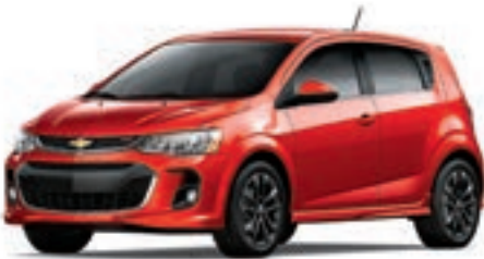
G7C – RED HOT