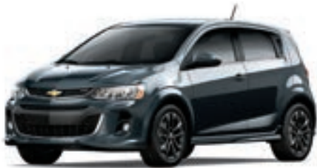
G7Q – NIGHTFALL GREY METALLIC 1