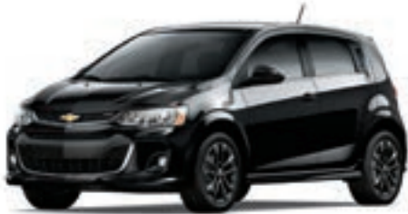
GB8 – MOSAIC BLACK METALLIC 1