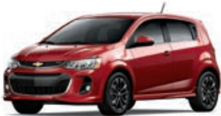
GPJ – CAJUN RED TINTCOAT 1