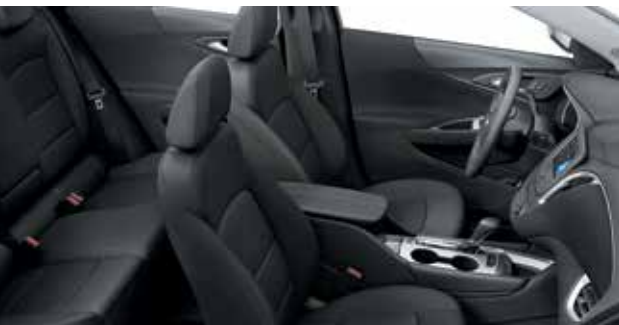
Jet Black Premium Cloth with Jet Black Accents 7,9