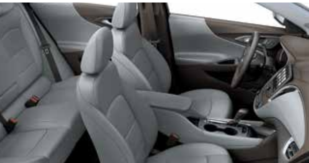
Medium Ash Grey Leather Appointments with Dark Atmosphere Accents 10,11