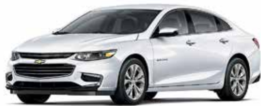
GAZ – SUMMIT WHITE