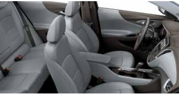
Medium Ash Grey Perforated Leather Appointments with Dark Atmosphere Accents 11,13