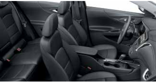
Jet Black Perforated Leather Appointments with Jet Black Accents 13