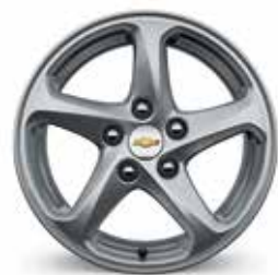
16" Aluminum (Standard on LS)