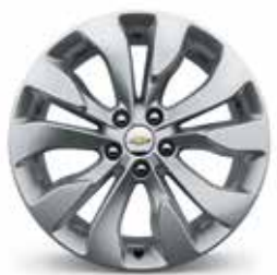
19" Aluminum (Available on Premier) 5