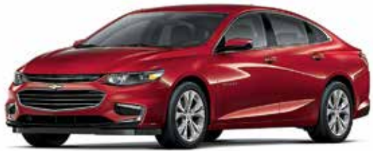
GBE – CAJUN RED TINTCOAT 1,2,3