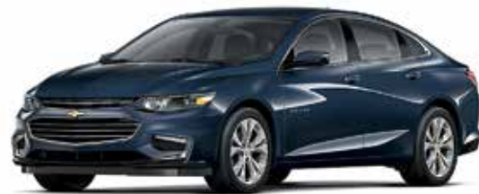
G1M – BLUE VELVET METALLIC 1