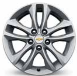
17" Aluminum (Standard on LT and Hybrid)