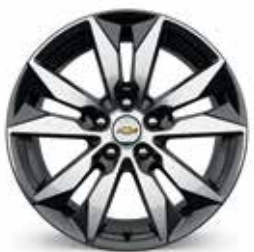
18" Aluminum (Available on LT) 4