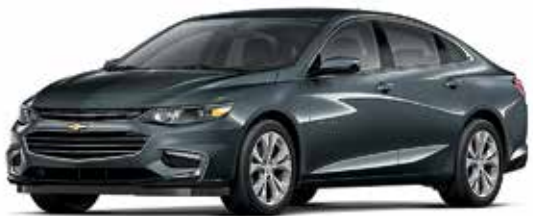
G7Q – NIGHTFALL GREY METALLIC 1,2