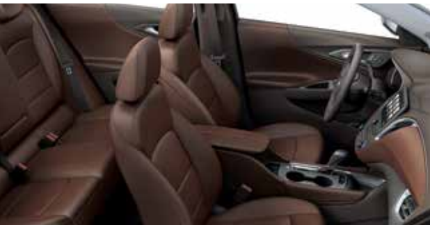
Loft Brown Leather Appointments with Dark Atmosphere Accents 10,12