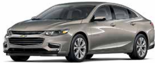
GMU – PEPPERDUST METALLIC 1,2,3