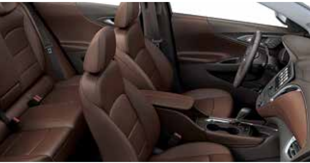
Loft Brown Perforated Leather Appointments with Dark Atmosphere Accents 12,13