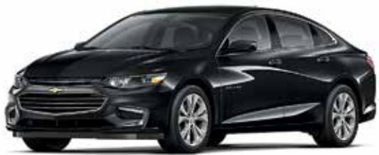
GB8 – MOSAIC BLACK METALLIC 1