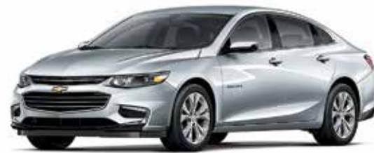
GAN – SILVER ICE METALLIC