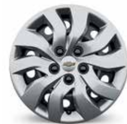
16" Steel with Wheel Cover (Standard on L)