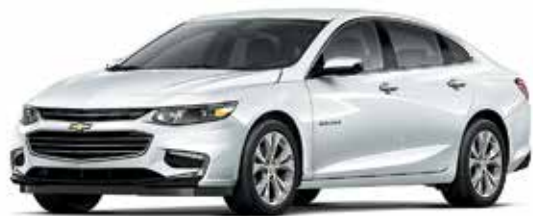
G1W – IRIDESCENT PEARL TRICOAT 1,2,3