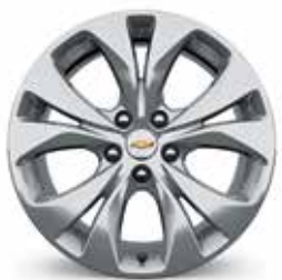
18" Aluminum (Standard on Premier)