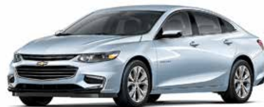
GGB – ARCTIC BLUE METALLIC 1,2,3