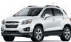
GAZ – SUMMIT WHITE