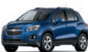
GTS – BLUE TOPAZ METALLIC 6