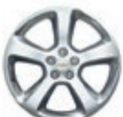
18" Silver-Painted Aluminum (Standard on LTZ)