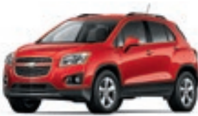
G7C – RED HOT