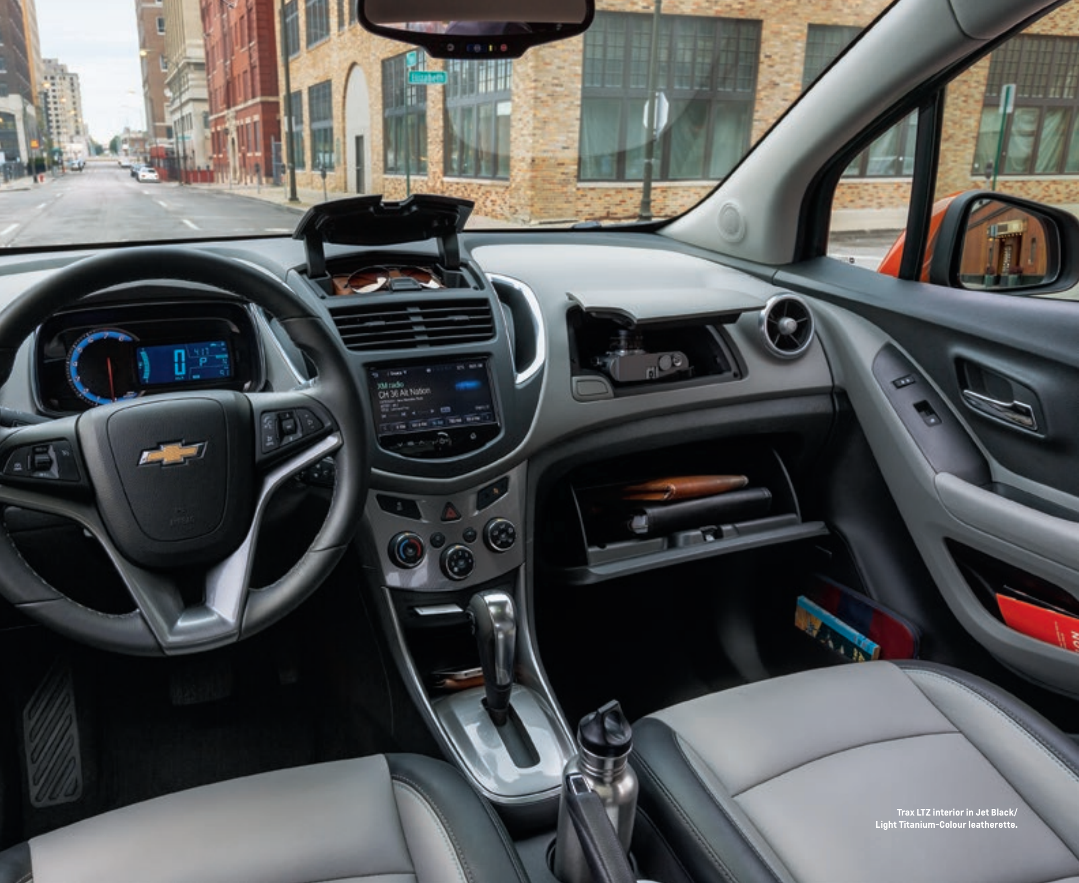
Trax LTZ interior in Jet Black/ Light Titanium-Colour leatherette.