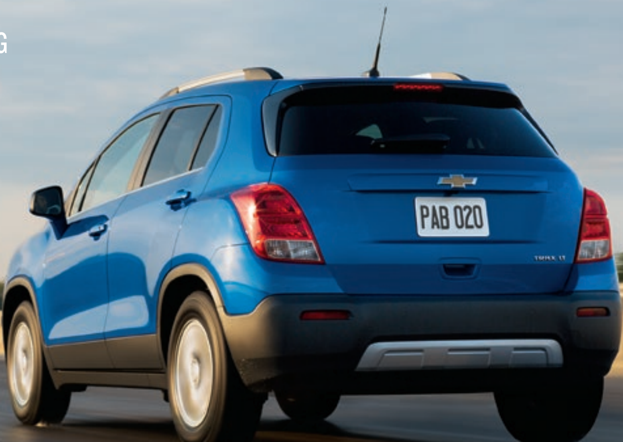
Trax LT in Blue Topaz Metallic with available features.

Helps improve power and increase fuel economy