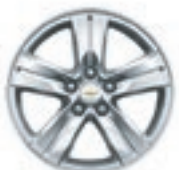
16" Aluminum (Standard on LT)