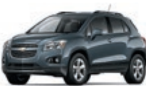
GBV – CYBER GREY METALLIC