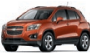
G8F – SUNSET ORANGE METALLIC 6