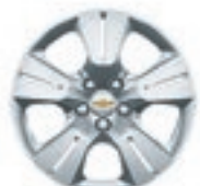
16" Steel with Wheel Cover (Standard on LS)