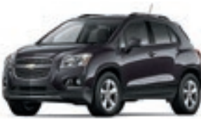
G7U – SABLE METALLIC 5