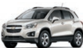
GWT – CHAMPAGNE SILVER METALLIC