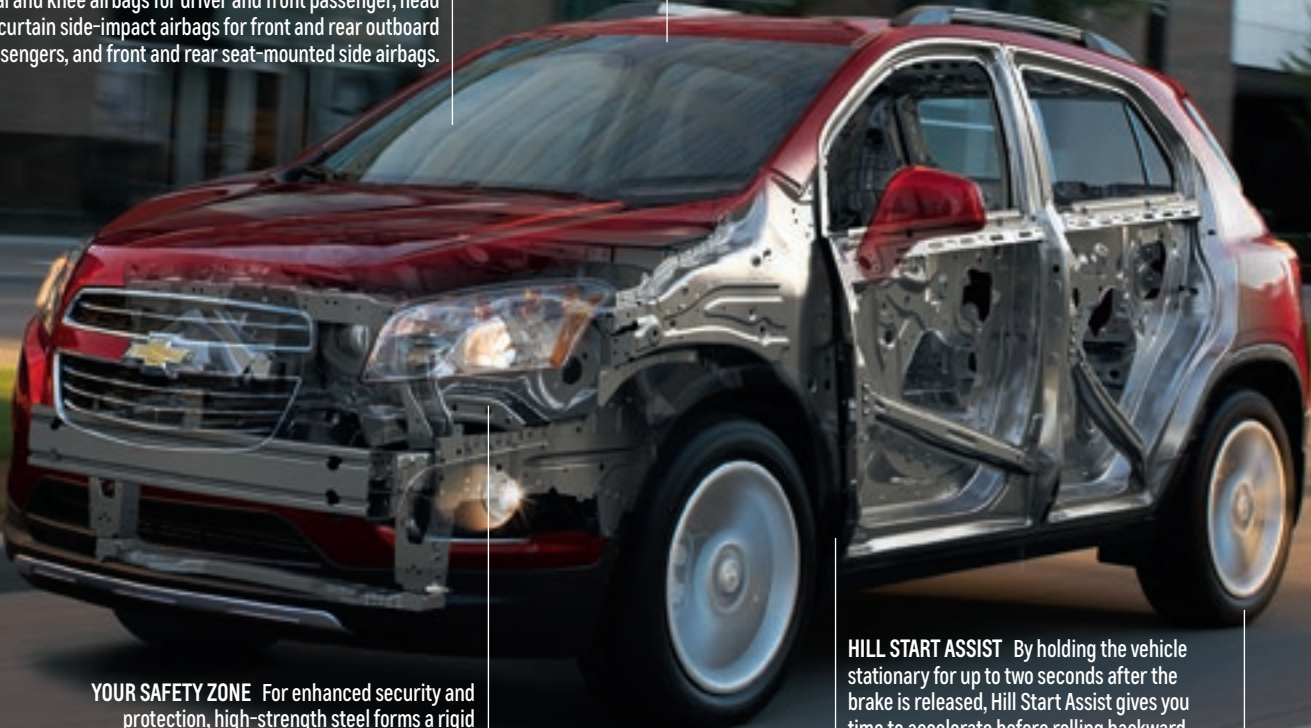
Trax LTZ in Crimson Metallic with available features.

HIGHEST POSSIBLE OVERALL VEHICLE SCORE FOR SAFETY 2 Trax received the U.S. National Highway Traffic Safety Administration's (NHTSA's) highest possible Overall Vehicle Score for safety. The comprehensive NHTSA New Car Assessment Program puts vehicles through frontal, side-impact and side pole crash tests, as well as rollover evaluations. Each model is then given safety ratings from one to five stars. The result: a 5-Star Overall Vehicle Score for Trax.