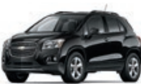
GB8 – MOSAIC BLACK METALLIC