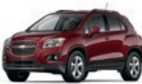
G7T – CRIMSON METALLIC