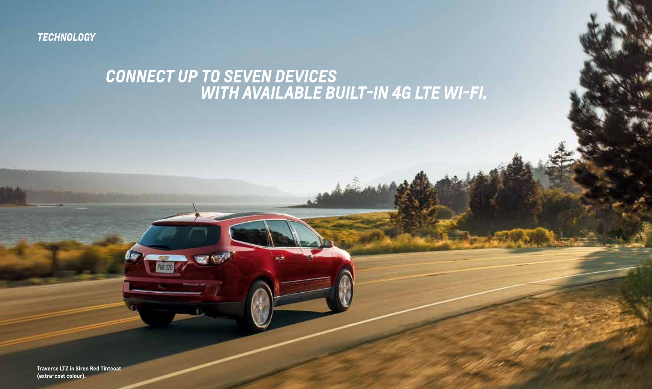
Traverse LTZ in Siren Red Tintcoat (extra-cost colour).

CONNECT UP TO SEVEN DEVICES WITH AVAILABLE BUILT-IN 4G LTE WI-FI.