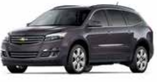
G7U – SABLE METALLIC 6,7