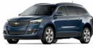
G1M – BLUE VELVET METALLIC