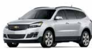
17U – SILVER ICE METALLIC