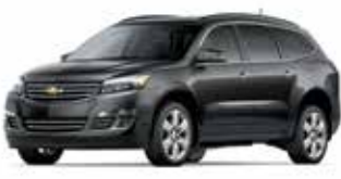
GXG – TUNGSTEN METALLIC