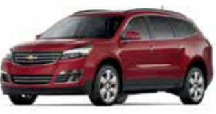
G1E – SIREN RED TINTCOAT 6,7