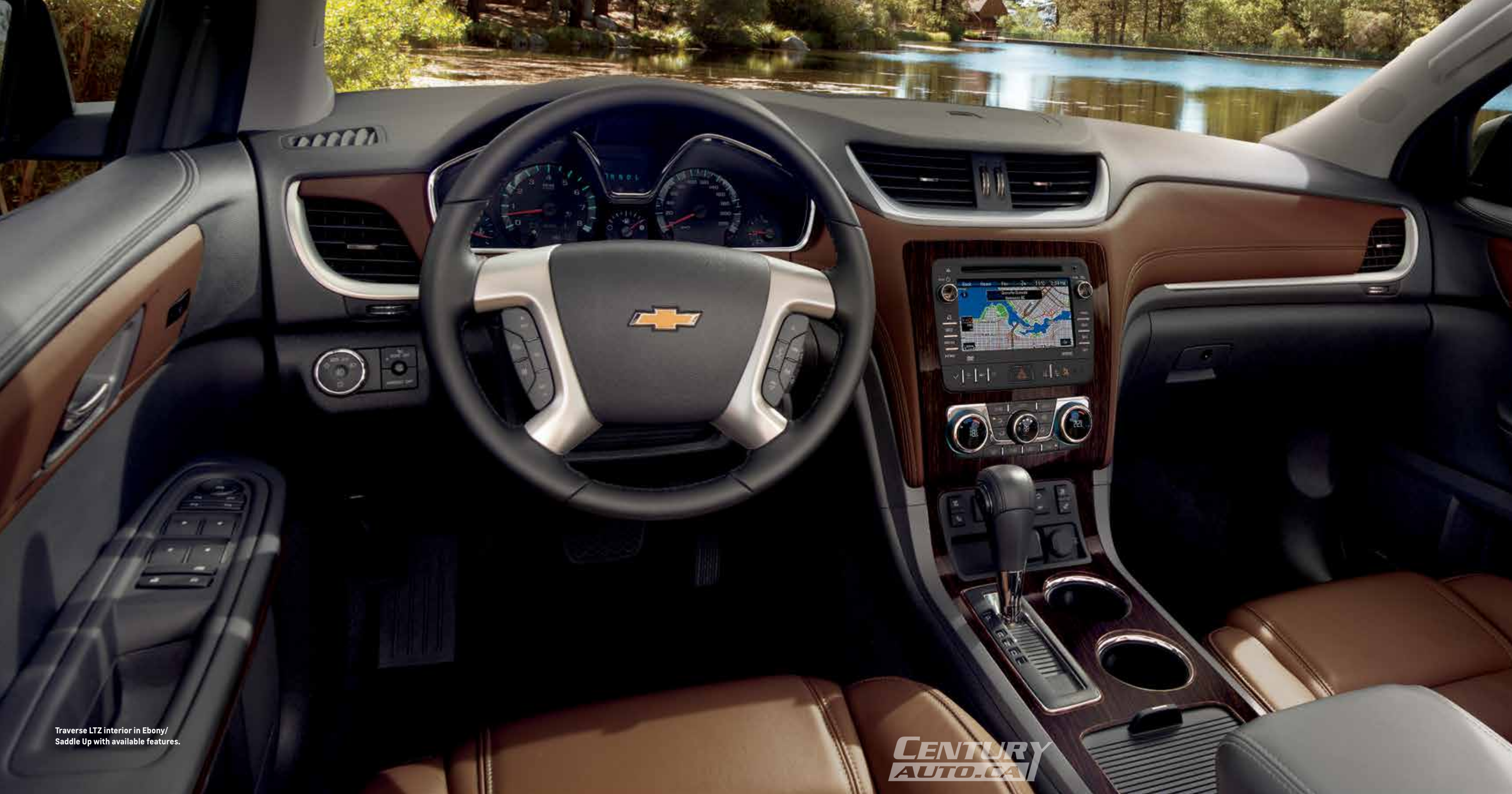
Traverse LTZ interior in Ebony/ Saddle Up with available features.