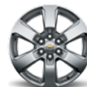
20" Painted-Aluminum (Available on 1LT; requires True North Edition)