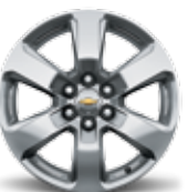
20" Machined-Aluminum (Standard on LTZ)