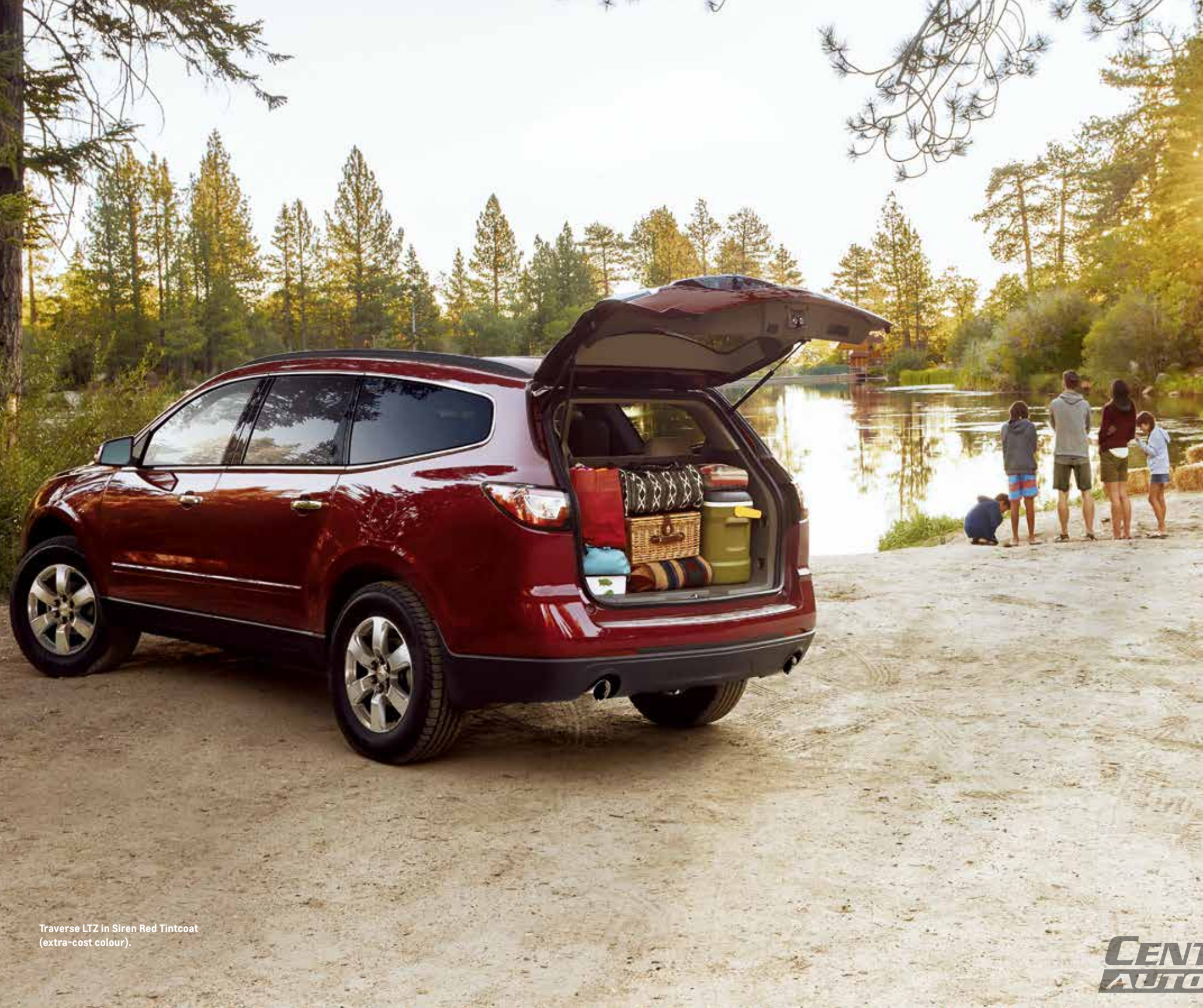
Traverse LTZ in Siren Red Tintcoat (extra-cost colour).