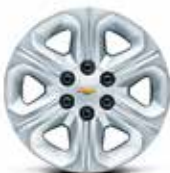
17" Steel with Painted Wheel Cover (Standard on LS)