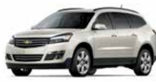
GWT – CHAMPAGNE SILVER METALLIC 6