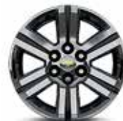
18" Machined-Aluminum (Standard on 1LT and 2LT)