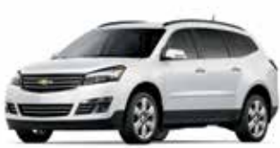
GAZ – SUMMIT WHITE