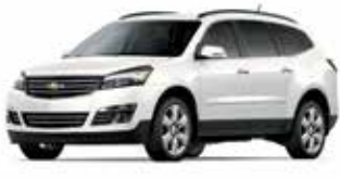
G1W – IRIDESCENT PEARL TRICOAT 6,7