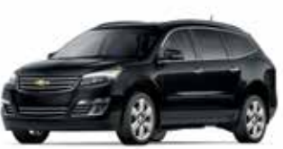
GB8 – MOSAIC BLACK METALLIC 6