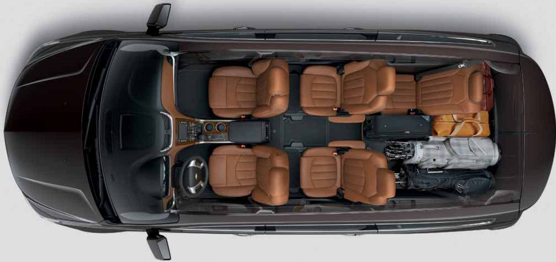
Traverse LTZ in Tungsten Metallic with Ebony/Saddle Up interior and available features.

SEATING FOR UP TO EIGHT. Choose standard seating for eight with second- and third-row flat-folding 60/40 split-bench seats (standard on LS and 1LT, available on 2LT). Or you can opt for 7-passenger seating with second-row flat-folding captain's chairs (standard on 2LT and LTZ).