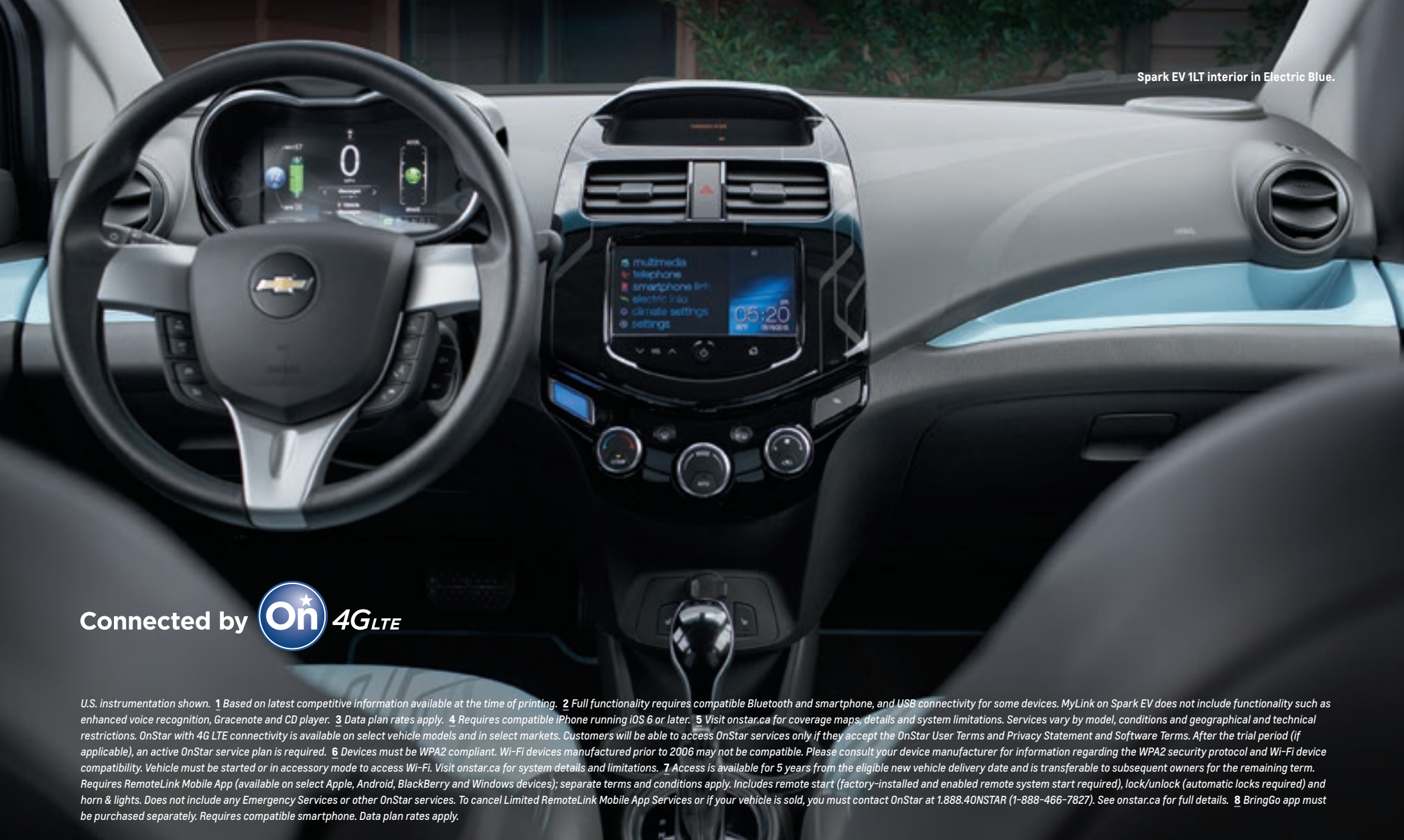
Spark EV 1LT interior in Electric Blue.