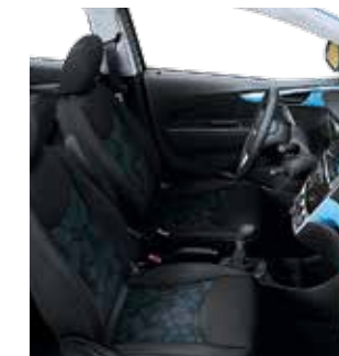
Jet Black Cloth with Blue Trim 8,11