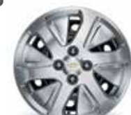
15" Steel with Bolt-On Wheel Cover (LS)