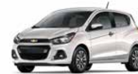
GV8 - TOASTED MARSHMALLOW