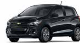
GAR - BLACK GRANITE 6