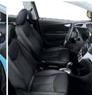
Jet Black Leatherette with White Trim 12,13