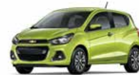
G6F - LIME