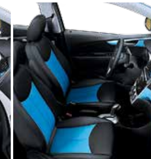
Jet Black Leatherette with Blue Inserts and Blue Trim 11,13