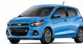
GW7 - SPLASH