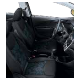
Jet Black Cloth 7