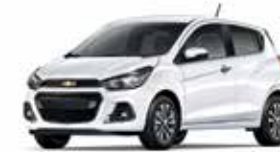
GAZ - SUMMIT WHITE