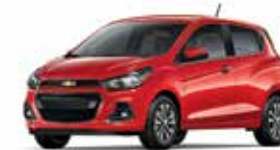
G6E - SALSA