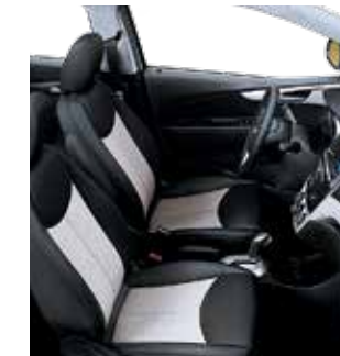
Jet Black Leatherette with Beige Inserts and Beige Trim 10,13