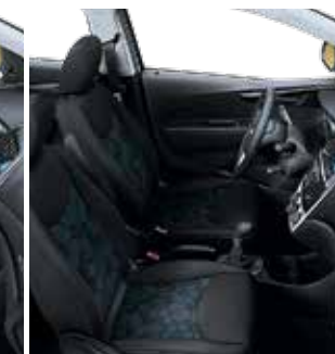
Jet Black Cloth with Piano Black Trim 8,9