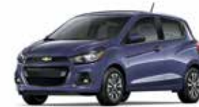
GV2 - KALAMATA