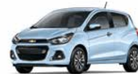
G54 - ELECTRIC BLUE