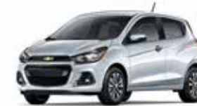
GAN - SILVER ICE