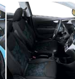
Jet Black Cloth with White Trim 8,12