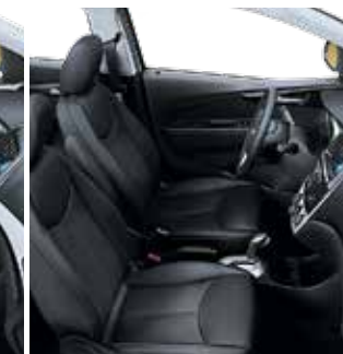
Jet Black Leatherette with Piano Black Trim 8,13