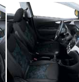
Jet Black Cloth with Beige Trim 8,10