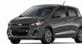
GVV - TITANIUM