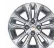
15" Silver-Painted Alloy (LT)

6 Available at extra cost. 7 Standard on LS. 8 Standard on 1LT. 9 Requires Salsa, Silver Ice, Black Granite or Kalamata exterior colours. 10 Requires Toasted Marshmallow exterior colour. 11 Requires Splash exterior colour. 12 Requires Electric Blue, Lime, Summit White or Titanium exterior colours. 13 Standard on 2LT.