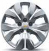
16" Silver-Painted Bolt-On Wheel Cover (Standard on LS and 1LT)