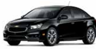
GAR - BLACK GRANITE METALLIC 5