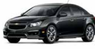
GXG - TUNGSTEN METALLIC 6