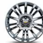
17" 15-Spoke Forged Polished-Aluminum Wheel (Standard on Eco)