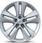
18" Split 5-Spoke Silver-Painted Flangeless Aluminum Wheel (Standard on LTZ, available on 2LT 7 )