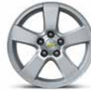
16" 5-Spoke Painted-Aluminum Wheel (Standard on 2LT, available on 1LT 7 )