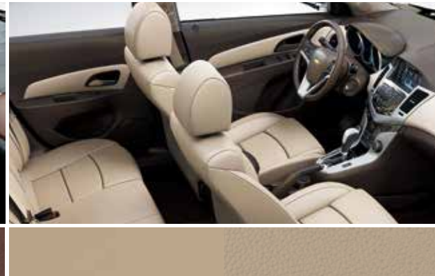
Cocoa/Light Neutral Leather Appointments 3,4