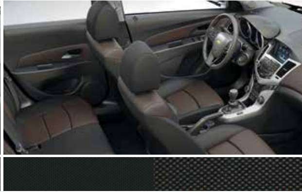
Jet Black/Brownstone Premium Cloth 2