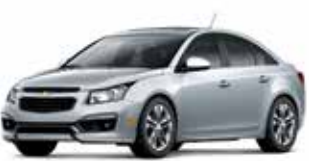
GAN - SILVER ICE METALLIC