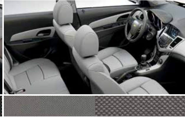
Medium Titanium-Colour Premium Cloth 2