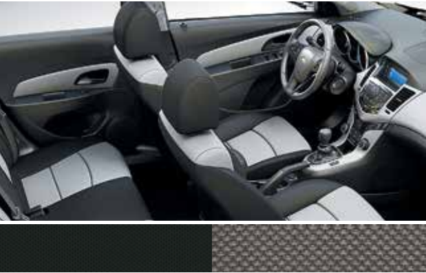
Jet Black/Medium Titanium-Colour Premium Cloth 1