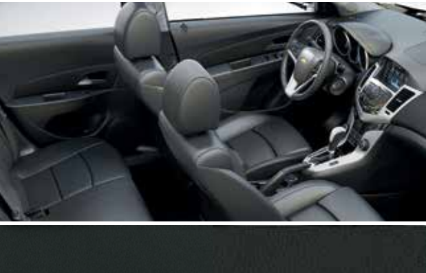
Jet Black Leather Appointments 3