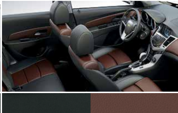
Jet Black/Brownstone Leather Appointments 3