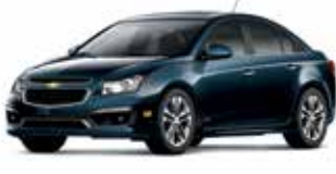
GXH - BLUE RAY METALLIC