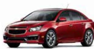
G1E - SIREN RED TINTCOAT 5,6