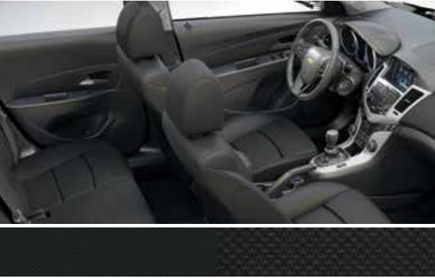
Jet Black Premium Cloth 2