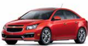
G7C - RED HOT