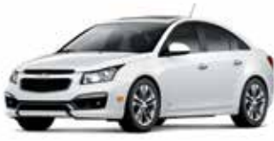
GAZ - SUMMIT WHITE