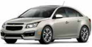
GWT - CHAMPAGNE SILVER METALLIC 6