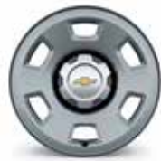
16" Ultra Silver Metallic-Painted Steel (Standard on Base and WT)