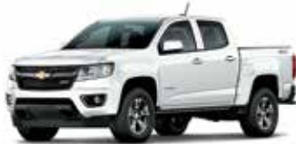
GAZ – SUMMIT WHITE