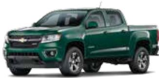
G7J – RAIN FOREST GREEN METALLIC 7,8