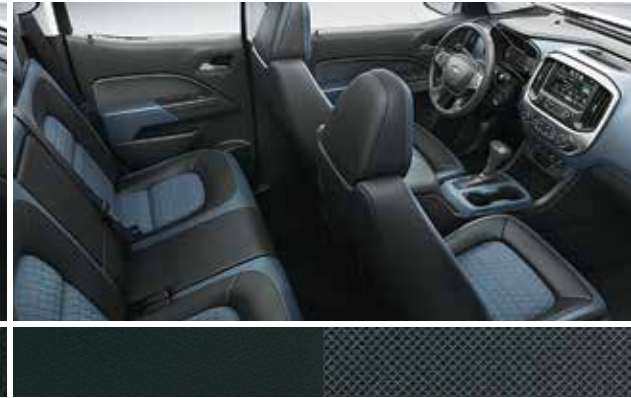
Jet Black Leatherette Appointments with Galvanized Cloth 6