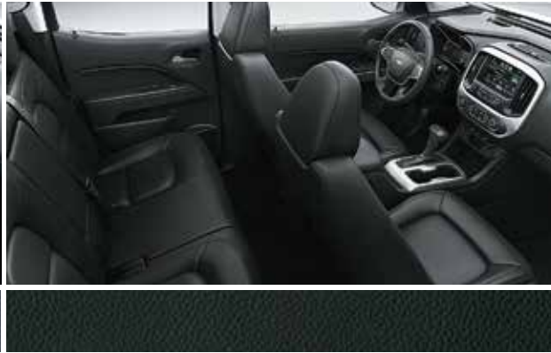
Jet Black Leather Appointments 5