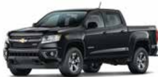
GBA – BLACK