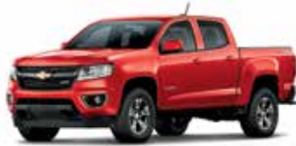
G7C – RED HOT 7