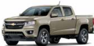
GWX – BROWNSTONE METALLIC 7