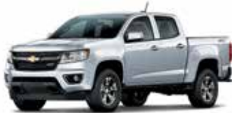
GAN – SILVER ICE METALLIC