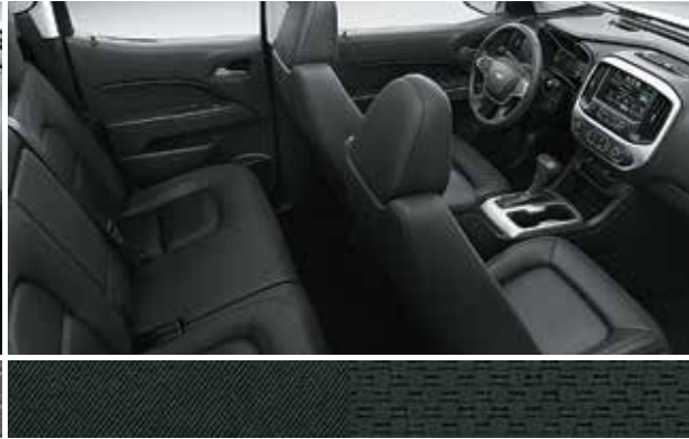
Jet Black Cloth 4