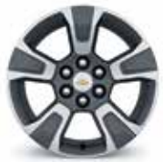
17" Dark Argent Metallic-Painted Cast-Aluminum (Standard on Z71)