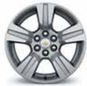
18" Dark Argent Metallic-Painted Cast-Aluminum (Available on LT)