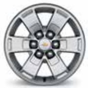
16" Ultra Silver Metallic-Painted Cast-Aluminum (Available on WT)