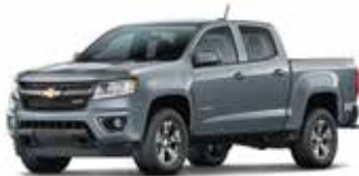
GBV – CYBER GREY METALLIC 7