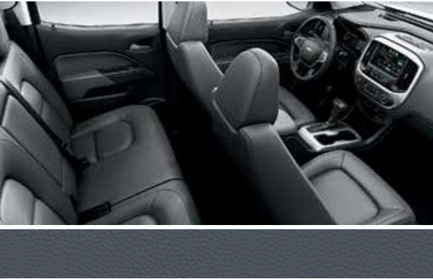
Jet Black/Dark Ash Leather Appointments 5