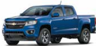
G7Z – LASER BLUE 7