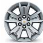
17" Blade Silver Metallic-Painted Cast-Aluminum (Standard on LT)