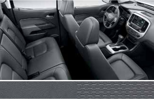
Jet Black/Dark Ash Cloth 3,4