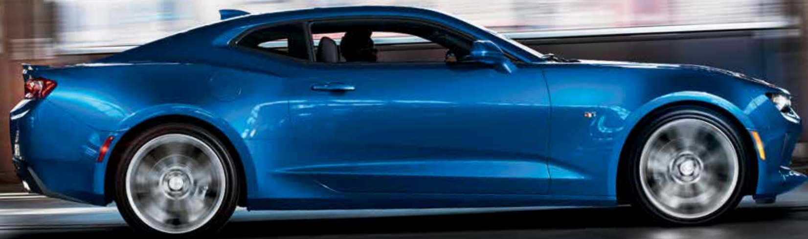
Camaro LT Coupe in Hyper Blue Metallic with available RS Package.