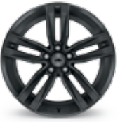
20" 5-Split-Spoke Low-Gloss Black Aluminum (RTH) (Available on LT)