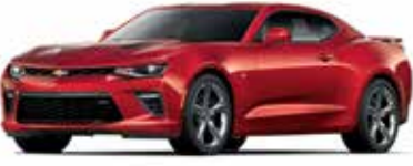
G7E – GARNET RED TINTCOAT 6