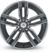
20" 5-Split-Spoke Grey-Painted Machined-Face Aluminum (56R) (Available on SS)