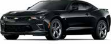
GB8 – MOSAIC BLACK METALLIC 6