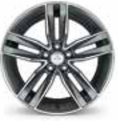
20" 5-Split-Spoke Grey-Painted Machined-Face Aluminum (RQ9) (Available on LT; included with available RS Package)