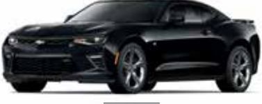
GBA – BLACK