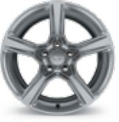
18" Silver-Painted Aluminum (REG) (Standard on LT)