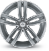
20" 5-Split-Spoke Bright Silver-Painted Aluminum (56S) (Standard on SS)