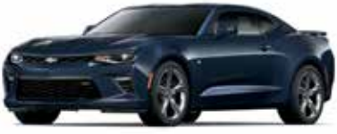
G1M – BLUE VELVET METALLIC 5