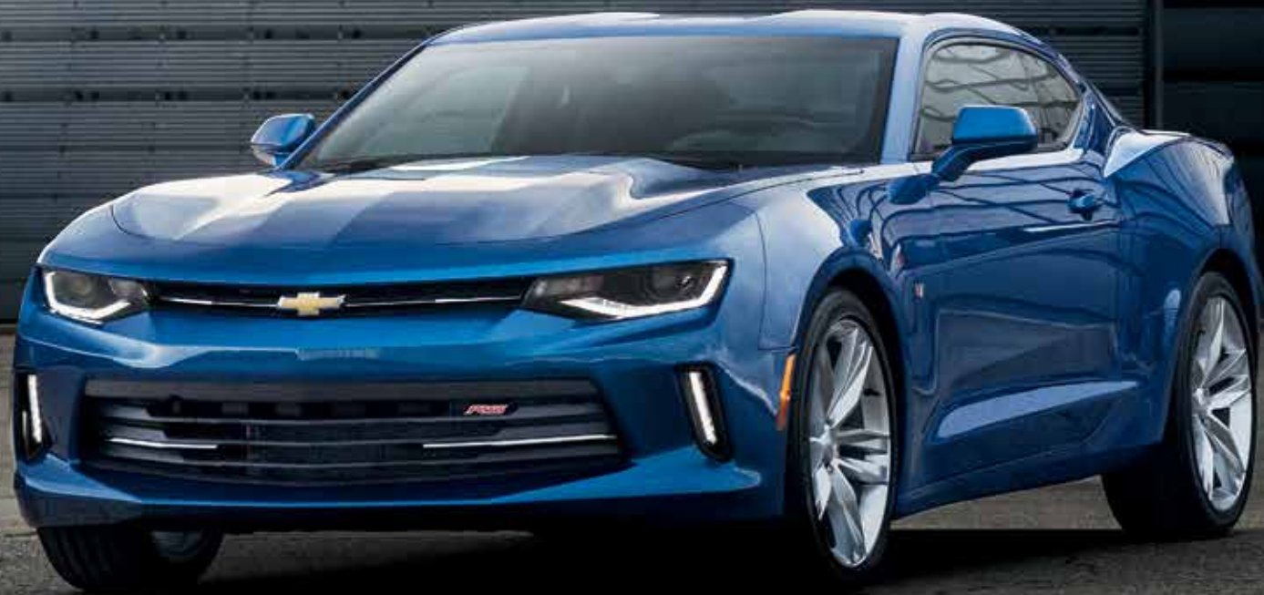
Camaro LT Coupe in Hyper Blue Metallic with available RS Package.