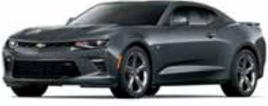
G7Q – NIGHTFALL GREY METALLIC