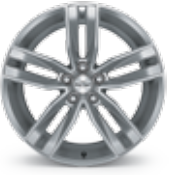
20" 5-Split-Spoke Bright Silver-Painted Aluminum (RTJ) (Available on LT; requires available RS Package)