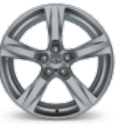
20" 5-Spoke Bright Silver-Painted Aluminum (56W) (Available on SS)