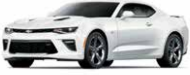
GAZ – SUMMIT WHITE