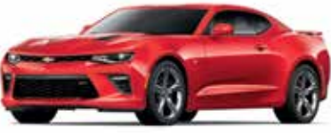
G7C – RED HOT