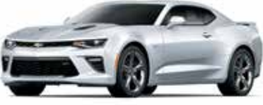
GAN – SILVER ICE METALLIC