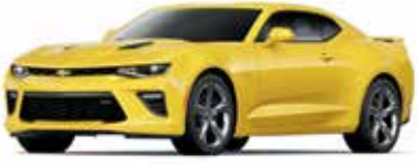
G7D – BRIGHT YELLOW 5, 6, 7