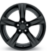
20" 5-Spoke Low-Gloss Black Aluminum (56V) (Available on SS)