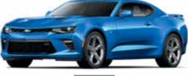
GD1 – HYPER BLUE METALLIC 5