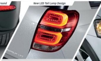
New LED Tail Lamp Design