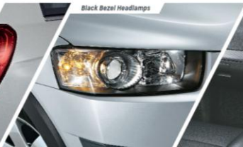
Black Bezel Headlamps