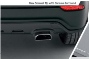
New Exhaust Tip with Chrome Surround