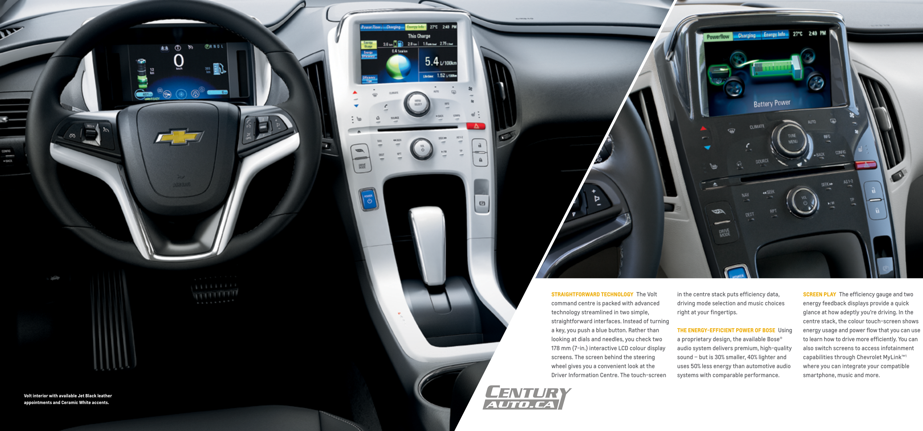
Volt interior with available Jet Black leather appointments and Ceramic White accents.