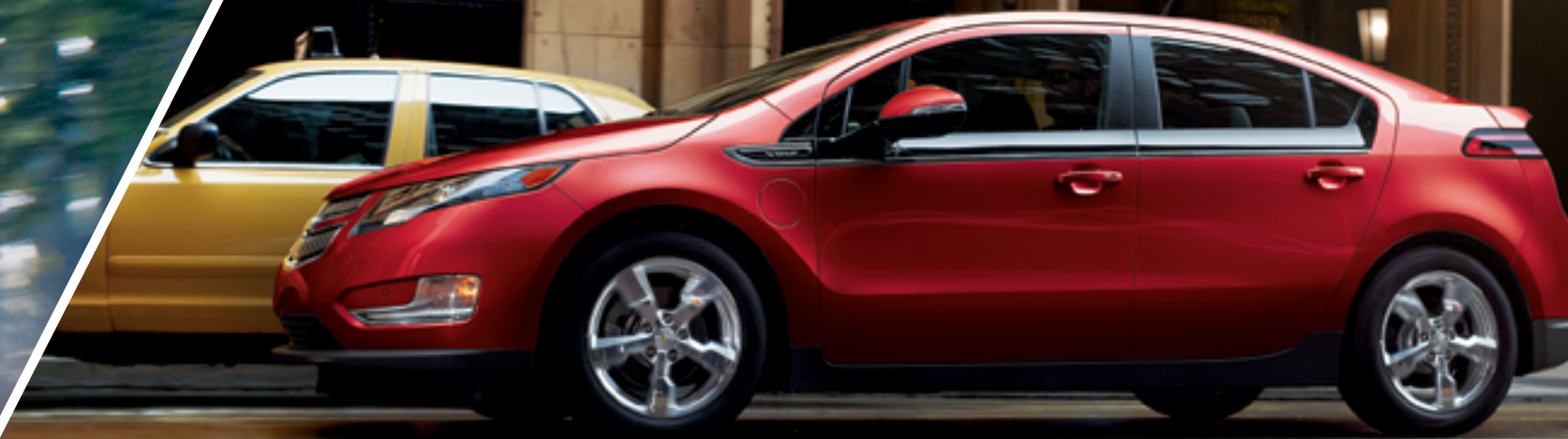
Volt in Crystal Red Tintcoat (extra-cost colour) with available features.

RESPONSIVE ACCELERATION The moment your foot hits the pedal, the adrenaline rush is immediate. It's a direct connection: head, right foot, motor, power. Without a traditional transmission, 273 lb.-ft. of low-end torque has nowhere to go except to the tires and pavement. And with the ability to reach a test-track speed of 160 km/h (100 mph), plus four versatile driving modes that you can easily shift between, it's clear that driving electric doesn't mean sacrificing performance.