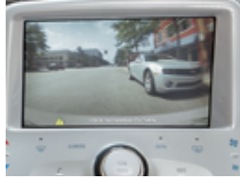
Rear vision camera.

IMMEDIATELY RESPONSIVE Volt automatically relays crucial information to the OnStar Command Centre via OnStar Automatic Crash Response. 4 There, trained OnStar Advisors utilize GPS technology to pinpoint your exact location and can request that assistance be sent right away — even if you're unable to respond.