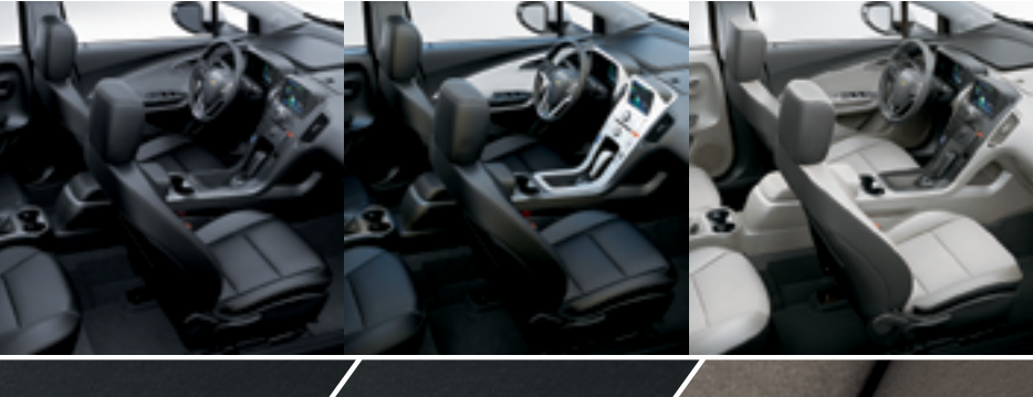
Jet Black Leather Appointments with Dark Accents 2