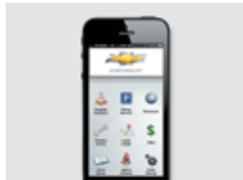
myChevrolet ® mobile app.

1 MyLink functionality varies by model. Full functionality requires compatible Bluetooth and smartphone, and USB connectivity for some devices. Visit MyLink.Chevrolet.ca for more details. 2 Data plan rates apply. 3 Available in 10 Canadian provinces and the 48 contiguous United States. Subscription sold separately after trial period. 4 Visit onstar.ca for coverage map, details and system limitations. Services vary by model and conditions. OnStar acts as a link to existing emergency service providers. Not all vehicles may transmit all crash data. After the complimentary trial period, an active OnStar service plan is required. 5 Requires Apple iOS or Android platform. 6 Available on select Apple, Android and BlackBerry devices. Services vary by device, vehicle and conditions. Requires active OnStar service plan. 7 U.S. Government 5-Star Safety Ratings are part of the National Highway Traffic Safety Administration's (NHTSA's) New Car Assessment Program ( www.SaferCar.gov ). 8 Included with available Enhanced Safety Package 2 which requires available Enhanced Safety Package 1.