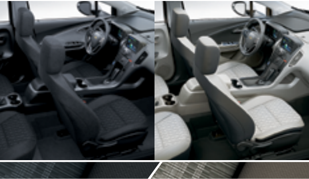
Jet Black Premium Cloth 1