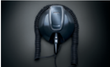
Available 240-Volt Fast-Charging Station.

The Chevrolet home charging provider, Bosch, offers Volt owners a one-stop shopping experience for a variety of charging stations and installation options, as well as information on special programs and incentives. Please see your dealer for details.