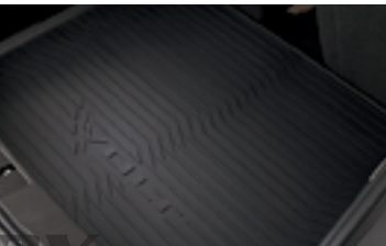
All-Weather Floor Mats