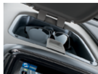
Convenient in-dash storage area.