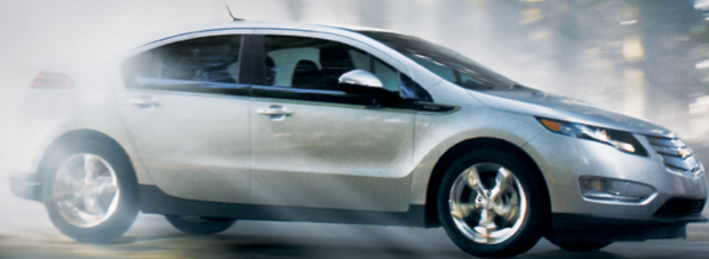
Volt in Silver Ice Metallic with available features.