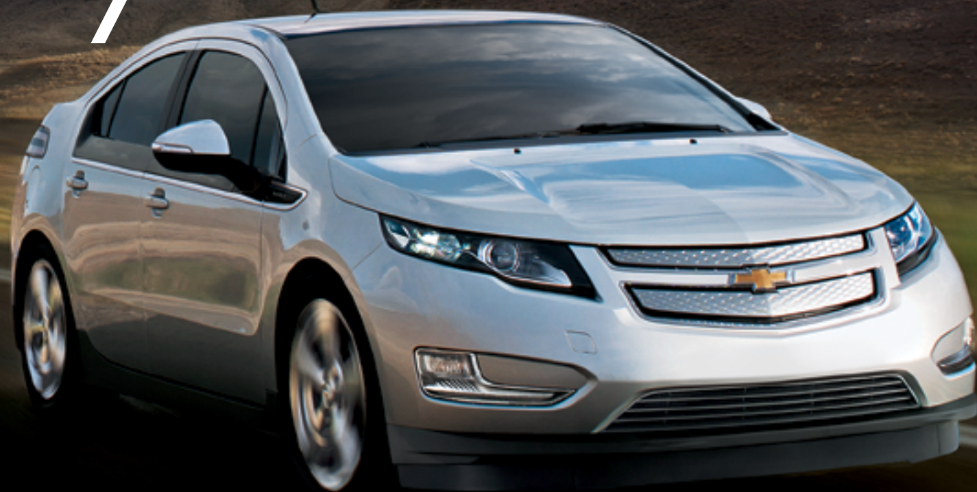
Volt in Silver Ice Metallic with available features.

The 2013 Chevrolet Volt was recognized by J.D. Power as the “Highest Ranked Vehicle Appeal among Compact Cars in the U.S., Three Years in a Row.” 1 The Automotive Performance, Execution and Layout (APEAL) Study looked at exterior styling, seating and storage space, comfort, convenience and other factors.