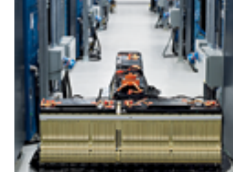
Uncovered look at the 288-cell lithium-ion battery pack.

1 Using the portable 120V charge cord will take approximately 16 hours at the 8-amp default setting and can be reduced to 10 hours at the 12-amp setting. 2 Professional installation required. For more information, visit pluginnow.com/ca for residential Bosch Automotive services. 3 Whichever comes first. See dealer for limited warranty details.