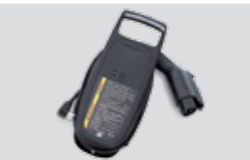
Extra Battery Charging Cable