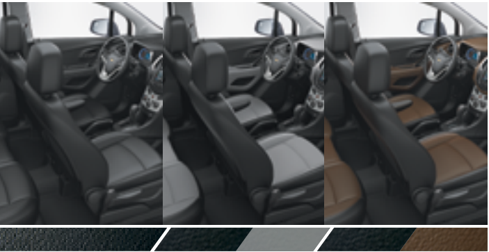
Jet Black Leatherette⁴ Jet Black/Light Titanium-Colour Leatherette⁴ Jet Black/Brownstone Leatherette⁴

1 Standard on LS. 2 Standard on 1LT. 3 Standard on 2LT. 4 Standard on LTZ.