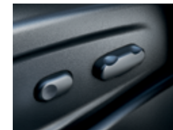
Available power 6-way driver seat.