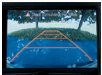
Rear vision camera.

1 MyLink functionality varies by model. Full functionality requires compatible Bluetooth and smartphone, and USB connectivity for some devices. MyLink on Trax does not include functionality such as enhanced voice recognition, Gracenote and CD player. Visit MyLink.Chevrolet.ca for more details. 2 Data plan rates apply. 3 BringGo app must be purchased separately. Requires compatible smartphone. Data plan rates apply. See dealer for more information. 4 Not compatible with all devices. 5 Available in 10 Canadian provinces and the 48 contiguous United States. Subscription sold separately after trial period. Visit siriusxm.ca for details.