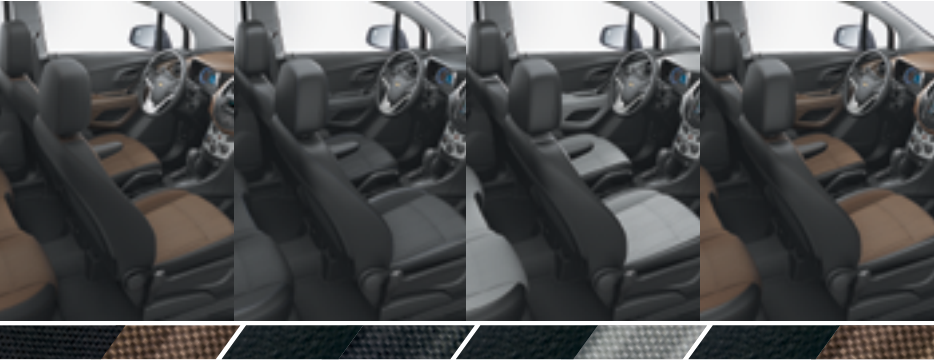
Jet Black/Brownstone Deluxe Cloth² Jet Black Cloth/Leatherette³ Jet Black/Light Titanium-Colour Cloth/Leatherette³ Jet Black/Brownstone Cloth/Leatherette³