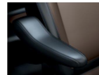
Standard driver inside armrest.