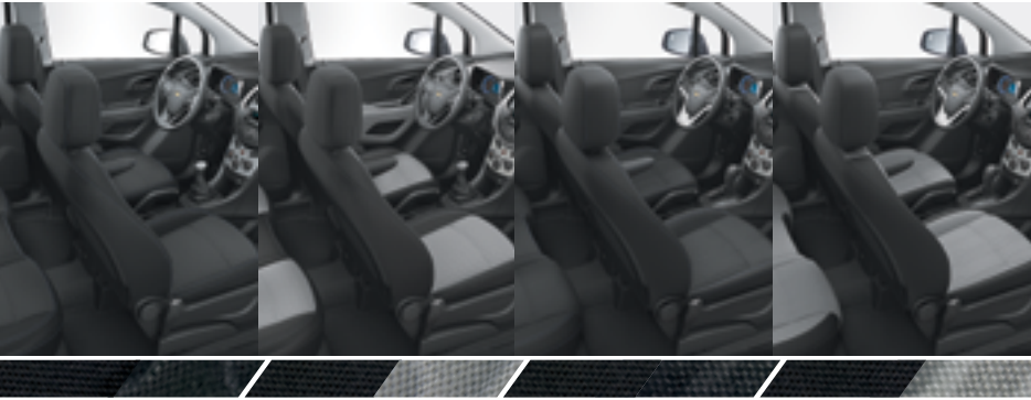
Jet Black Cloth¹ Jet Black/Light Titanium-Colour Cloth¹ Jet Black Deluxe Cloth² Jet Black/Light Titanium-Colour Deluxe Cloth²