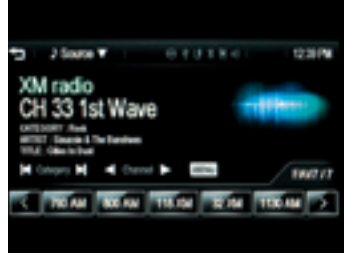
SiriusXM Satellite Radio 5

REAR VISION CAMERA Now it's easier to back up into a tight parking space. The rear vision camera system, standard on 2LT and LTZ models, uses the touch-screen display to help you see stationary objects behind your Trax when travelling in reverse at low speeds.