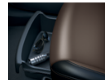
Front passenger under-seat storage tray.

1 MyLink functionality varies by model. Full functionality requires compatible Bluetooth and smartphone, and USB connectivity for some devices. MyLink on Trax does not include functionality such as enhanced voice recognition, Gracenote and CD player. Visit MyLink.Chevrolet.ca for more details.