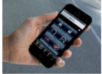
Available OnStar RemoteLink ™ mobile app. 7

Radio ™11 are at your fingertips. And now with Tuneln, ™10 you can experience radio and media from around the world. Put Spark in Park and use the available colour touch-screen and USB port 9 to connect to all your favourite movies and media.