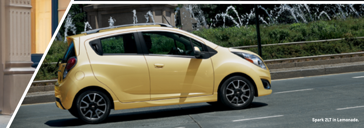
Spark 2LT in Lemonade.

MOVE MAGNIFICENTLY Exploring city streets is easy and oh so fun in Spark. For optimum driver control, choose the 5-speed manual transmission. Or for a smooth drive, opt for the available Continuously Variable Transmission (CVT). Either way, you'll love the adaptability. With a highway fuel consumption rating of 5.0 L/100 km 1 and a city rating of 6.5 L/100 km 1 you're getting a whole lot of efficiency from one mini car. Even parking is a joy. With a tight turning radius that better the MINI Cooper, you won't have to back down from city driving manoeuvres.