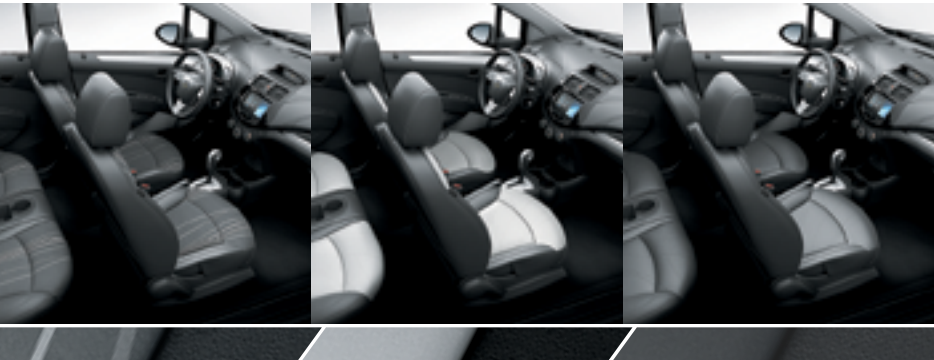
Dark Pewter-Colour Cloth with Silver-Colour Accents and Silver-Colour Trim 1,5 Dark Pewter-Colour Leatherette with Light Titanium-Colour Inserts and Silver-Colour Trim 6,7 Dark Pewter-Colour Leatherette and Silver-Colour Trim 6,8