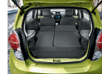
60/40 flip-and-fold rear seat.

PACK IT IN Commuting to work? Craving a night out? The surprisingly spacious interior means that even with three of your best friends in tow, you'll never find yourself looking for more elbow room. That's more space 1 than FIAT 500, smart fortwo and Scion iQ. Plus, with five doors and 883.6 litres (31.2 cubic feet) of maximum cargo space 2 , you can indulge in all your weekend hobbies without worries.