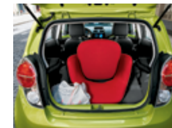
Room for whatever your weekend brings.