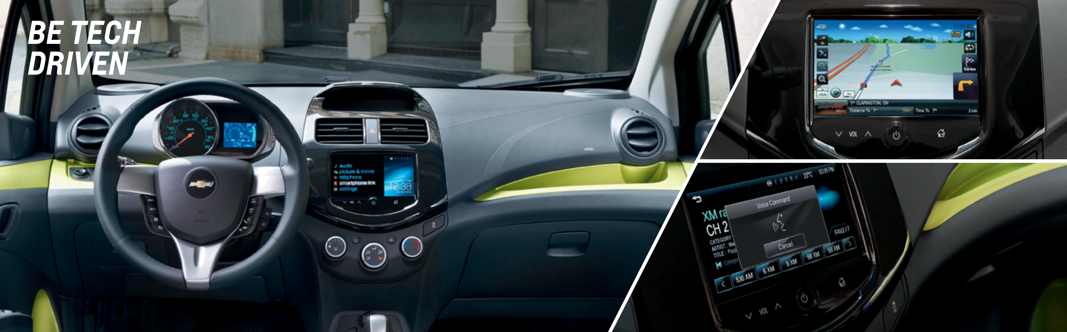
Spark 2LT interior in Dark Pewter-colour Leatherette and Green trim.

YOUR COMMAND CENTRE Smart technology. How about really smart technology? Start with the available Chevrolet MyLink 1 Radio. From there, you'll find connectivity, media, music, your favourite apps and more. And it's all within reach, thanks to the available 178 mm (7-in.) diagonal colour touch-screen display. Spark brings meaningful technology to your fingertips.