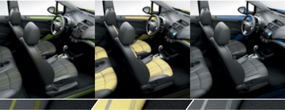
Dark Pewter-Colour Cloth with Green Accents and Green Trim 1,2 Dark Pewter-Colour Cloth with Yellow Inserts and Yellow Trim 1,3 Dark Pewter-Colour Cloth with Silver-Colour Accents and Blue Trim 1,4