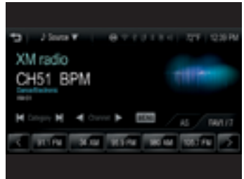
SiriusXM Satellite Radio. 11

1 MyLink functionality varies by model. Full functionality requires compatible Bluetooth and smartphone, and USB connectivity for some devices. MyLink on Spark does not include functionality such as enhanced voice recognition, Gracenote and CD player. Visit MyLink.Chevrolet.ca for more details.