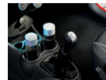
Convenience within reach.

1 Based on latest competitive information available at the time of printing. 2 Cargo and load capacity limited by weight and distribution.