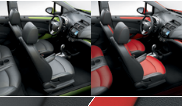
Dark Pewter-Colour Leatherette and Green Trim 2,9 Dark Pewter-Colour Leatherette with Red Inserts and Red Trim 6,9