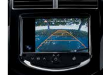
Available rear vision camera 3

1 MyLink functionality varies by model. Full functionality requires compatible Bluetooth and smartphone, and USB connectivity for some devices. MyLink on Sonic does not include functionality such as enhanced voice recognition, Gracenote and CD player. Visit MyLink.Chevrolet.ca for more details. 2 Not compatible with all devices. 3 Requires available Chevrolet MyLink. 4 Standard on LT, LTZ and RS. Available in 10 Canadian provinces and the 48 contiguous United States. Subscription sold separately after trial period. Visit siriusxm.ca for details. 5 Data plan rates apply.