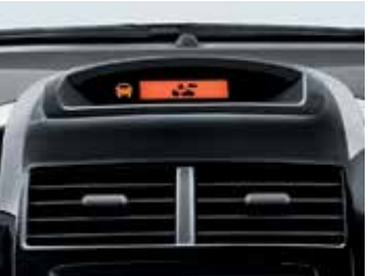
Available Forward Collision Alert.