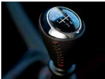
RS sport shift knob.