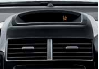
Available Lane Departure Warning.