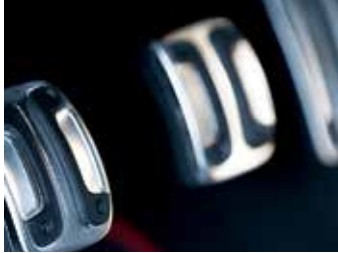
RS aluminum sport pedals.