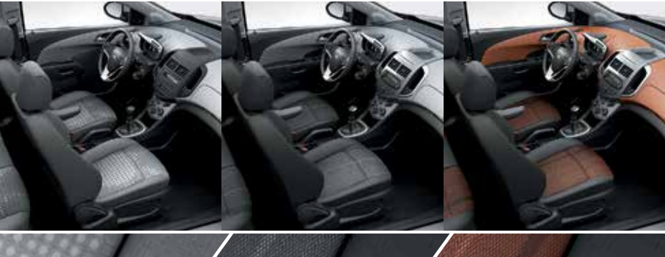
Jet Black/Dark Titanium-Colour Cloth 1 Jet Black/Dark Titanium-Colour Premium Cloth 2 Jet Black/Brick Premium Cloth 2