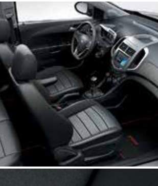
Jet Black Leather-Appointed Seats with Sueded Microfibre Inserts 4

1 Standard on LS. 2 Standard on LT. 3 Standard on LTZ. 4 Standard on RS.