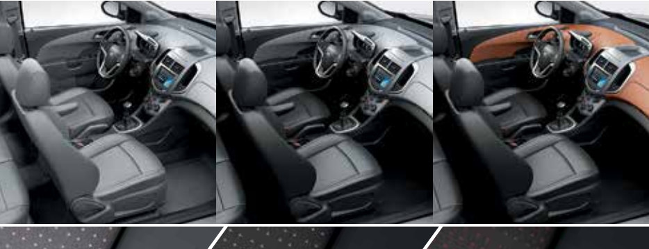
Dark Pewter-Colour/Dark Titanium-Colour Perforated Leatherette Seating Surfaces 3 Jet Black/Dark Titanium-Colour Perforated Leatherette Seating Surfaces 3 Jet Black/Brick Perforated Leatherette Seating Surfaces 3