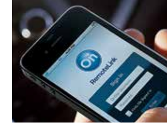
OnStar RemoteLink 7 mobile app.