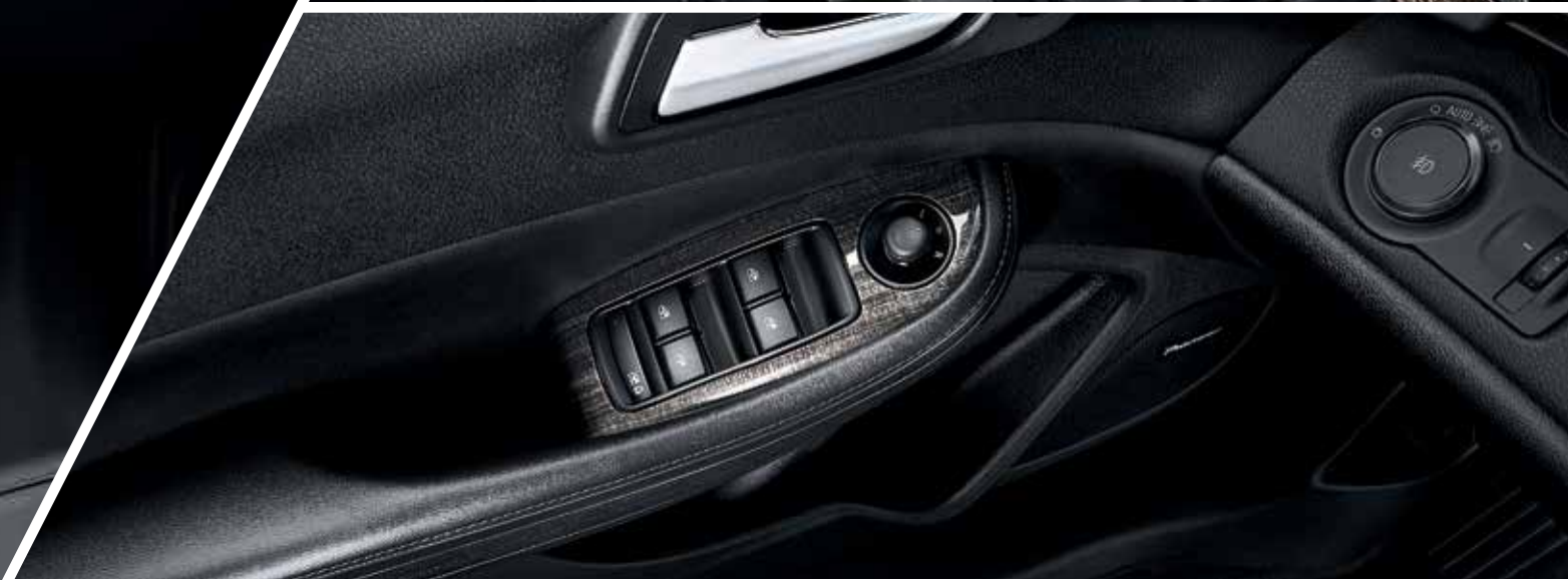
Malibu LTZ interior in Jet Black.

TUNED IN TO YOU Stay connected to your world, even when you're on the go. Available Chevrolet MyLink 1 works with your compatible smartphone and Bluetooth ® wireless technology to stream content to the 178 mm (7-in.) diagonal colour touch-screen. Chevrolet MyLink 1 allows you to make phone calls, select radio stations, choose music from your mobile device and listen to Stitcher SmartRadio ®2 through voice command, touch-screen controls, centre stack buttons and steering wheel-mounted controls. You can also connect your music-loaded flash drive or MP3 player through the USB port. 3