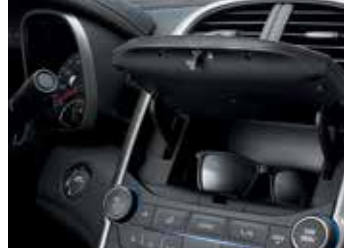
Convenient hidden storage area behind the touch-screen.

CONVENIENCE THROUGHOUT Malibu features an easily accessible hidden storage area behind the available 178 mm (7-in.) diagonal colour touch-screen. You can also organize the icons on the screen to best fit your needs. The available 120-volt AC household power outlet keeps your portable devices charged and ready. The centre console includes a pair of cupholders, an armrest and dedicated pockets for two mobile phones.