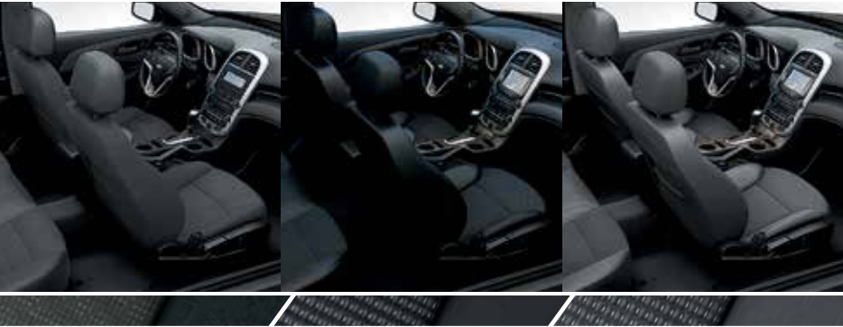
Jet Black/Titanium-Colour Cloth 1