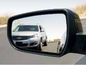
Available Side Blind Zone Alert¹