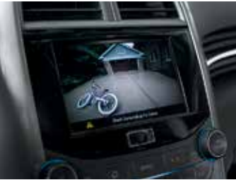
Available rear vision camera.

Malibu LTZ in White Diamond Tricoat (extra-cost colour).