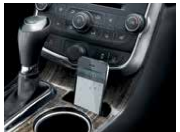
Mobile phone holder.