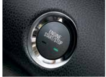
Available push-button start system.