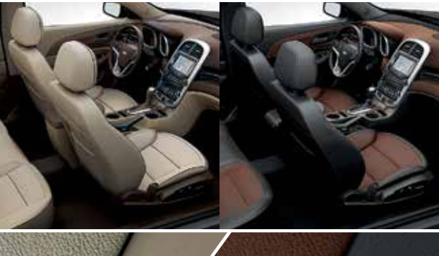
Cocoa/Light Neutral Leather Appointments/Vinyl Perimeter Accents 3,4