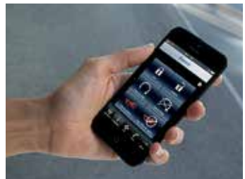
Available OnStar RemoteLink 7 mobile app.