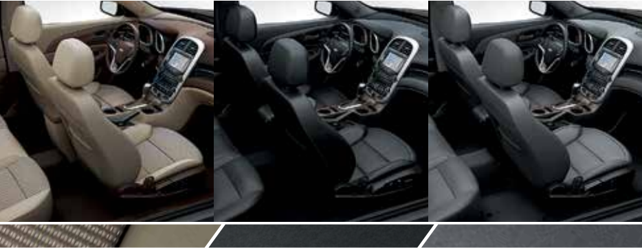
Cocoa/Light Neutral Premium Cloth/Leatherette Bolsters 2