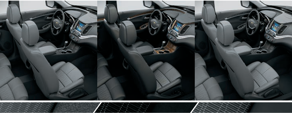
Jet Black/Dark Titanium-Colour Premium Cloth¹ Jet Black Premium Cloth/Leatherette² Jet Black/Dark Titanium-Colour Premium Cloth/Leatherette²