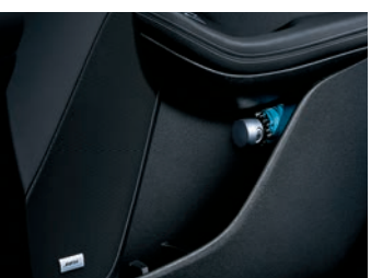
Convenient umbrella storage.