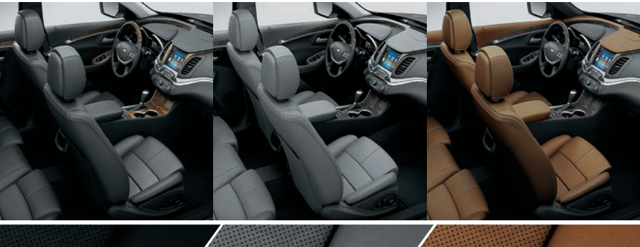
Jet Black Leather Appointments⁴ Jet Black/Dark Titanium-Colour Leather Appointments⁴ Jet Black/Mojave Leather Appointments⁴