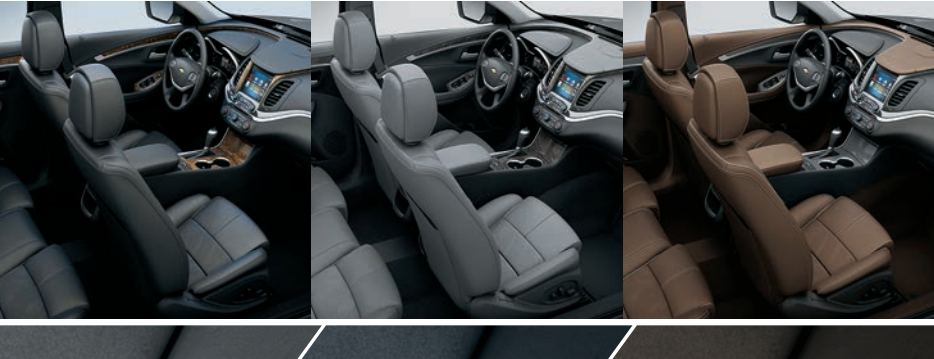
Jet Black Sueded Microfibre³ Jet Black/Dark Titanium-Colour Sueded Microfibre³ Jet Black/Brownstone Sueded Microfibre³