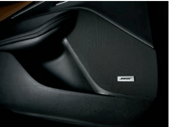
Available 11-speaker Bose® Centerpoint® surround sound audio system.