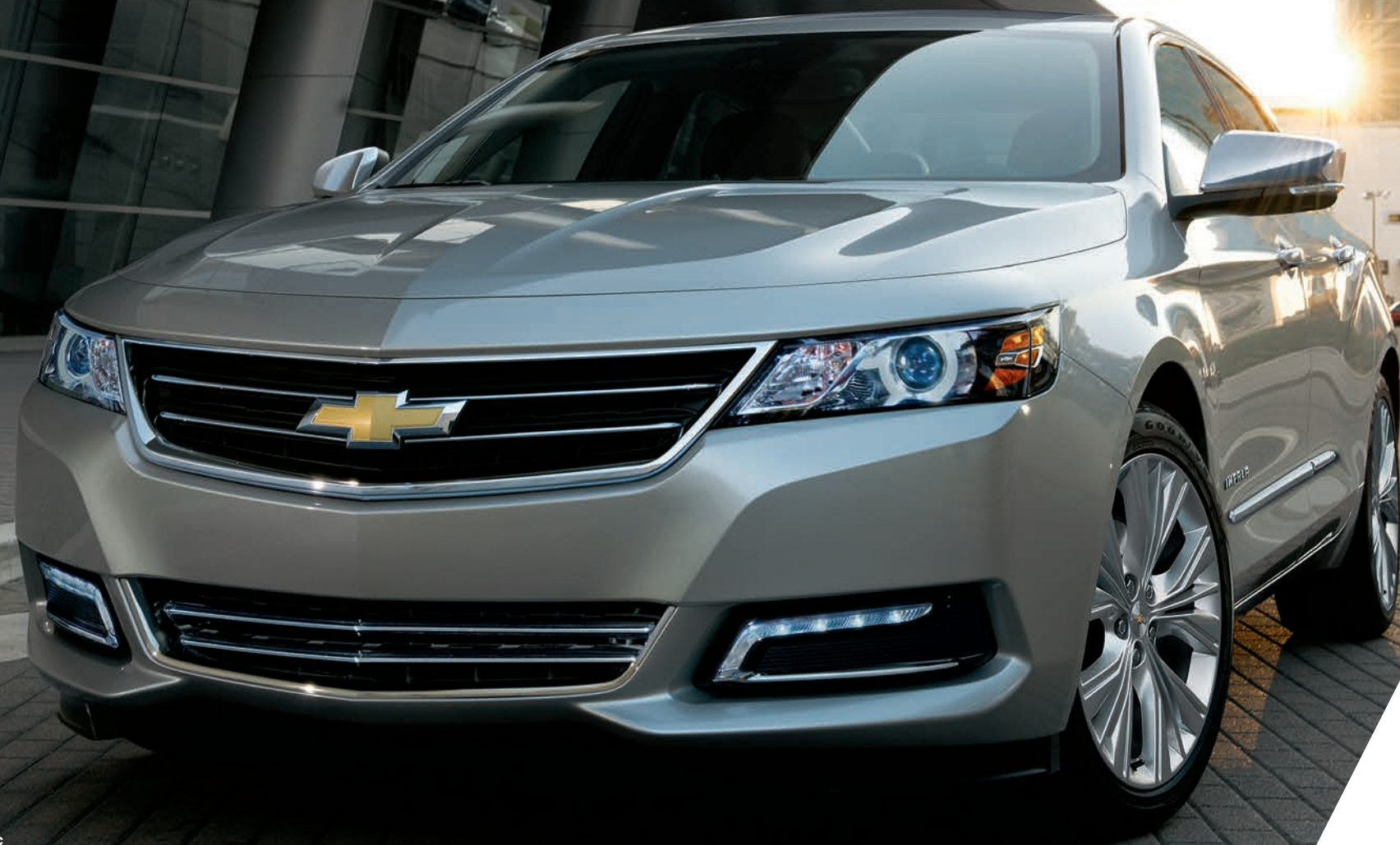
Impala LTZ in Silver Ice Metallic with available features.

A STUNNING CONVERGENCE OF DESIGN AND PERFORMANCE