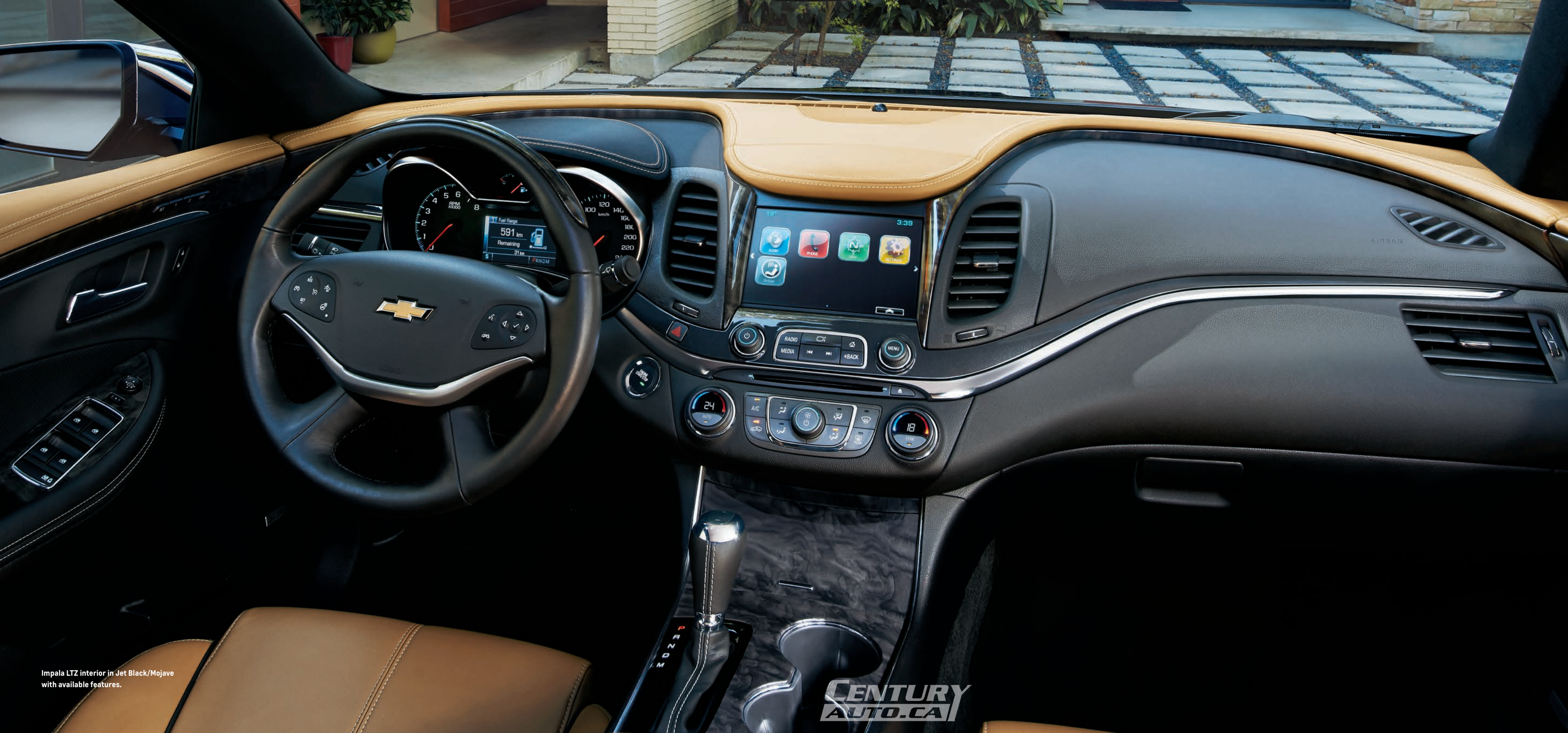
Impala LTZ interior in Jet Black/Mojave with available features.