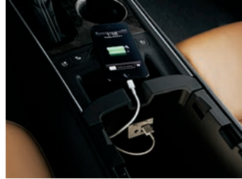
USB port. 3

to commercial-free music, sports, news and more with three trial months of SiriusXM Satellite Radio. 5 Get directions with OnStar® Turn-by-Turn Navigation 6 (standard for the first six months). Or choose the available Chevrolet MyLink Radio with Navigation, which offers full GPS navigation features plus 2-D/3-D maps, points of interest and SiriusXM NavTraffic. 5