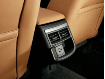
Available 120-volt AC household-style power outlet.