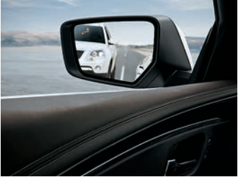
Available Side Blind Zone Alert 1

1 Before making a lane change, always check the Side Blind Zone Alert display, check the exterior and interior rear-view mirrors, look over your shoulder for vehicles and hazards, and start the turn signal. 2 Always use safety belts and the correct restraint for your child's age and size. Even in vehicles equipped with the Passenger Sensing System, children are safer when properly secured in a rear seat in the appropriate infant, child or booster seat. Never place a rear-facing infant restraint in the front seat of any vehicle equipped with a passenger airbag. See the Owner's Manual and the child safety seat instructions for more safety information. 3 Visit onstar.ca for coverage map, details and system limitations. Services vary by model and conditions. OnStar acts as a link to existing emergency service providers. Not all vehicles may transmit all crash data. After the complimentary trial period, an active OnStar service plan is required. 4 Adaptive Cruise Control is no substitute for the driver's personal responsibility to operate the vehicle in a safe manner. The driver needs to remain attentive to traffic and road conditions and provide the steering, braking or other inputs necessary to retain control of the vehicle.