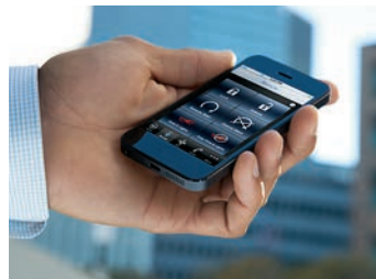
Available OnStar RemoteLink™ mobile app. 7

1 MyLink functionality varies by model. Full functionality requires compatible Bluetooth and smartphone, and USB connectivity for some devices. Visit MyLink.Chevrolet.ca for more details.