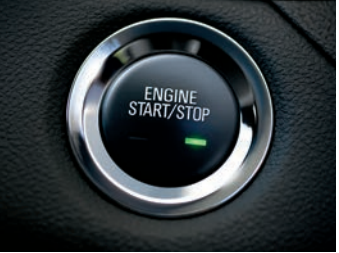
Available Keyless Access with push-button start.