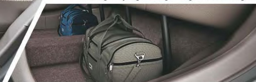
Storage Space under Rear Seat: Helps organise your in-cabin luggage without having to stow it in the boot.