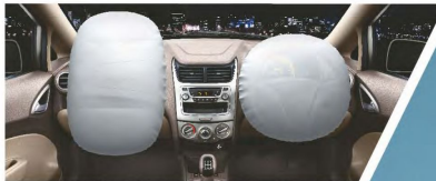
Dual Airbags: Cushion the front seat occupants & provide protection during high speed frontal impact.

The Chevrolet SAIL comes with an unmatched set of active and passive safety features. Its Safe-Cage Design with a 3-point force dispersion structure with in-built crumple zones and side impact beam in doors provides enhanced safety for the cabin occupants. The centrally-located fuel tank fortified by cross-structures is an added protection in case of a side impact. Made of sterner stuff, well it's true.