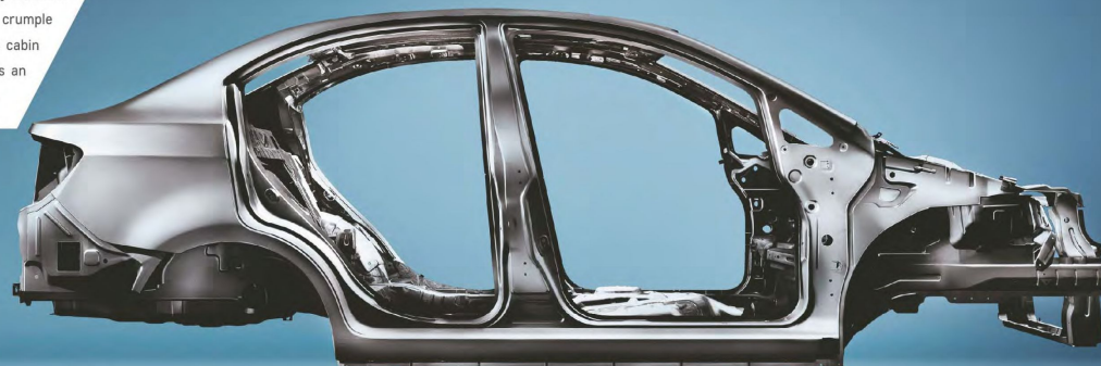
Chevrolet Safe-Cage Design - Cocoon of safety