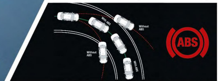
ABS + EBD: Prevent wheel lock to ensure you retain steering control during emergency braking manoeuvres.