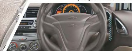
Tilt Steering: For adjusting the steering wheel angle for enhanced driving comfort.