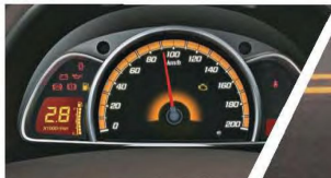
Rising Sun Style Instrument Cluster: With a Digital Tachometer.