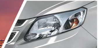
Hawk-Wing Style Front Headlamps: Add a swanky dimension & visual impact of the bold front styling.