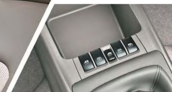
4 Door Power Windows: For comfort and convenience of operating windows at the touch of a button.