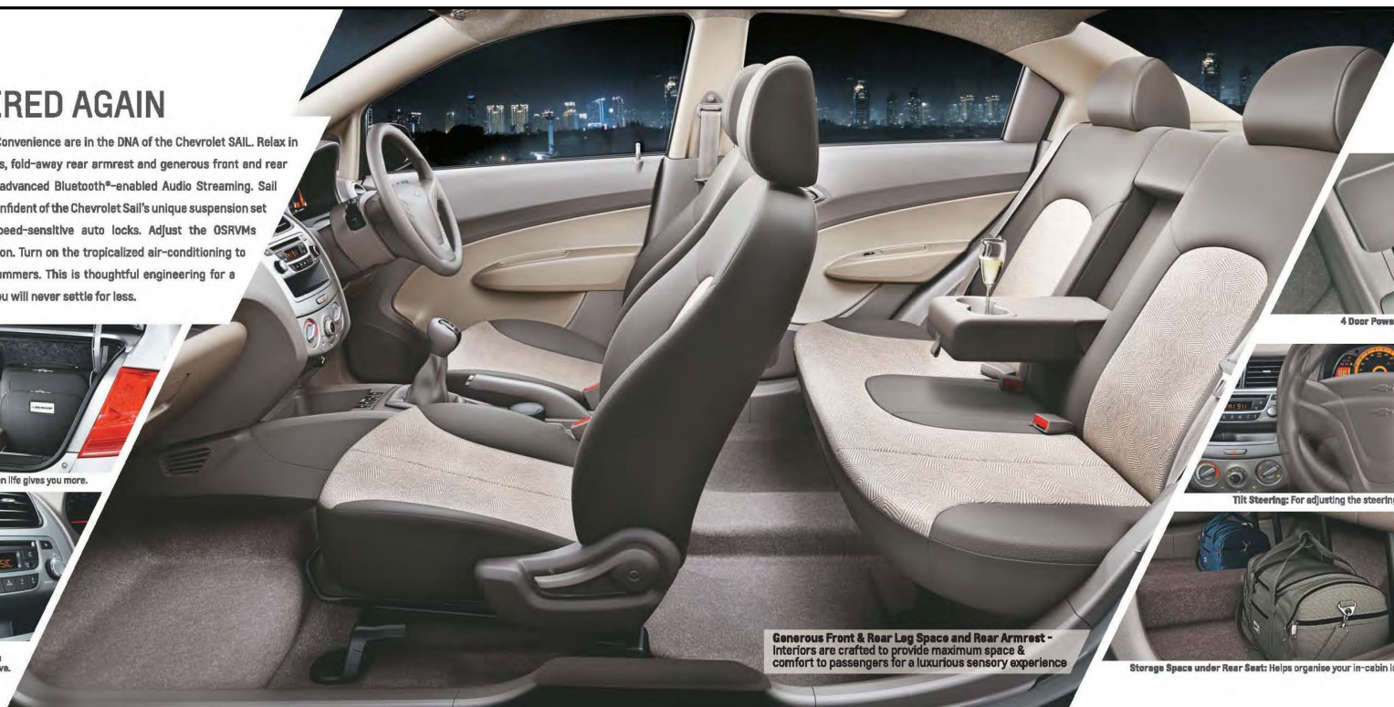
Generous Front & Rear Leg Space and Rear Armrest - Interiors are crafted to provide maximum space & comfort to passengers for a luxurious sensory experience