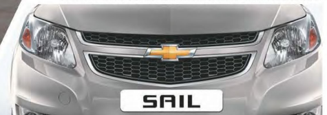
Dynamic Sculpture Design with Bold Front-end Styling: Adds premium appeal to the aggression of the taut and sculpted form.