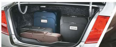
Superior Boot Space: To fit in your world when life gives you more.

Luxurious Comfort and Ergonomic Convenience are in the DNA of the Chevrolet SAIL. Relax in the comfort of well-supported seats, fold-away rear armrest and generous front and rear legroom. Enjoy the drive with the advanced Bluetooth®-enabled Audio Streaming. Sail comfortably over pot-holed roads confident of the Chevrolet Sail's unique suspension set up. Drive off smiling with the speed-sensitive auto locks. Adjust the OSRVs electrically at just a touch of a button. Turn on the tropicalized air-conditioning to enjoy a cool breeze in the harsh summers. This is thoughtful engineering for a rejuvenating driving experience – you will never settle for less.