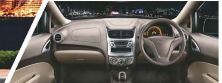
Chevrolet Corvette-Inspired Dual Cockpit design: With wide horizon view dash design enhances functional & aesthetic interior appeal.