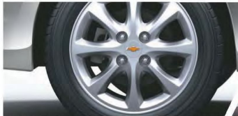
Alloy Wheels: Stylish & sporty 8 Spoke, 14 Inch alloy wheels enhance appeal & performance.

The Chevrolet SAIL belongs to those who stand out. An aggressive and macho front styling based on the Dynamic Sculpture Design philosophy, along with its wide stance lends it an unmatched grace and awe inspiring presence. Elegant finish and broad shoulders apart, the muscular physique of the Chevrolet SAIL gets glamour to the grace with its elegant wide-angled jewel-effect tail lamps and wrap around head-lamps. The stunning Chevrolet Corvette Inspired Dual Cockpit Interior Design with a refreshing Rising Sun instrument cluster, luxuriously blended two tone interiors with highlights in silver and chrome, define the overall appeal and charm of the Chevrolet SAIL that commands respect and envy both at the same time.