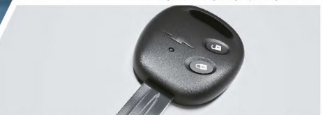
Engine Immobilizer with Remote Keyless Central Door Locking: For enhanced security of your car.