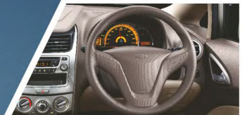
Collapsible Steering: An additional safety feature for driver protection in case of frontal impact.