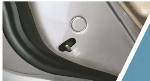
Child Protection Rear Door Locks: Prevent inadvertent door opening to protect your little ones.