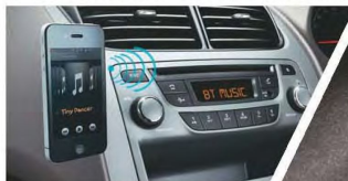
Fun Wide Audio System: Bluetooth® enabled Music Streaming & Mobile Hands-free system transforms your car into a jukebox on the move.