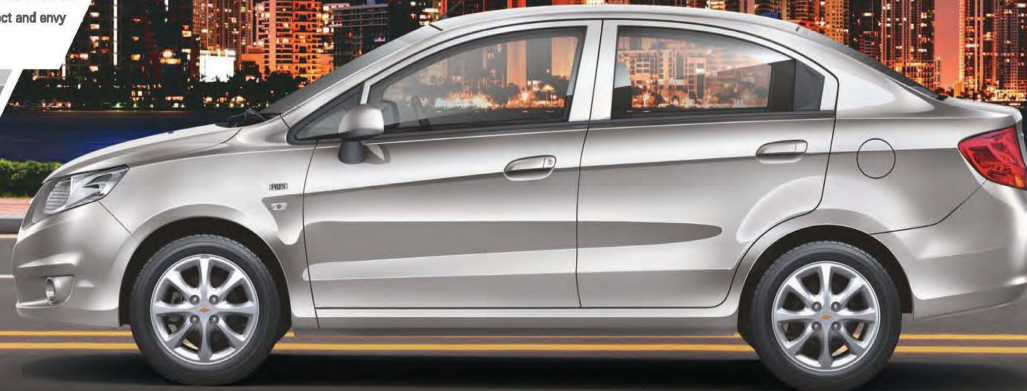
Dynamic Sculpture Design