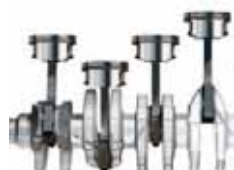
Vortec 2.9L I-4 engine