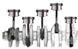
Vortec 3.7L I-5 engine

Power and efficiency. This is the name of the game when talking about the standard 185-hp Vortec 2.9L I-4 engine and available 242-hp Vortec 3.7L I-5 engine. The I-4 engine offers an EPA estimated 25 MPG highway, and the I-5 engine offers better highway fuel economy than any V6 midsize pickup. 8