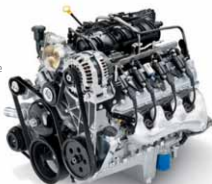
Vortec 5.3L V8

Kick it up a notch. The available Vortec 5.3L V8 engine cranks out a seat-clenching 300 horsepower. And with an EPA estimated 20 MPG highway on 2WD models, this engine offers better highway fuel economy than Dodge Dakota V8. 7