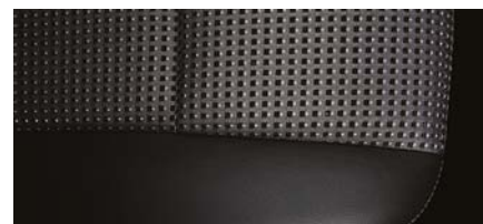
LT - JET BLACK PART LEATHER