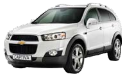
White Pearl (Metallic)