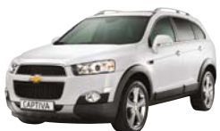
Olympic White (Solid)