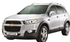
Ice Silver (Metallic)