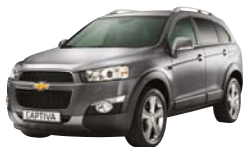
Thunder Grey (Metallic)