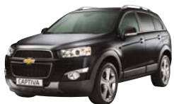
Carbon Flash (Metallic)