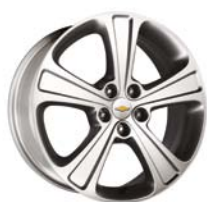
19" ALLOY WHEEL **