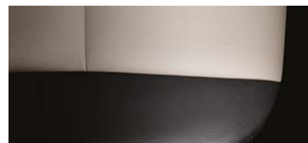
LTZ - JET BLACK / LIGHT TITANIUM LEATHER ***