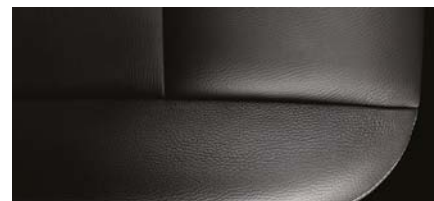
LTZ - JET BLACK LEATHER