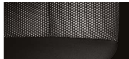
LS - JET BLACK CLOTH