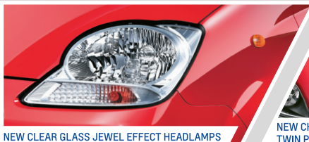
NEW CLEAR GLASS JEWEL EFFECT HEADLAMPS