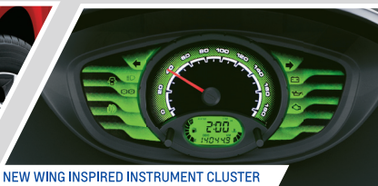
NEW WING INSPIRED INSTRUMENT CLUSTER