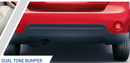
DUAL TONE BUMPER