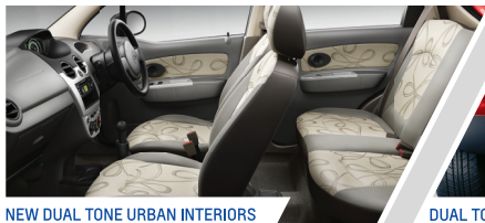
NEW DUAL TONE URBAN INTERIORS