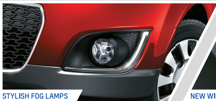
STYLISH FOG LAMPS