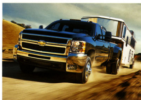
Silverado 3500HD Big Dooley Crew Cab Long Box LTZ 4x4 in Black with available features.

SILVERADO HD. Some jobs need the muscle of a Silverado HD. Add in the legendary strength of the available DURAMAX 6.6L TURBO-DIESEL V8 engine and ALLISON® TRANSMISSION for more horsepower and torque than any other heavy-duty diesel. 5 Plus, Silverado 2500HD won Vincentric's 2009 BEST VALUE IN AMERICA™ AWARD . 3