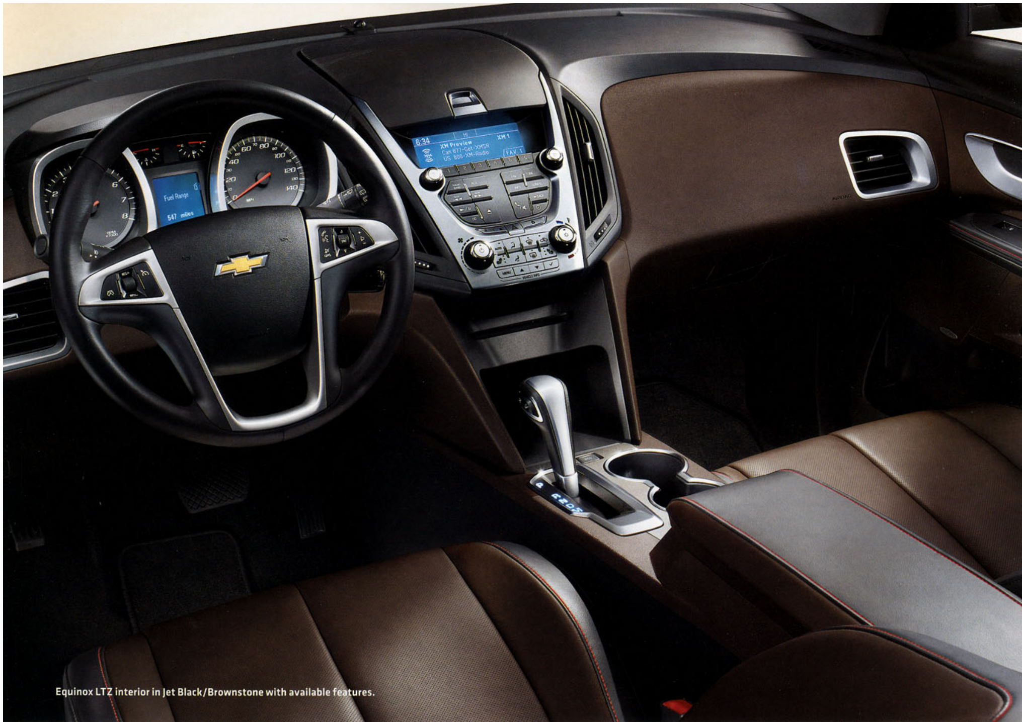
Equinox LTZ interior in Jet Black/Brownstone with available features.