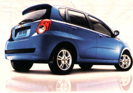
Aveo5 LT in Bright Blue with available features.

AVEO. The sensible yet stylish Aveo offers up to 35 MPG HIGHWAY 8 . It comes in TWO BODY STYLES – Sedan and Aveo5. And with ONSTAR 7 standard for the first year, Aveo is as smart as it is fuel-efficient.