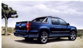
Avalanche LTZ in Imperial Blue Metallic with available features.

AVALANCHE. The MOST FLEXIBLE VEHICLE out there. With its GM-EXCLUSIVE MIDGATE 3 , Avalanche provides AMAZING VERSATILITY by transforming from a six-passenger SUV into a full-size pickup with an 8' 2" cargo bed 4 in less than a minute.