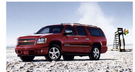
Suburban LTZ in Red Jewel Tintcoat (extra-cost color) with available features.

SUBURBAN. When everyone wants to go, Suburban is what to drive. With available SEATING FOR UP TO NINE and up to 9,600 pounds 1 of TOWING CAPABILITY (3/4-ton models), Suburban has the room and the capability you need.