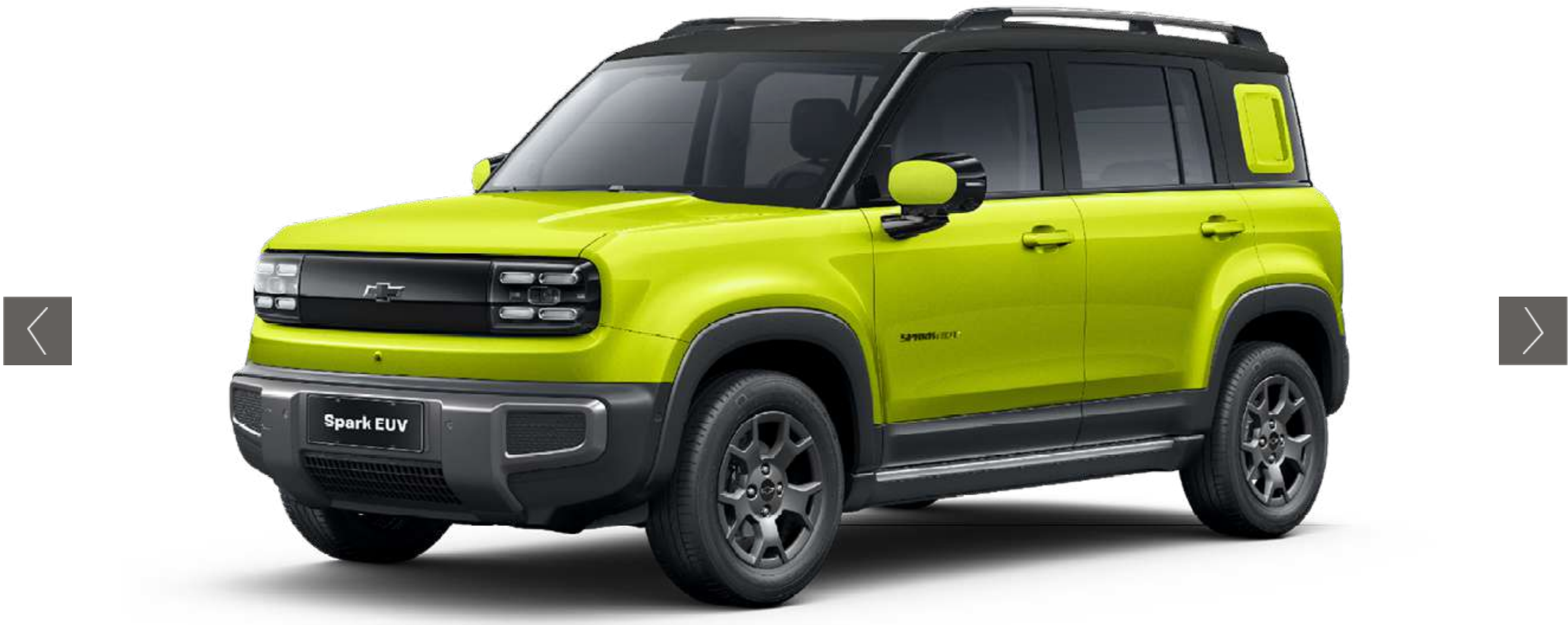
Track Yellow – Star Twinkle Black Roof