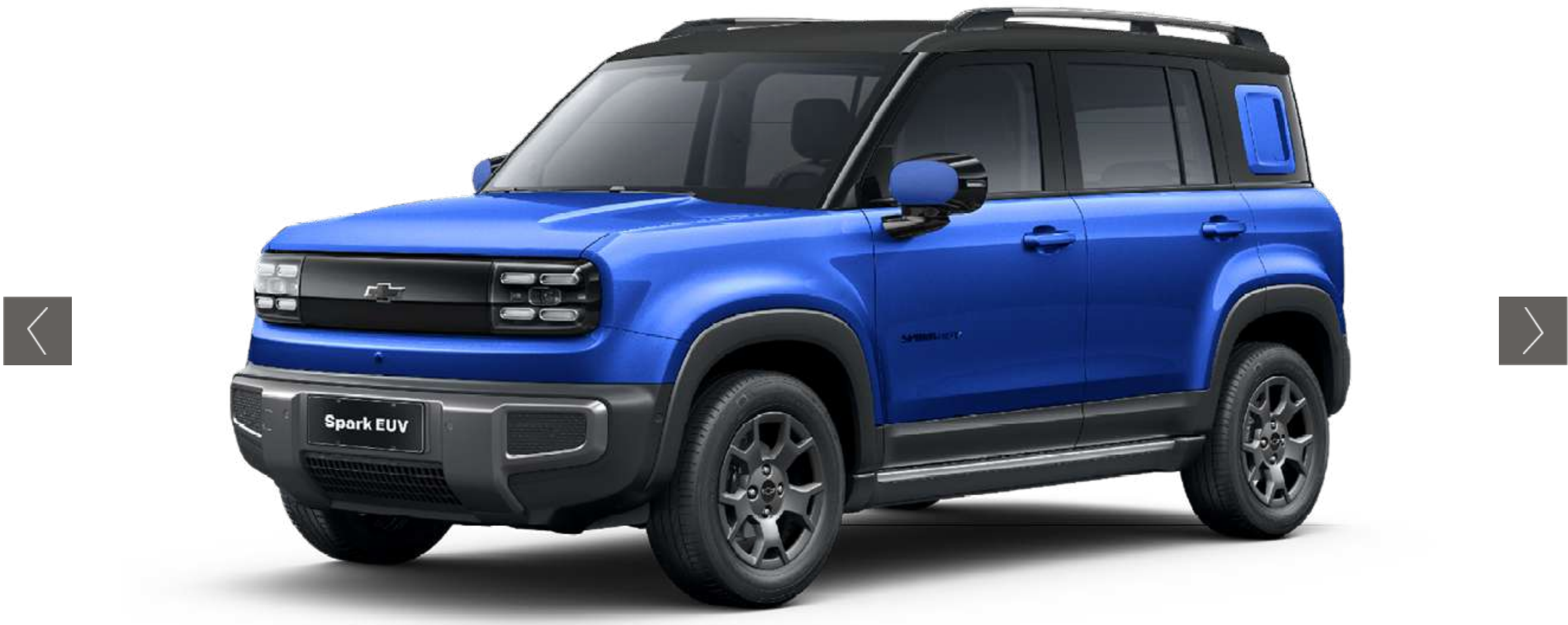
Tiger Blue - Star Twinkle Black Roof