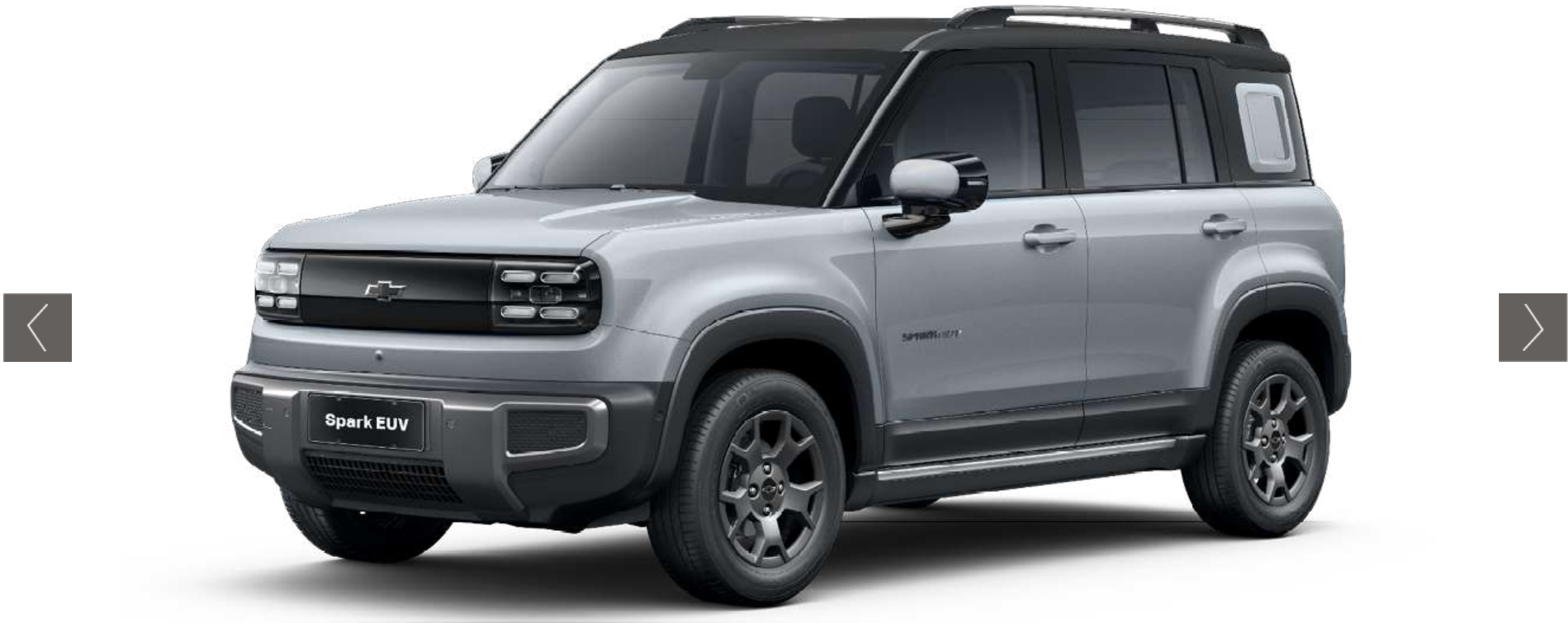
Gentle Gray - Star Twinkle Black Roof