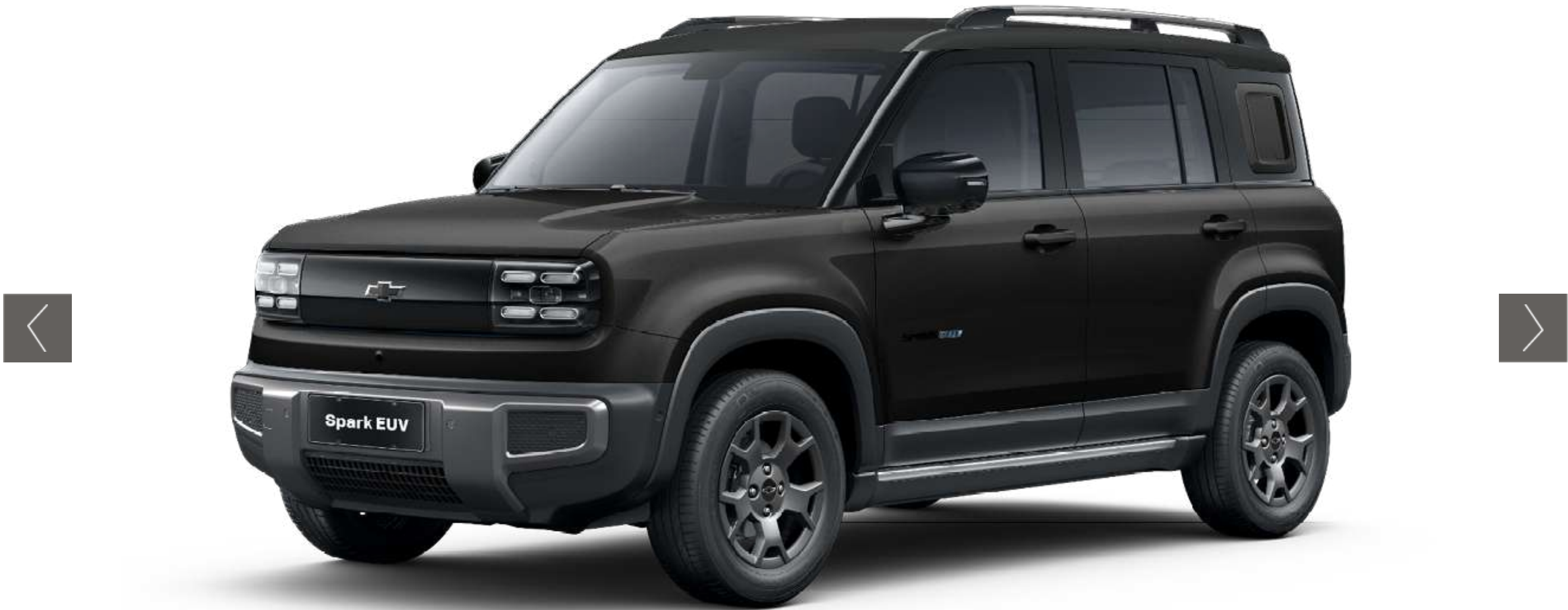
Star Twinkle Black