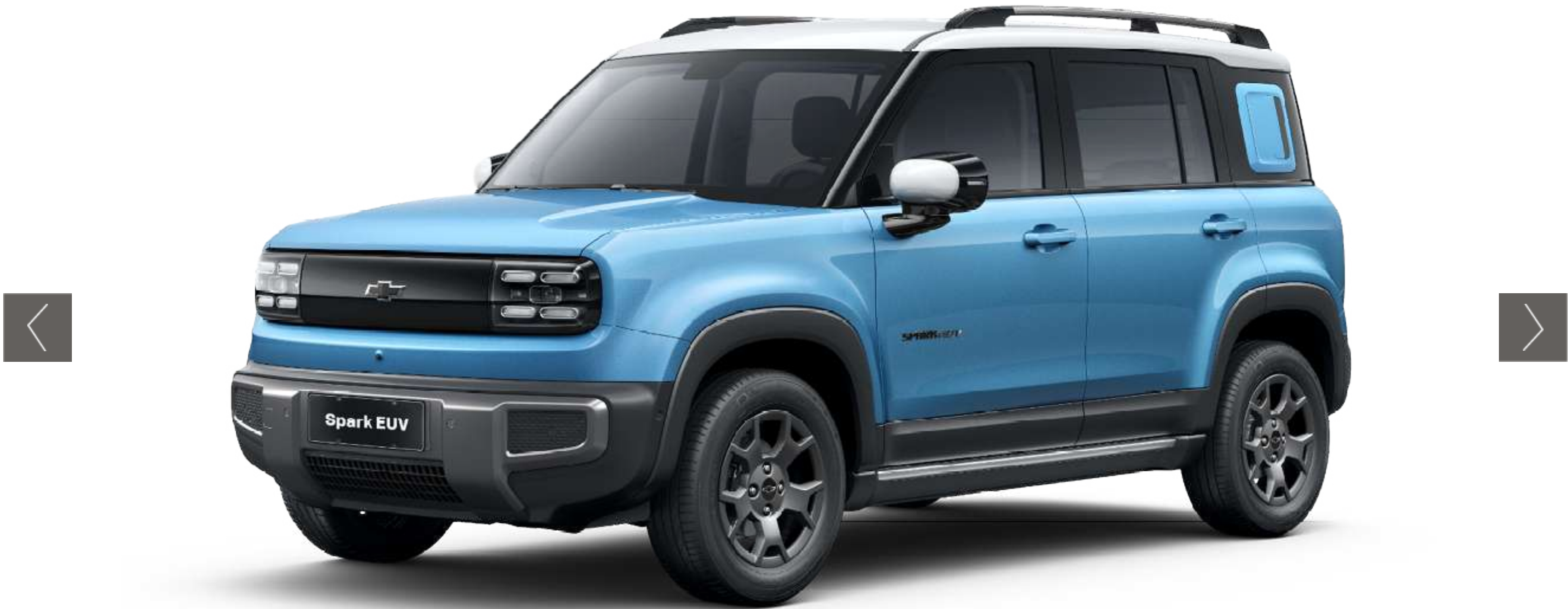
Sea Blue - Polar White Roof