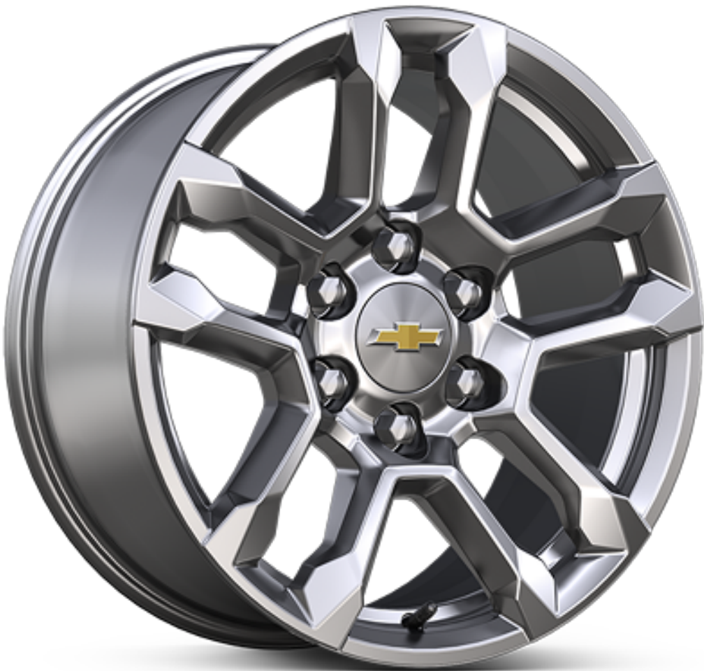
18" Bright Silver Painted Aluminum