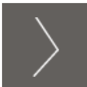
SUMMIT WHITE 1