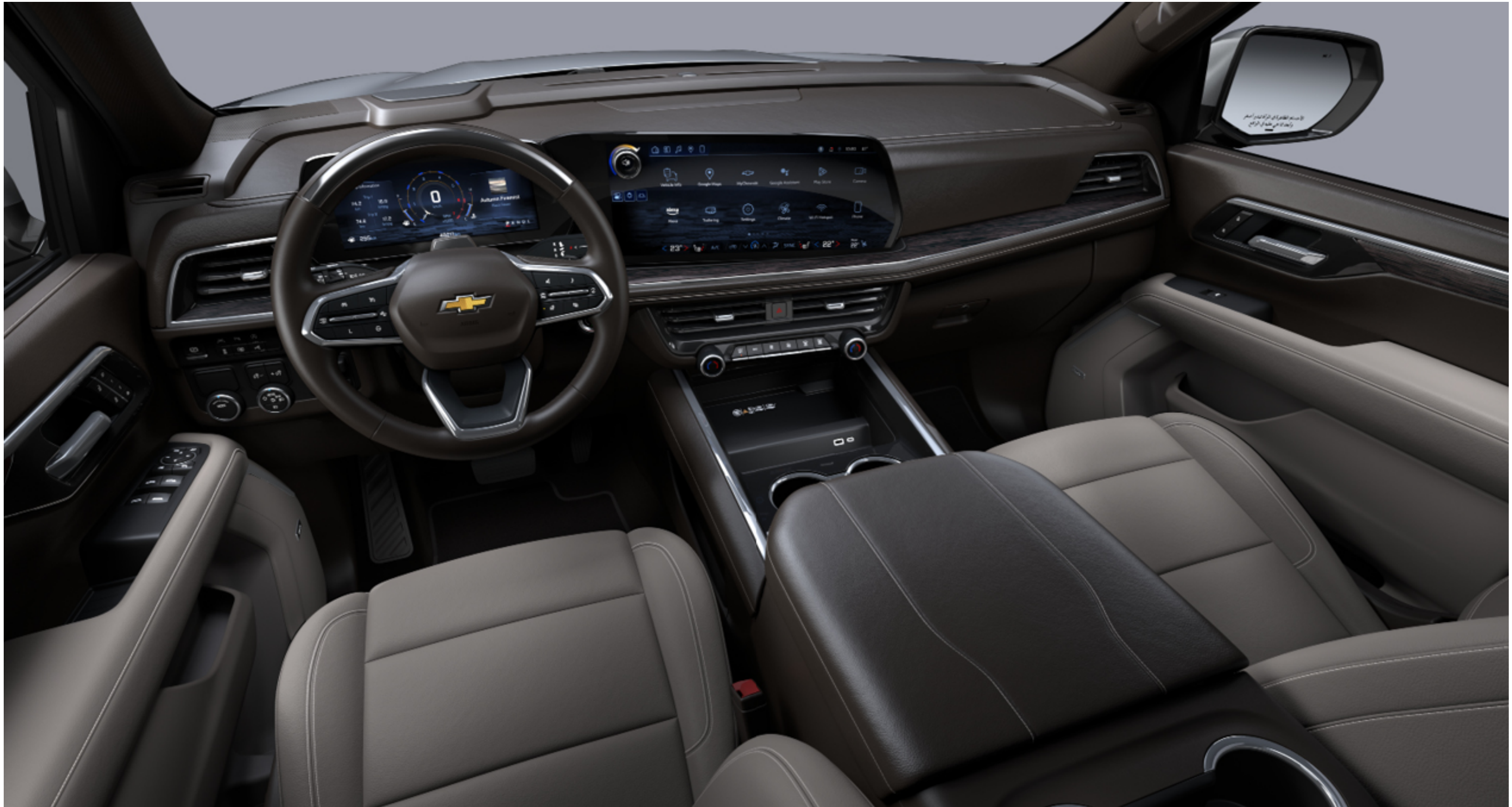
Gideon/very dark atmosphere leather interior