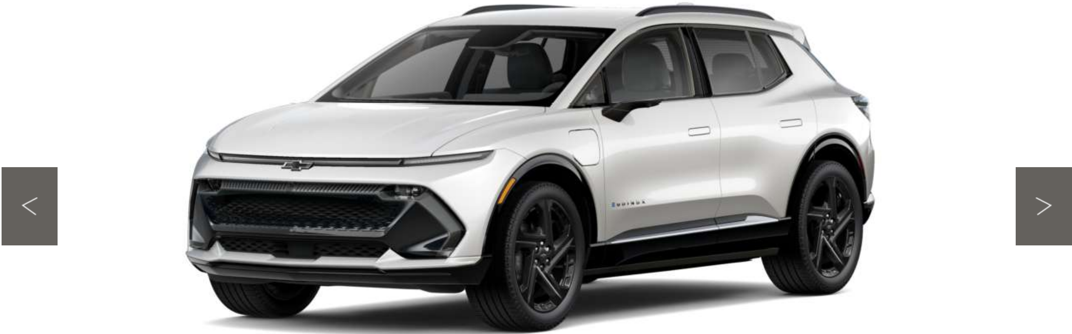
Iridescent Pearl Tricoat