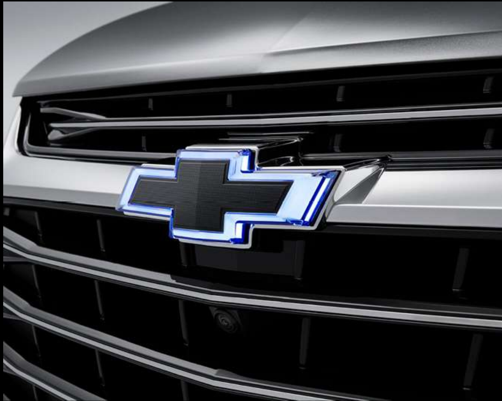
Front illuminated and rear non-illuminated bowtie emblems in Black from Chevrolet Accessories. 1