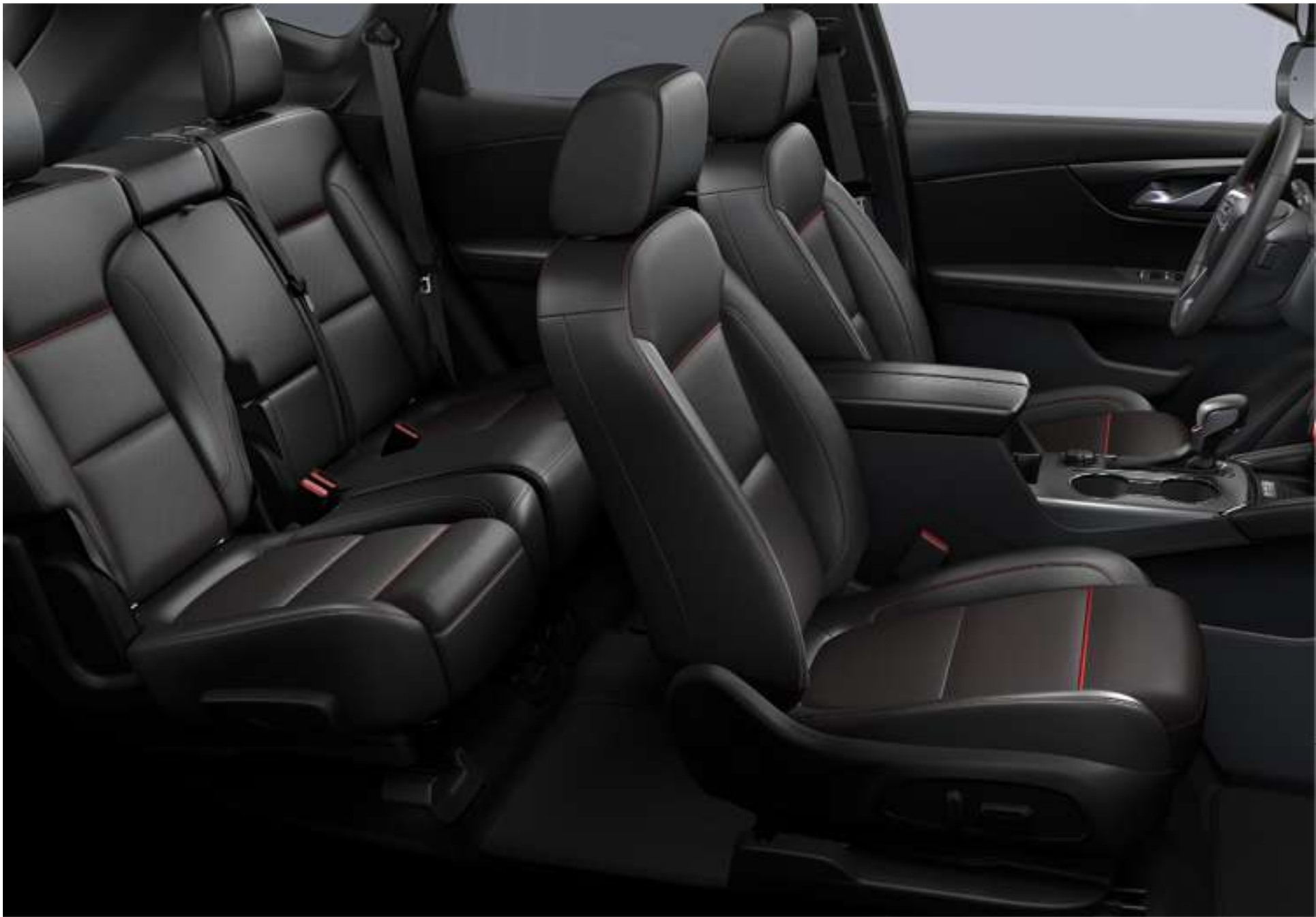
Jet Black Perforated with Red Accents preforated leather-appointed