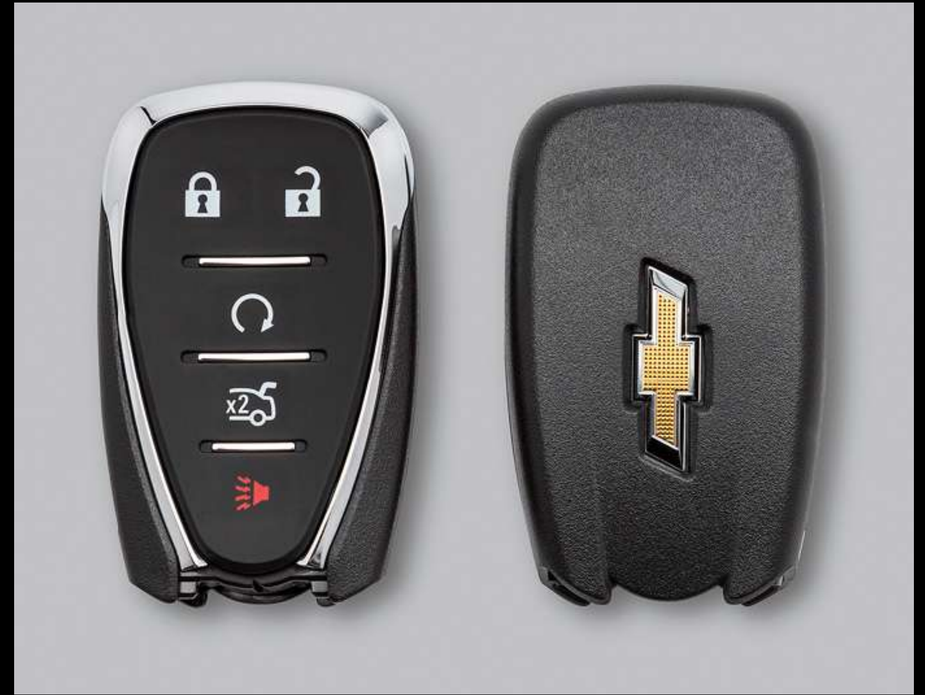
Remote Start from Chevrolet Accessories. 1