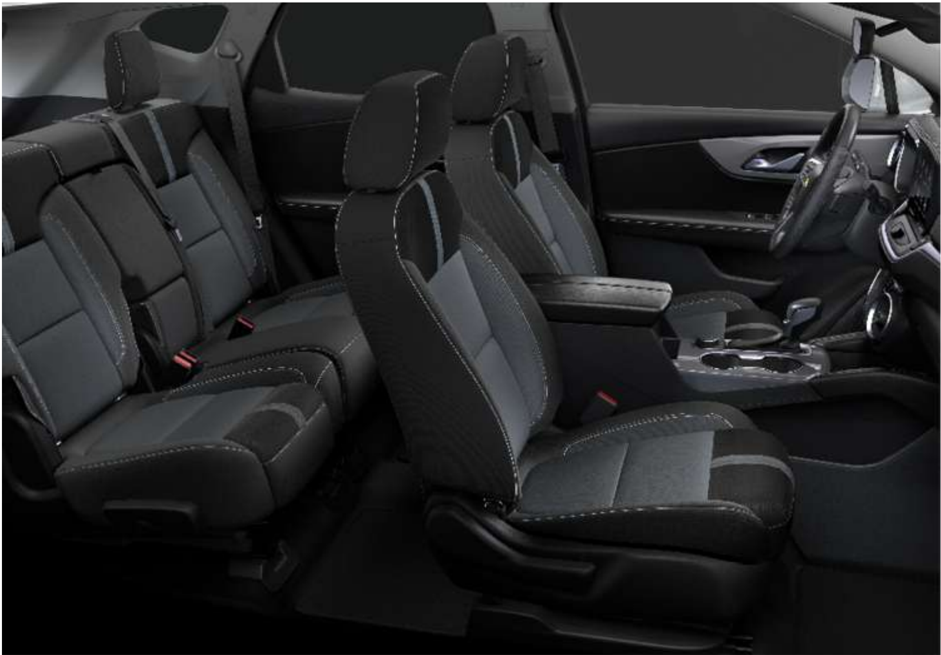
Jet Black with Medium Gray Premium Cloth