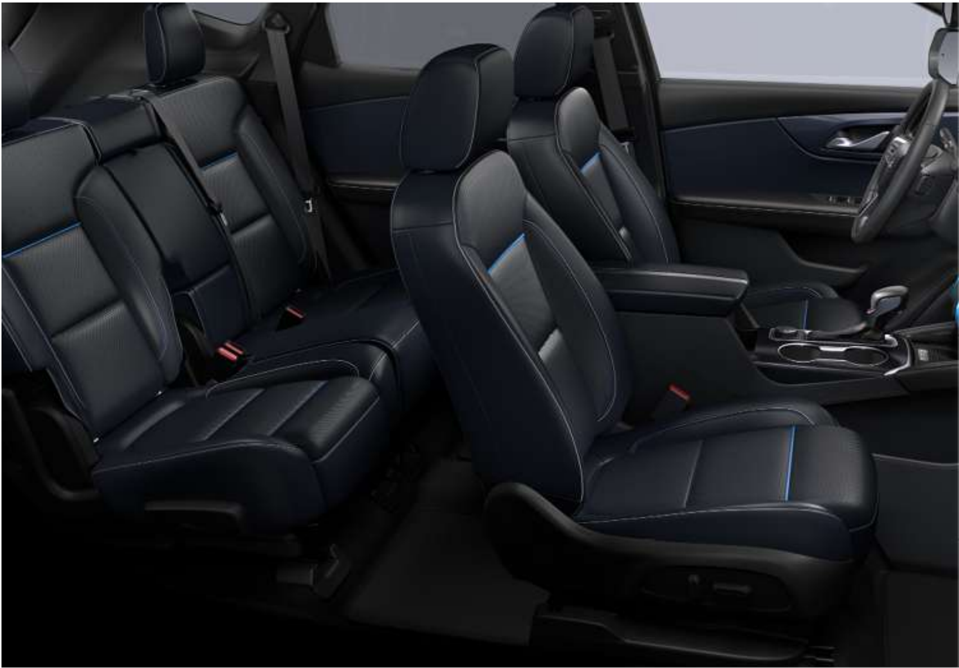
Jet Black/Nightshift Blue preforated leather-appointed