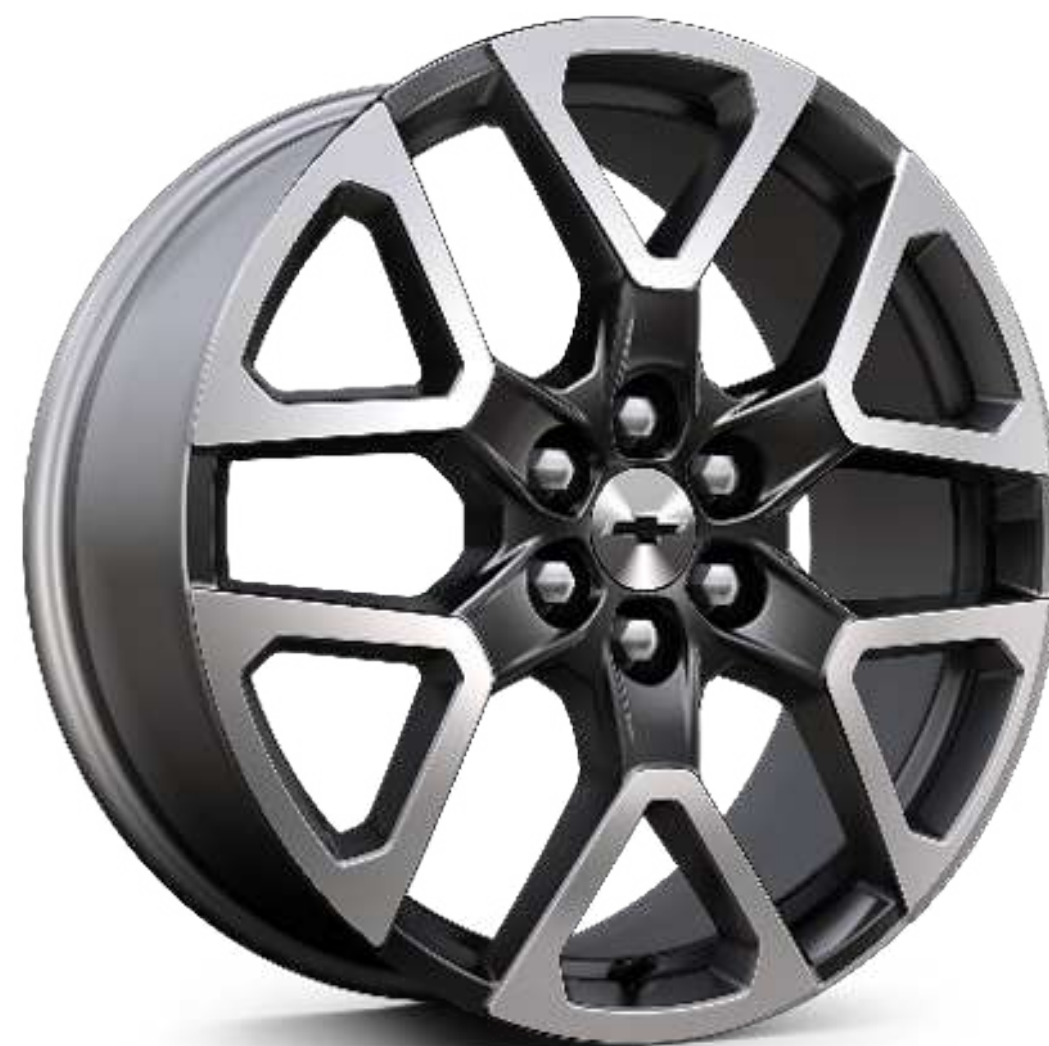
20" Technical Gray aluminum 1