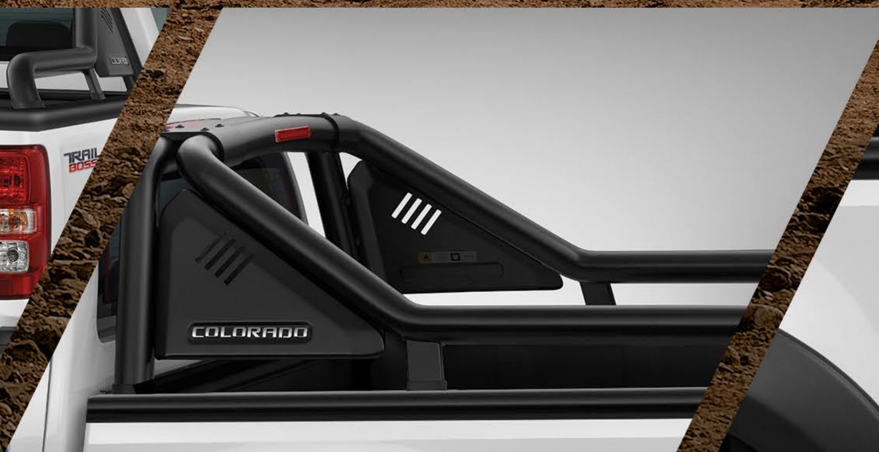
A unique style of sports bar