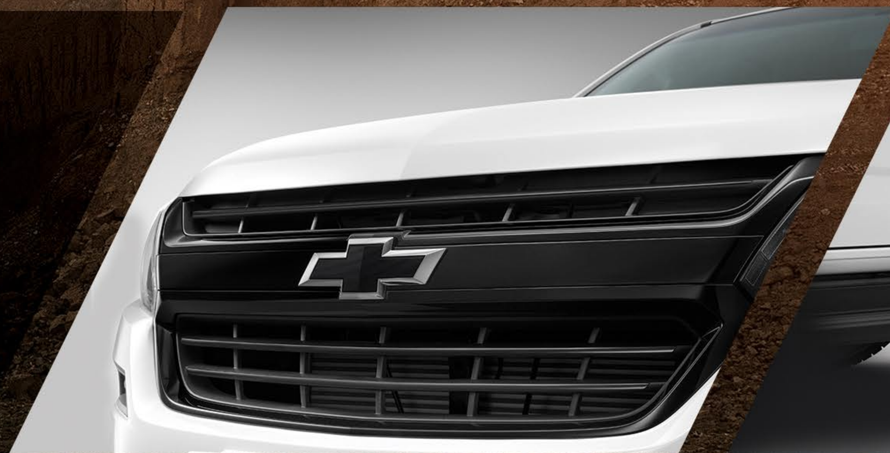
Black badge on black grille