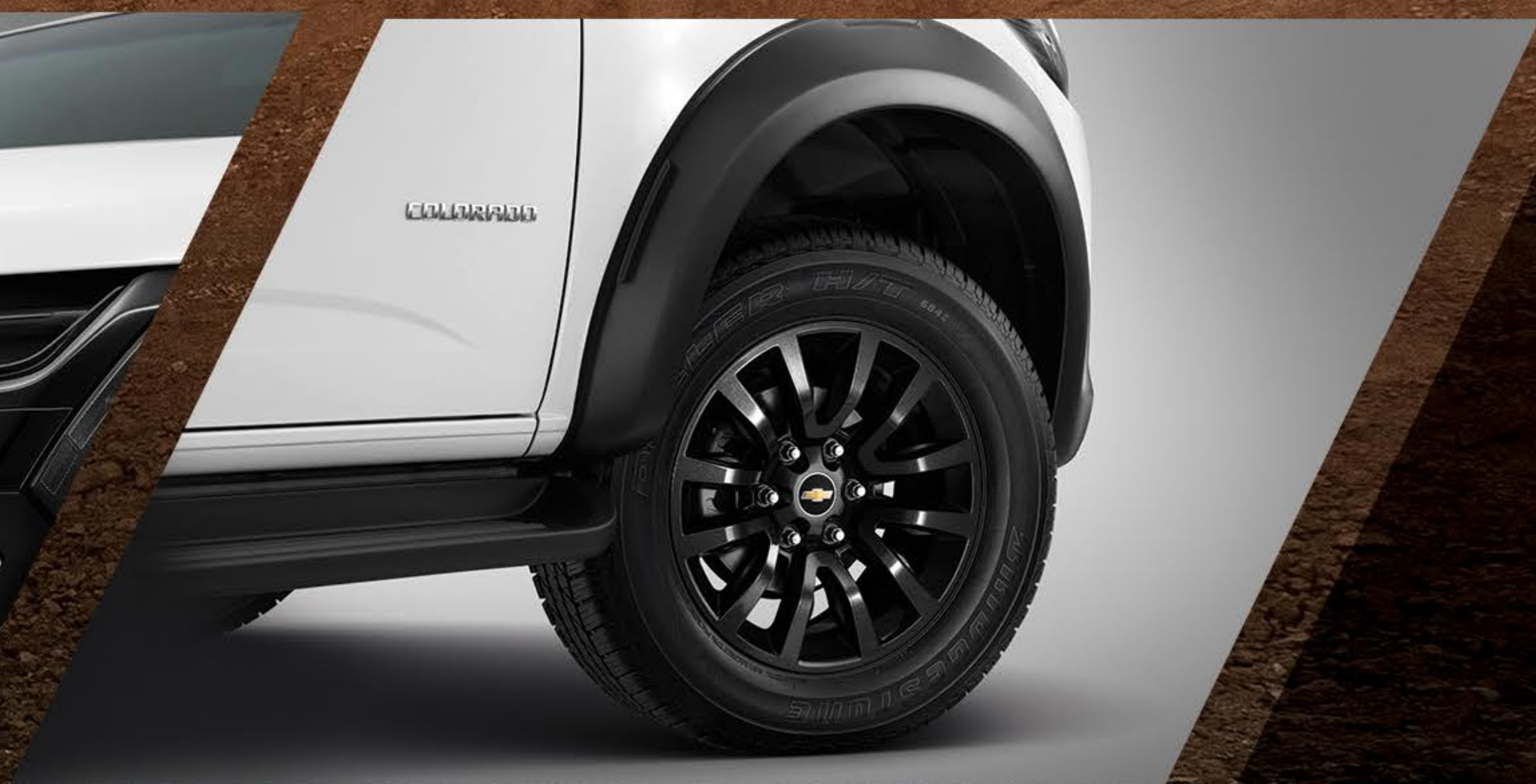
Black fender flares and sporty 18-inch alloy wheel