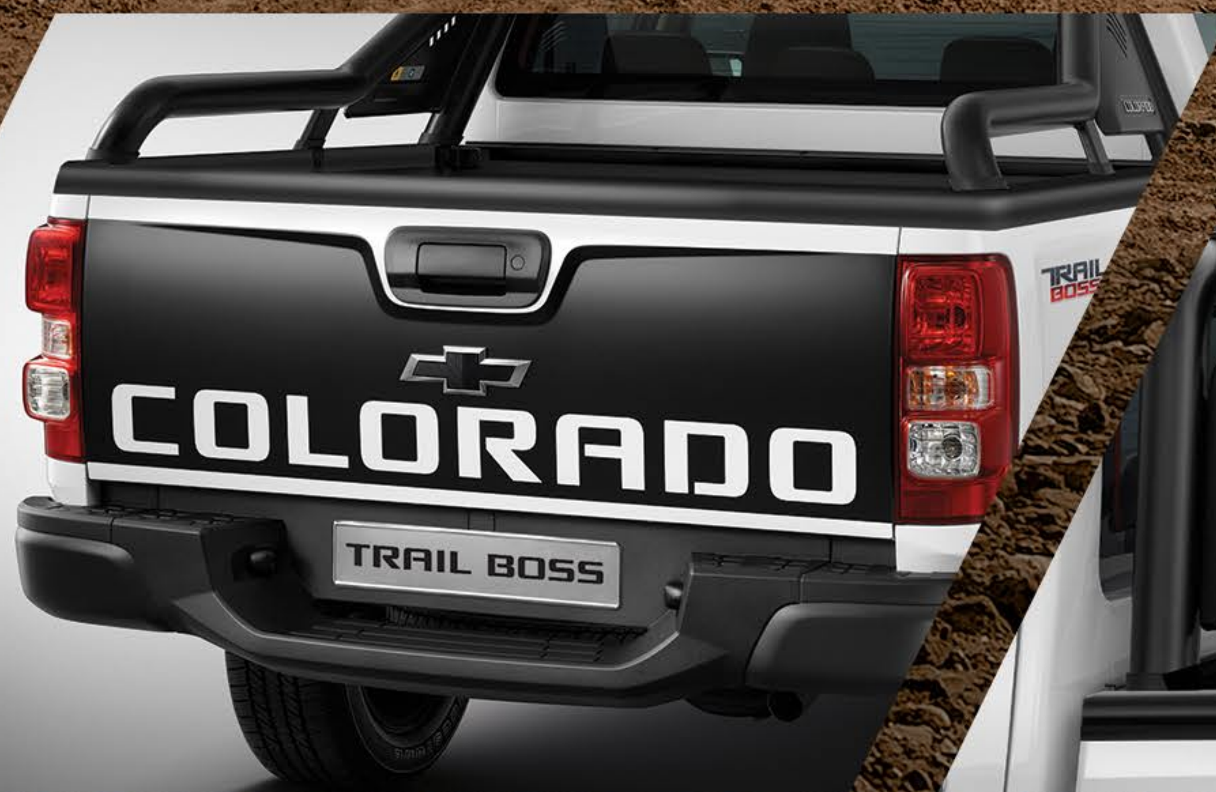
Colorado black decal on tailgate