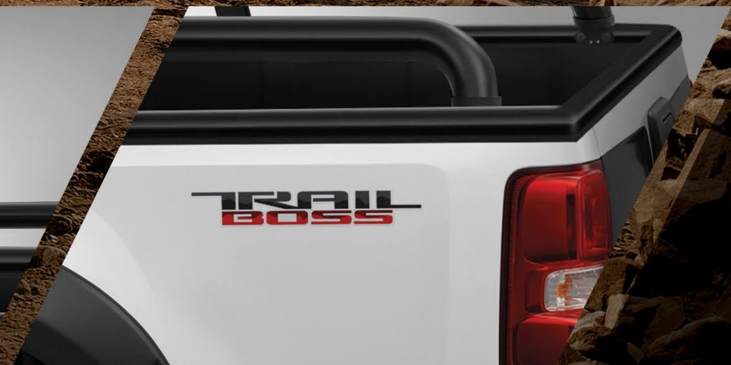
Trail Boss decal