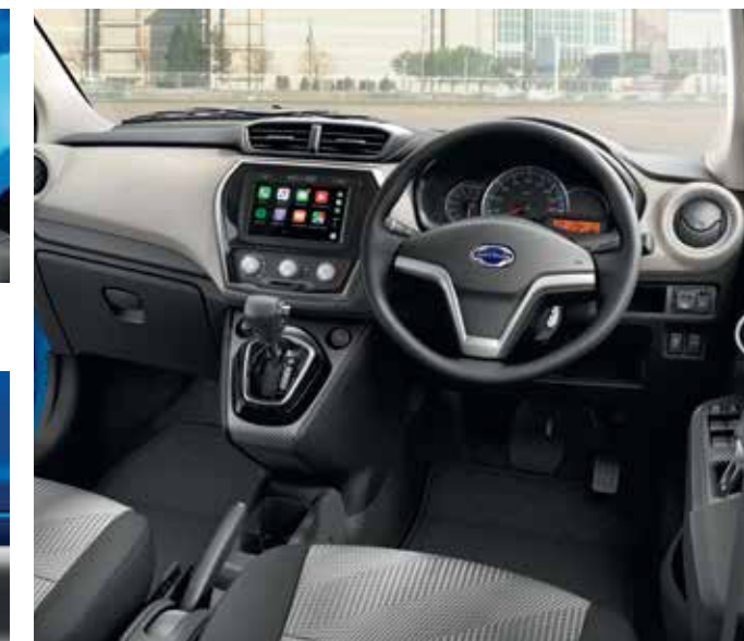
Dual Tone Premium Interiors