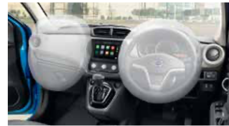
Dual Front Airbags

SAFE Make every drive a safe drive. The Datsun GO+ CVT is packed with next-generation safety features.