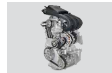
Powerful 1.2L Engine

SURE Tried and tested Japanese Engineering.