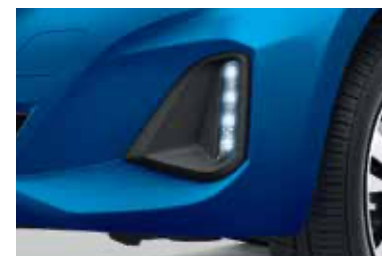
Stylish LED DRLs

STYLE Turn heads on the road with a dazzling range of new generation features.