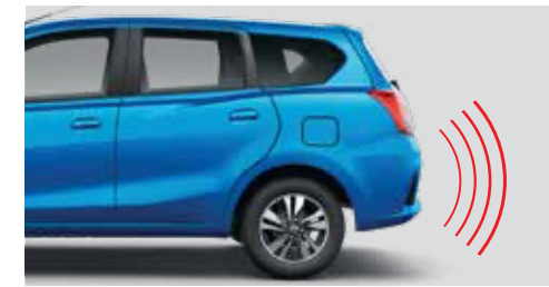
Reverse Parking Sensor

SMART We know what you need in your car. And have designed it accordingly.