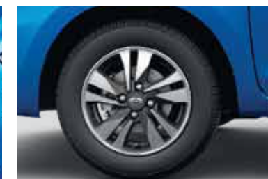
Diamond-Cut R14 Alloys