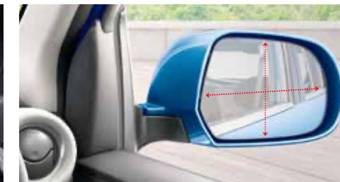
Electric Adjustable ORVMs