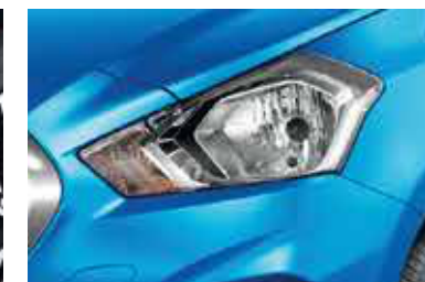
Headlamps with Follow-Me-Home Feature