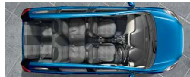
5+2 Flexi Seating

SPACE Designed to maximize comfort while reducing fatigue.