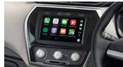
17.64cm (7.0) Touchscreen with Advanced Infotainment System

SMART We know what you need in your car. And have designed it accordingly.