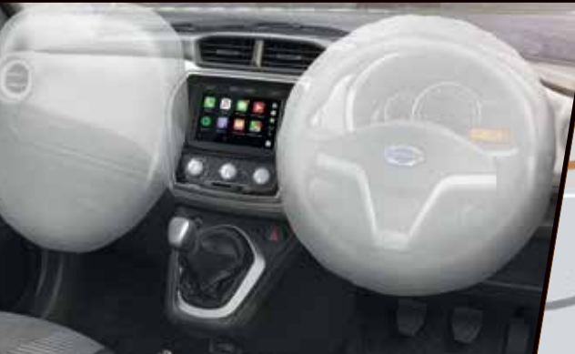
Dual Front Air-Bags

Make every drive a safe drive. The Datsun GO+ is packed with next generation safety features to keep you and your loved ones safe.