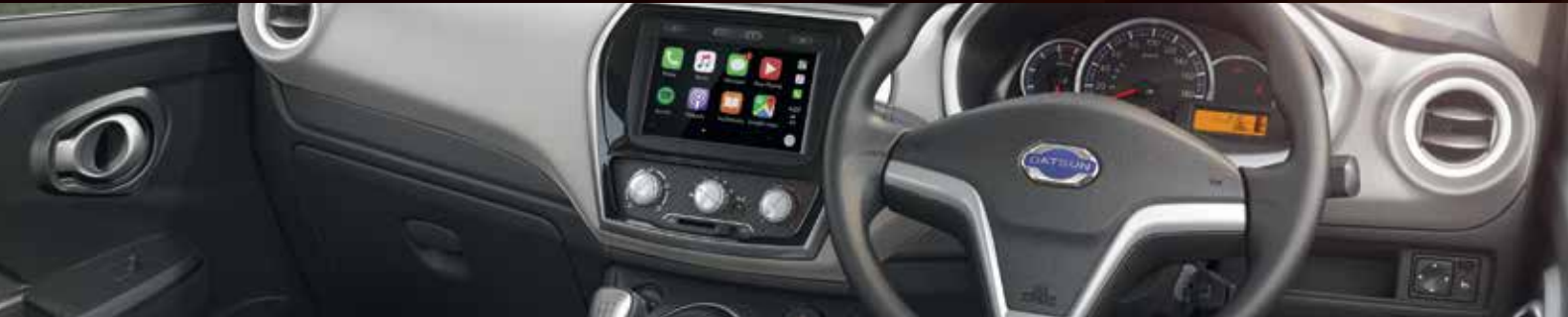
Dual Tone Premium Interiors

Turn heads on the road with a dazzling range of new generation features.