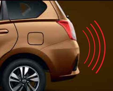
Reverse Parking Sensor