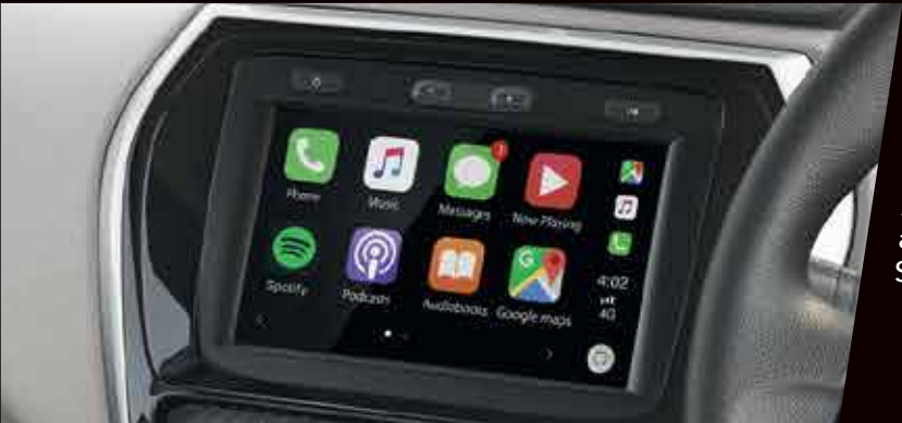
7.0 Touchscreen with Advanced Infotainment System

Enjoy your favourite music. Navigate your way. And stay connected on the go with the Android Auto and Apple Car Play on the Advanced Infotainment System with 7.0 capacitive touchscreen.