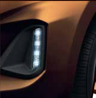
Stylish LED DRLs