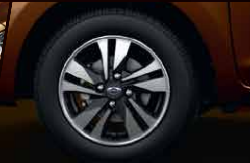
Diamond-cut R14 Alloys