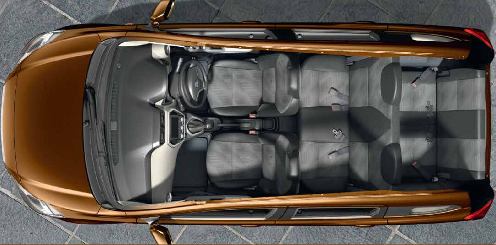
Zero Gravity Inspired 5+2 Seating

We know what you need in your car. And have designed accordingly.